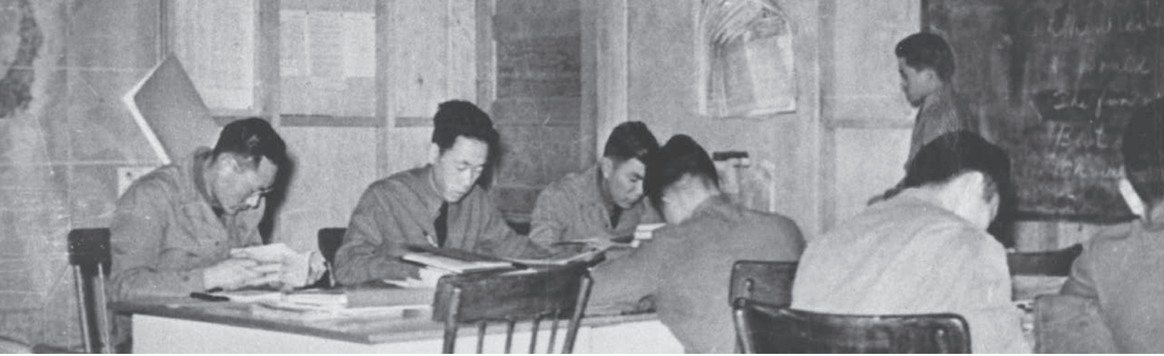
Military Intelligence Service Language School students focus on instruction in their classroom at Crissy Field.

One of the most poignant and sadly ironic home front stories of World War II has deep connections to the Presidio. Even as Presidio officers issued orders to relocate Americans of Japanese ancestry to internment camps after the attack on Pearl Harbor in December, 1941, a secret military language school trained Japanese American soldiers only a half mile away. The loyalty, sacrifice, and accomplishments of the Japanese American soldiers trained at the Presidio and elsewhere were recognized at the highest levels, but the nation forced their families to endure a very different sacrifice as the army uprooted and ordered them into camps far from home.