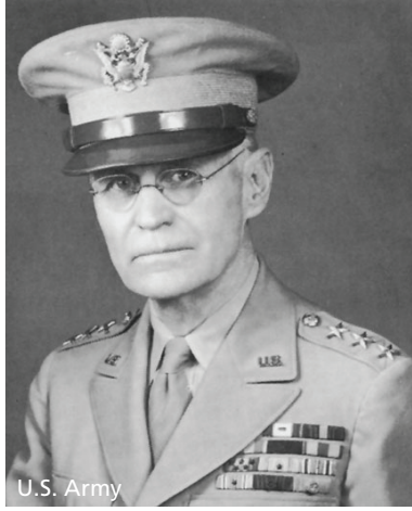
Lt. General John L. DeWitt