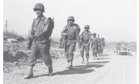
The 442 nd marches in Europe.

In addition to serving as interpreters and interrogators—and despite the internment of their families—many Japanese Americans served the war effort. Nisei soldiers from the internment camps enlisted to fight, and formed a Japanese American combat unit—the 442nd Regiment—in the segregated U.S. Army. This unit joined with another group of Nisei volunteers from Hawaii who had already fought in North Africa and Italy. The exploits of the 100th/442nd are the stuff of legend. They liberated towns in France, rescued other American soldiers, and lived up to their slogan,