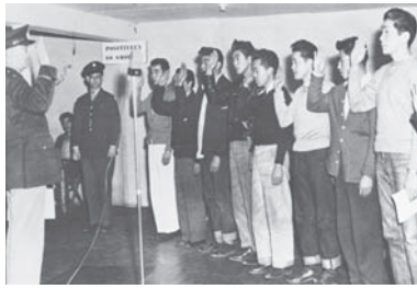
Nisei at Manzanar pledge loyalty to the U.S. and are sworn in as 442 nd volunteers in 1943.

In addition to serving as interpreters and interrogators—and despite the internment of their families—many Japanese Americans served the war effort. Nisei soldiers from the internment camps enlisted to fight, and formed a Japanese American combat unit—the 442nd Regiment—in the segregated U.S. Army. This unit joined with another group of Nisei volunteers from Hawaii who had already fought in North Africa and Italy. The exploits of the 100th/442nd are the stuff of legend. They liberated towns in France, rescued other American soldiers, and lived up to their slogan,