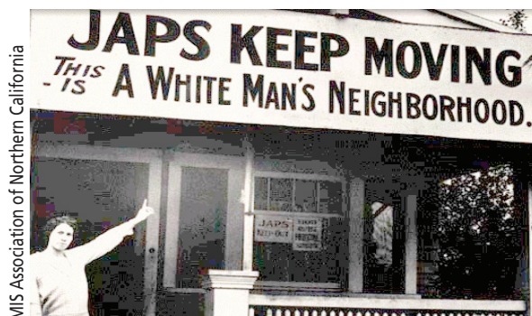
MIS Association of Northern California

Coast of the United States. There was also a widespread (but false) belief that disloyal Japanese American residents in Hawaii had assisted in the Pearl Harbor bombing.