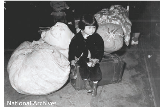
A young evacuee waits with her family's belongings before leaving for an assembly center, 1942.

From his office in Building 35 at the Main Post, General DeWitt issued the orders to relocate over 120,000 Japanese Americans and Japanese immigrants from the West Coast. They were sent to 19 hastily constructed camps across the western states and as far east as Arkansas. They were given short notice to leave their homes and jobs, and allowed to bring only what they could carry. Many families were forced to sell their homes and farms at an enormous economic loss.