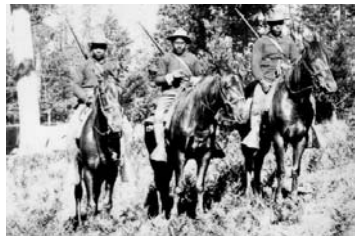
NPS, YOSEMITE RESEARCH LIBRARY

The U.S. went to war with Spain in 1898. Large tent camps spread across the Presidio as troops awaited shipment to the Philippines during this short war and the following Philippine War. Returning sick and wounded were treated in the Army's first permanent general hospital, later named Letterman.