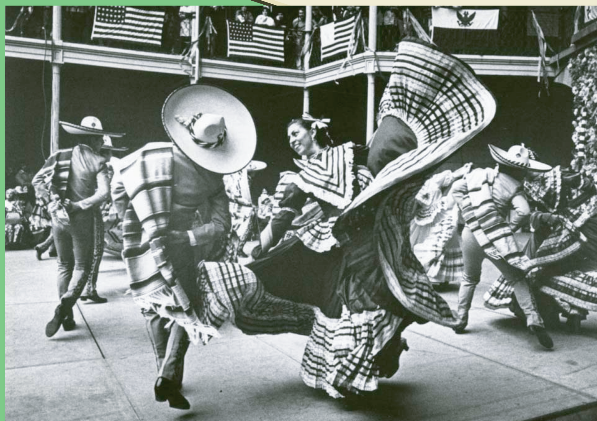
Mexican dancers celebrate their local heritage at Fort Point