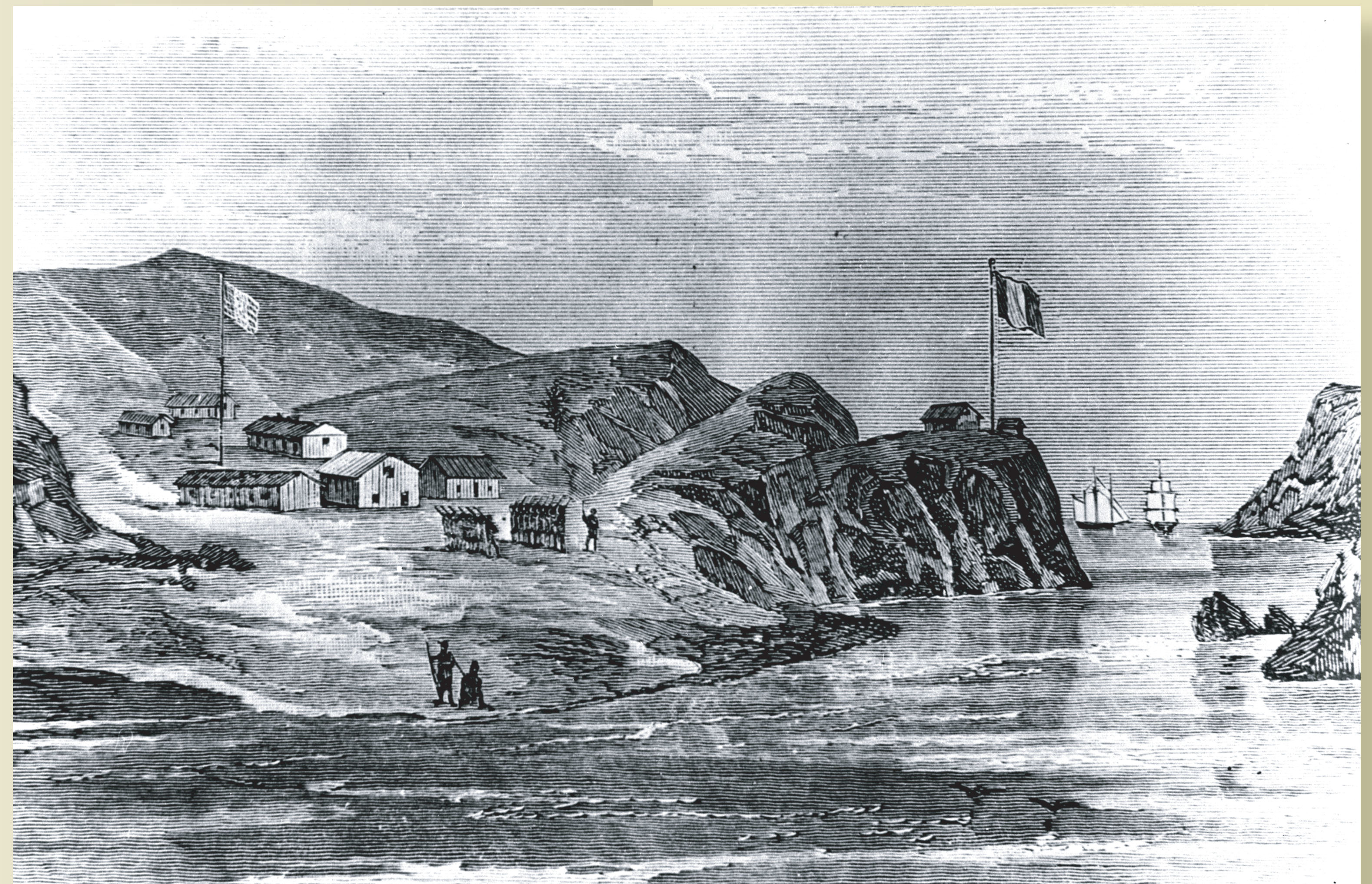
Fort San Jose and The Golden Gate During Mexican Regime

General Mariano Vallejo transfers military headquarters to Sonoma.