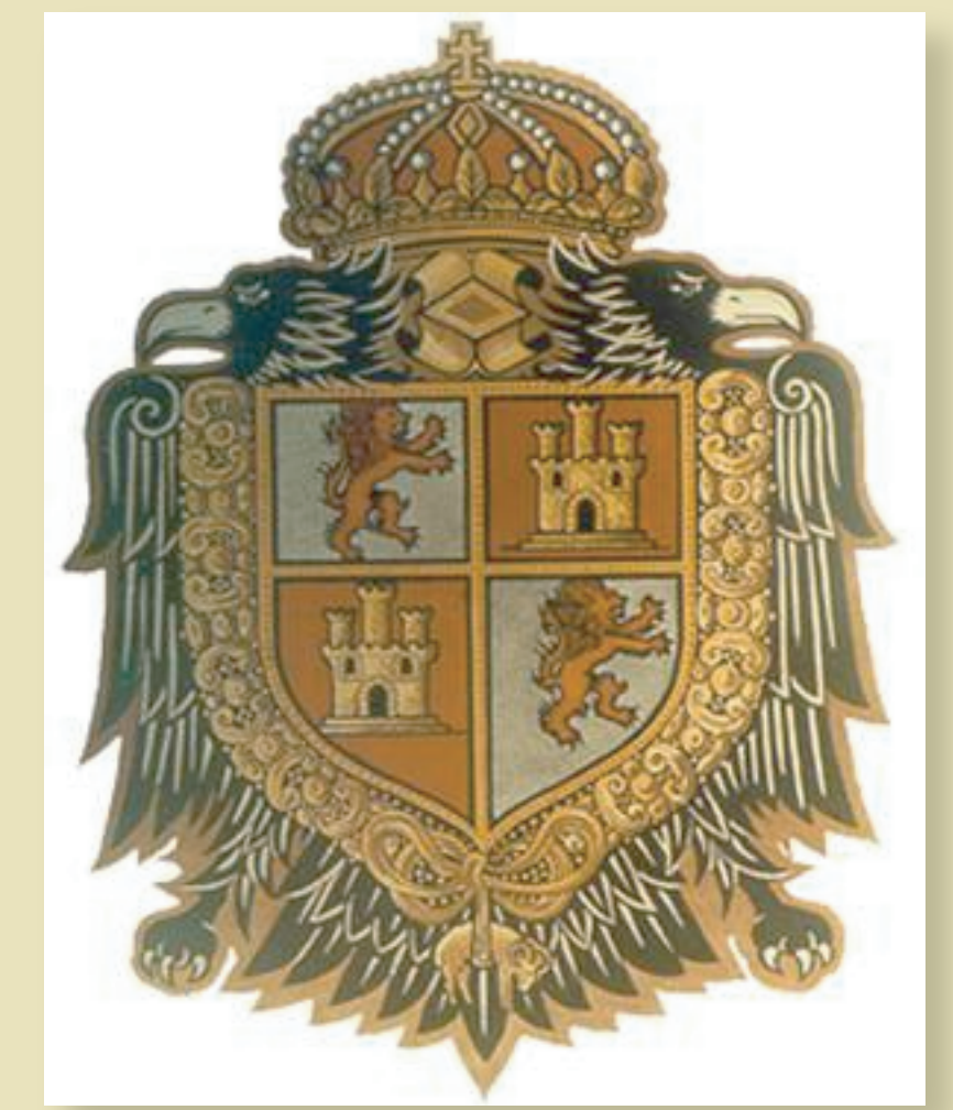
The crest of the Presidio U.S. Army Post, adopted from Spanish heraldry

Northern-most outpost of the Spanish territories. El Presidio is outfitted with two cannons and soldiers are garrisoned at the site for the protection of Spanish settlers, development of the community, and control of the native population.