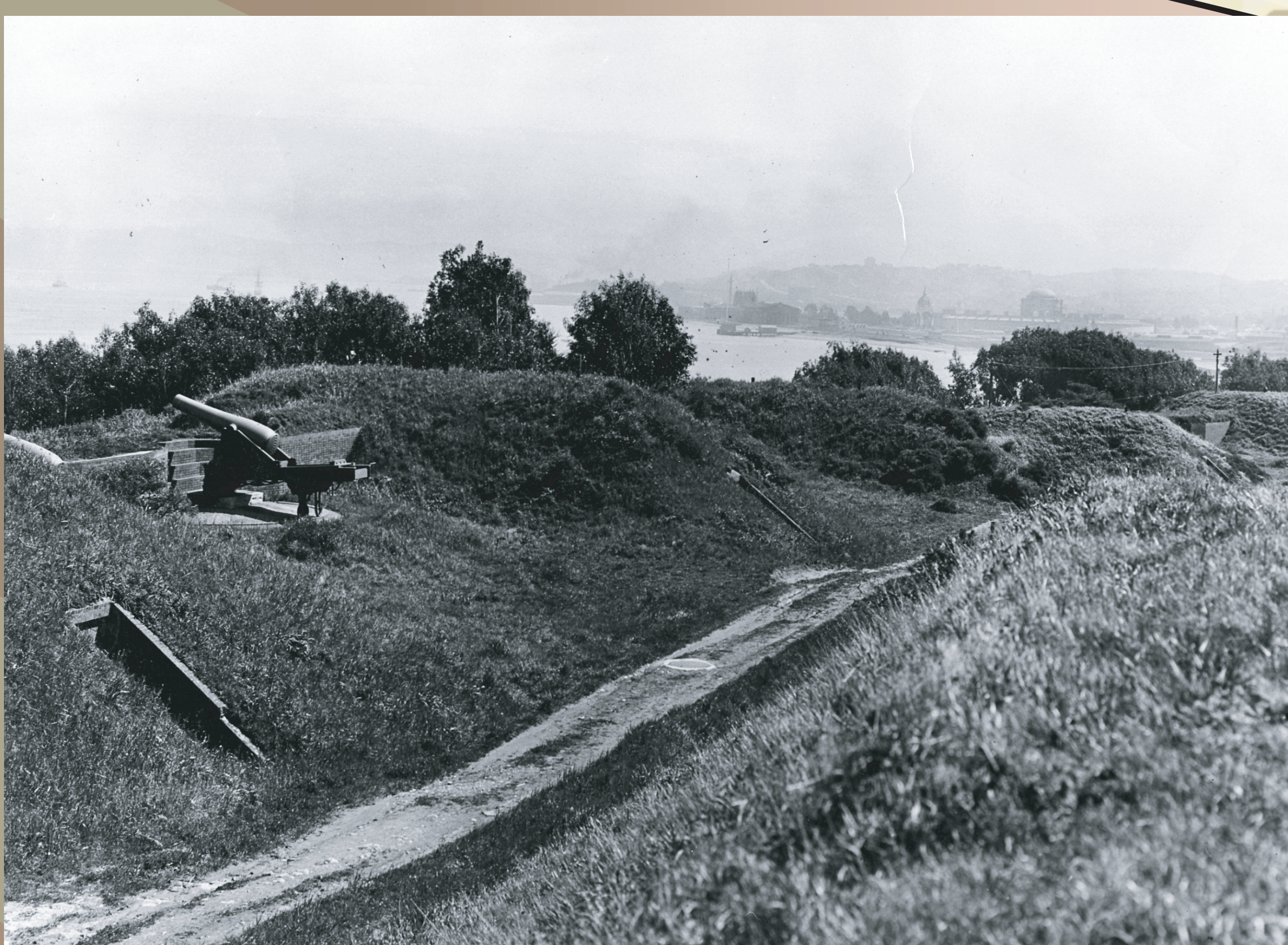
GGNRA, Park Archives, Fort Point Photo Collection, GOGA 35339 Battery East

War Department designates the Presidio's former post cemetery and surrounding land as the first National Cemetery on the west coast.