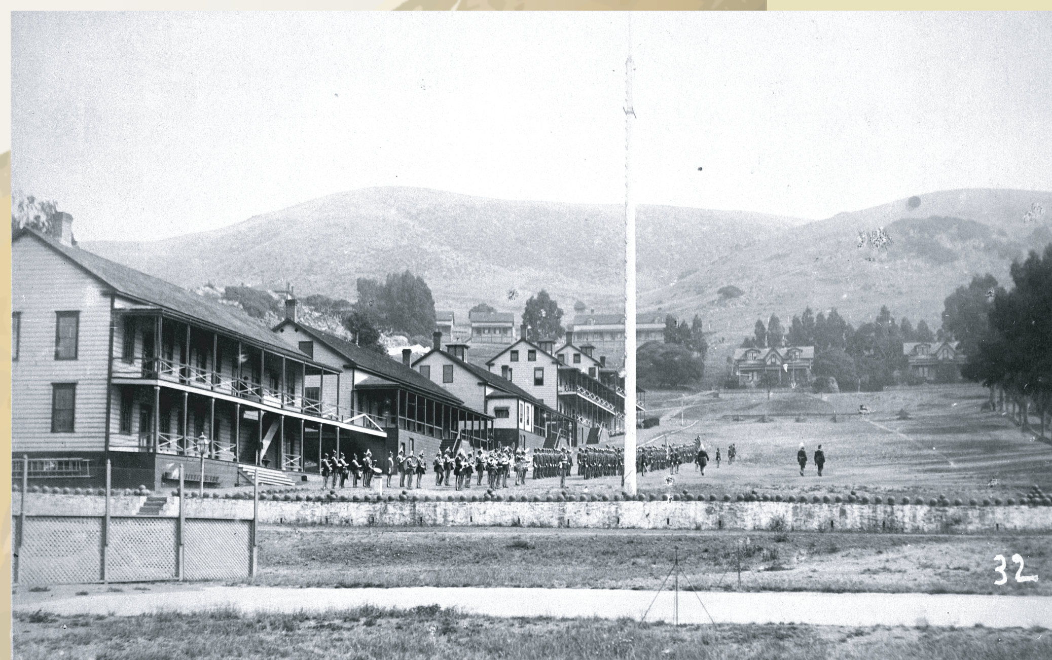
Camp Reynolds, Angel Island

Defensive construction and protection methods evolved as new coastal batteries were shielded by earth barriers presenting low ground positions. Some examples include Battery Cavallo in Fort Baker and Battery East in the Presidio.