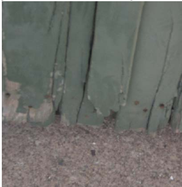
Fig. 45: Mechanical deterioration of doors of the Shop & Garage associated with cross-grain dragging.

Description/Condition: Biological growth includes algae, lichen and fungi. The beginnings of these problems are evident in the staining visible at the damp, shaded areas of the exteriors, particularly the