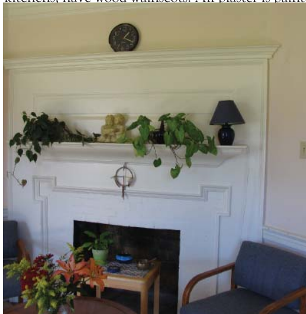
Fig. 63 :Painted wood fireplace, mantle, and wooden elements at the Officer in Charge Quarters.

Description: All of the first floor walls and most second floor perimeter walls of the Officer in Charge Quarters are flat plaster over wood lath. The lower areas of walls in some spaces, such as hallways and kitchens, have wood wainscots. All plaster is painted.