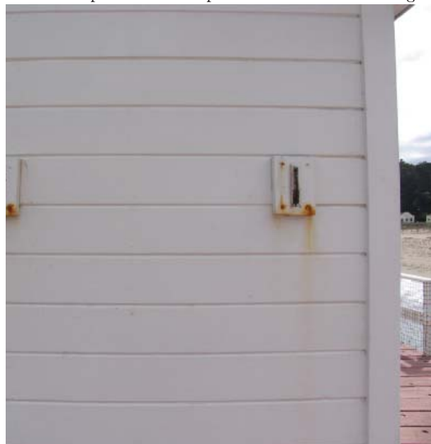
Fig. 43: Corrosion staining from embedded hardware at the Buoy Shack

Replacement components - non-contributing