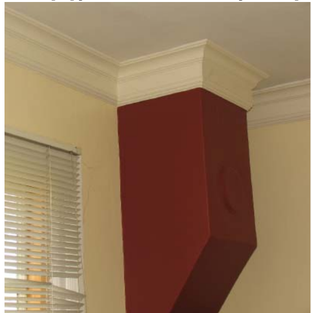
Fig. 74 : Flue and flue cover at the Officer in Charge Quarters, remnant of earlier stove heating system.