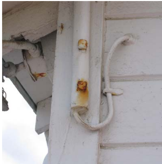
Fig. 40 : Corroded ferrous metal hardware is embedded in the shingles