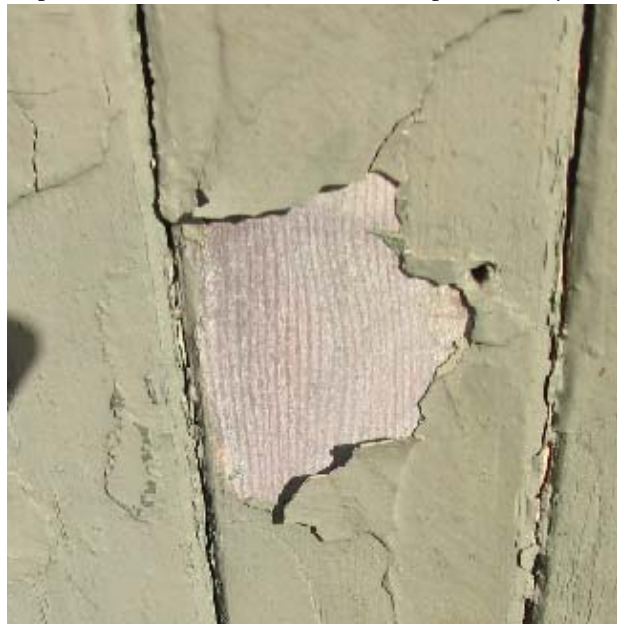
Fig. 46: Paint failure on the doors of the Shop & Garage.