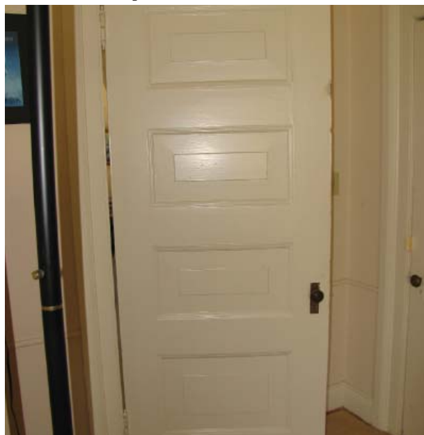
Fig. 67 : Most of the doors appear to be in good condition, with only minor repairs needed.

Description: Extant finish flooring of the Main Boathouse and Officer in Charge Quarters currently includes wall-to-wall carpet over an unknown substrate (see figure 65). The flooring in the 1890 Boathouse, Shop