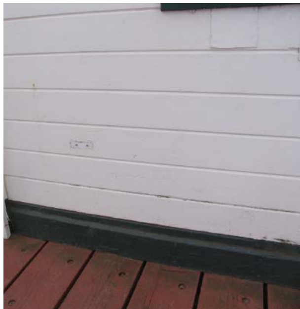
Fig. 44: Inappropriate patching on clapboard wall at the Buoy Shack..