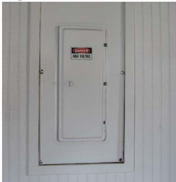
Fig. 72 :Electrical box at the Buoy Shack.