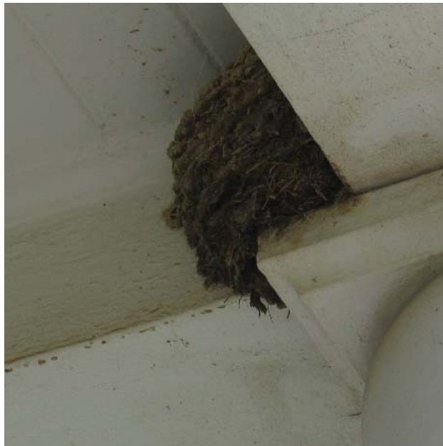
Fig. 57: Mud Swallow nests at the front porch of the Officer in Charge Quarters.

Condition: Generally, the vegetation is well-kept. The trees could potentially cause damage in the event of strong winds. The trees to the west of the 1890 Boathouse and south of the Officer in Charge Quarters are close enough to hold moisture against the buildings and support biological growth (see figure 56).