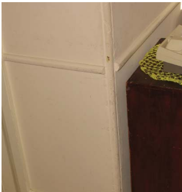
Fig. 59 :Flat plaster wall and corner bead at the interior of the Officer in Charge Quarters.

Description: Other than a few mud swallow nests on the Residence porch, the buildings do not appear to be home to either general or wood destroying pests; however, they should be monitored regularly to avoid future problems. General pests include mice and mud swallows. Wood destroying pests include powder post beetles and fungi.