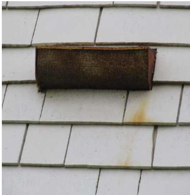
Fig. 39 : Rust stains are evident in the shingled areas.

Condition: The roofs appear to be in good to fair condition. Evidence of water intrusion was observed within the Buoy Shack, which suggests that prior to the application of asphalt shingles, there was extensive shingle deterioration. The wood shingles on the Shop & Garage roof appear to have been recently replaced. The paint is moderately deteriorated but, in general, the existing shingles appear intact. Prolonged exposure