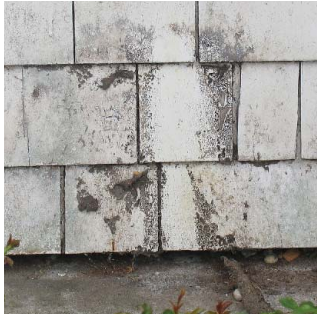
Fig. 50: Shingle soiling and deterioration at the Main Boathouse.