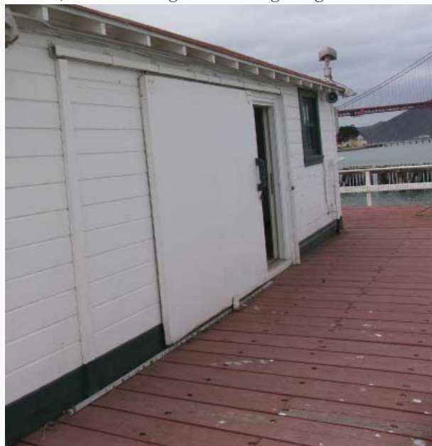
Fig. 47: Sliding wooden door at the Buoy Shack

Recommendations: Perform a detailed cladding survey to identify conditions such as breaks, cracks, loose boards, insect damage and biological growth. If structural repairs require removal of this material, it should