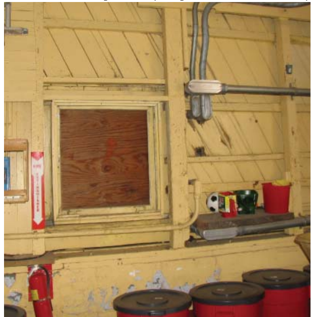
Fig. 62 : Diagonal board walls at the Shop & Garage.