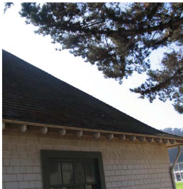
Fig. 56: Overhanging tree limb at the 1890 Boathouse.