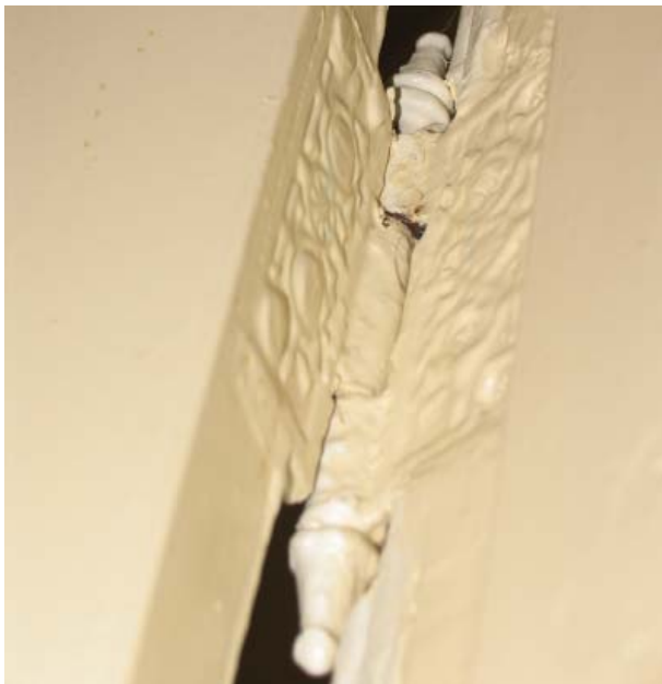
Fig. 69 : Original hardware at the Officer in Charge Quarters.

Description: In general, nearly all doors appear to be original, and hardware also is, for the most part, intact and original. The historic doors are five-panel wood (see figure 67) and tongue-and-groove with diagonal battens and iron hinges (see figure 68). All of the doors have been painted.