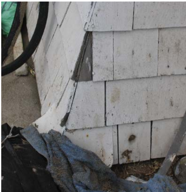
Fig. 49: Loss of shingles at the sloped corner of the Main Boathouse

Recommendation: The existing wall shingles are not severely deteriorated; however, there some are missing and should be replaced. These appear to be holding up well, however shingles have a finite life span, and will someday need to be replaced.