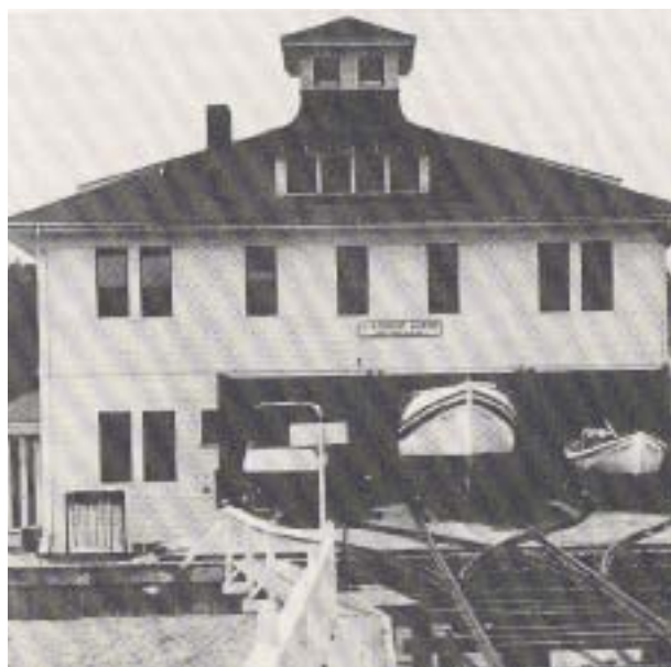
Fig. 37 : North elevation, the original window configuration of the Life Safety Station, 1919.

While preservation is inherently sustainable it is currently difficult to achieve high LEED ratings for historic buildings. As the SGBC refines its ratings, historic preservation will become more integrated into the process. With reference to the GFNMS rehabilitation project, LEED Silver would likely be the