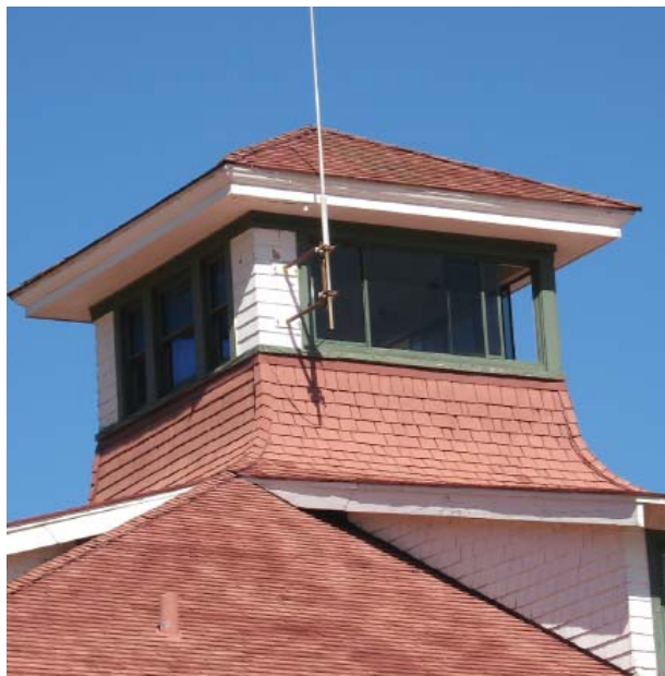
Fig. 53: Aluminum sliding window at the Main Boathouse