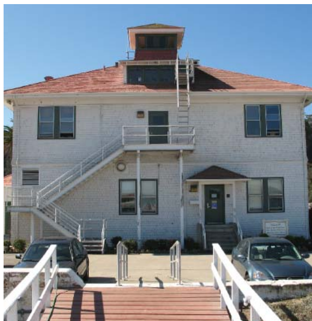
Fig. 38 :North elevation, the current window configuration of the Life Safety Station.