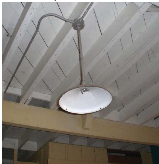
Fig. 71 : Historic pendant light fixture at the Shop & Garage.