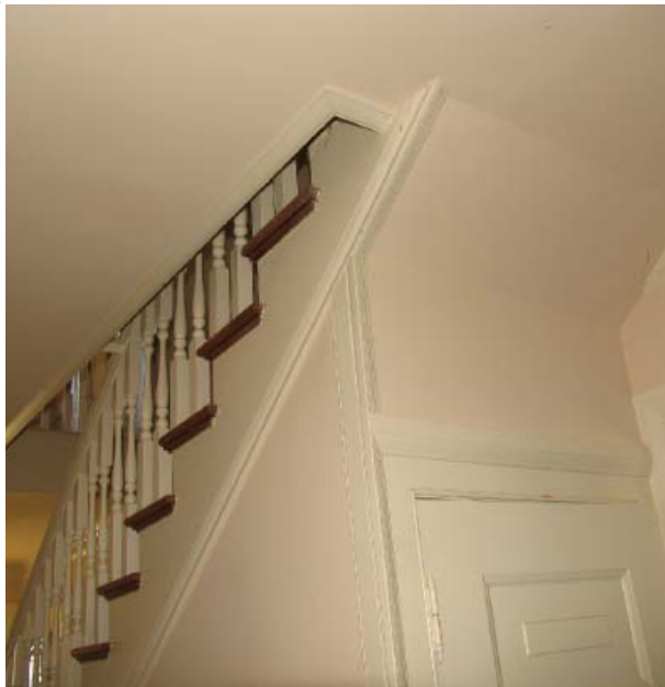
Fig. 64 :Painted wood stair, balustrade, and door at the Officer in Charge Quarters.