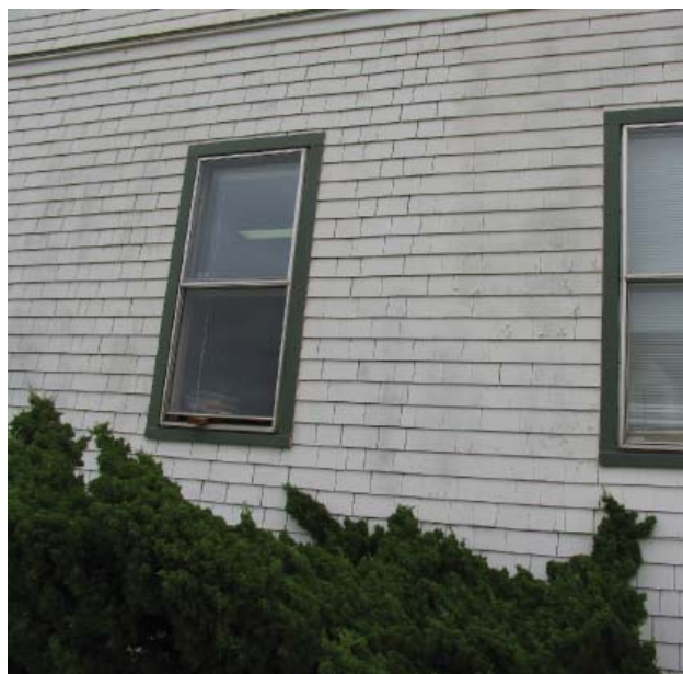
Fig. 55: Vegetation at the south wall of the Main Boathouse.

Recommendations: Replace non-contributing windows, particular aluminum sliders, with replica wood windows to match those shown in early drawings and photographs. A number of replacement windows fall within the period of significance, therefore restoration would not necessarily warrant their removal or restoration to their pre-renovation condition. While it would be possible to restore the windows to the pre-renovation/replacement condition, it may be argued that these 60 year old replacements have acquired significance over time, and that they may help to tell the full story of the buildings. Finally, their removal may constitute intrusions to the historic fabric that would result in a net loss of historic fabric. Therefore, careful consideration of all of these factors is recommended prior to a decisions regarding the dispensation