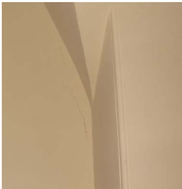
Fig. 60 :Flat plaster wall and corner bead at the interior of the Officer in Charge Quarters.