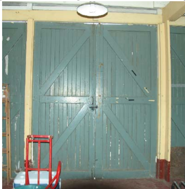
Fig. 68 : The doors at the Shop & Garage appear to be in fair condition.