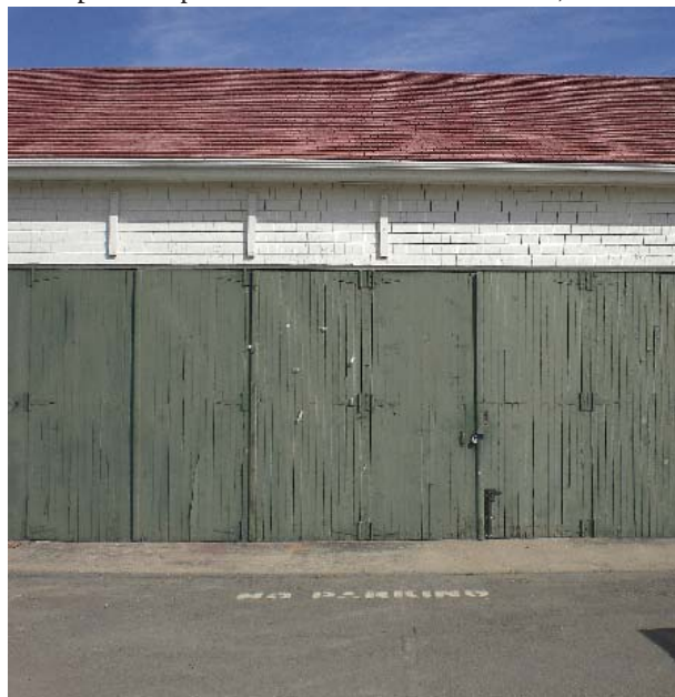
Fig. 48: Vertical tongue-and-groove wood doors at the Shop & Garage.