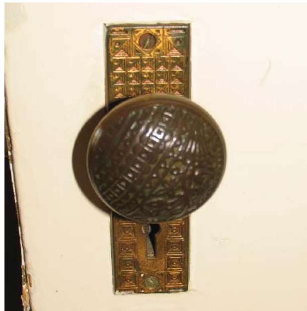
Fig. 70 :Original hardware at the Officer in Charge Quarters.