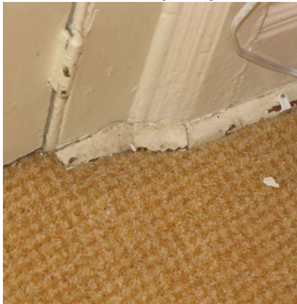
Fig. 65 : Wood baseboard, bead molding, and carpet at the Officer in Charge Quarters.