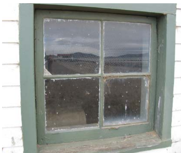
Fig. 52: Four-lite awning window at the Shop & Garage.