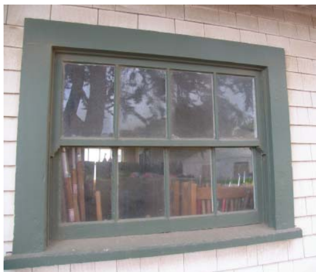
Fig. 51: Four-over-four lite windows at the Main Boathouse.

1890 Boathouse: There are vertical tongue-and-groove wood garage doors with ferrous metal strap hinges, and a vertical board wood door with ferrous metal strap hinges.