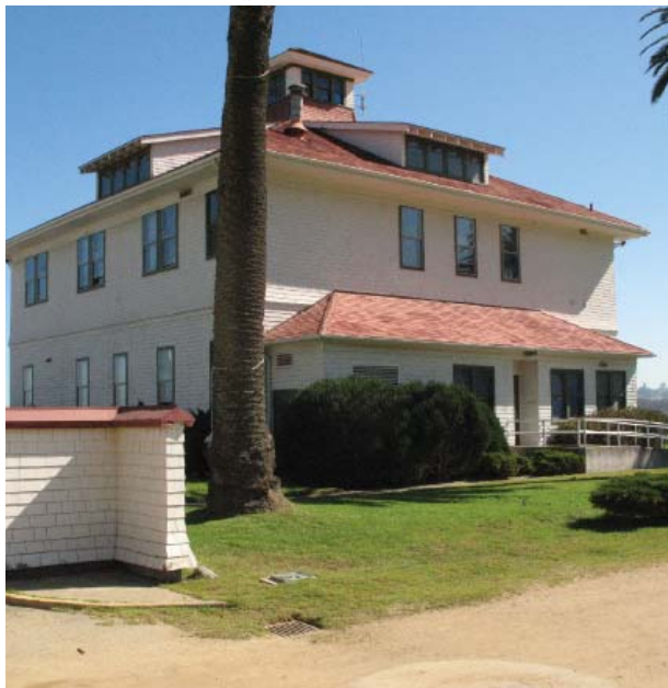
Fig. 41 : South elevation, enclosed porch of the Main Boat-house