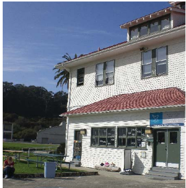
Fig. 42 : East elevation, enclosed porch of the Main Boat-house