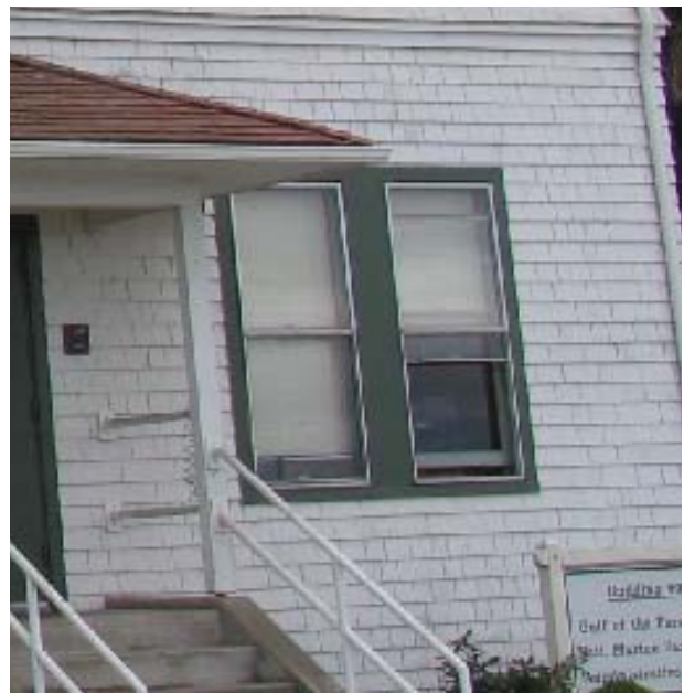
Fig. 54: Double-hung window at the Main Boathouse