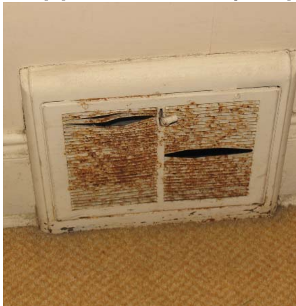
Fig. 73 : Heater vents at the Officer in Charge Quarters.

Description: Interior light quality directly affects the perception of both space and material finishes. Existing light fixtures include historic exposed single-bulb hanging pendant fixtures in the Shop & Garage;