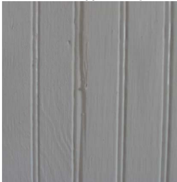
Fig. 61 : Beadboard wall cladding in the Buoy Shack.