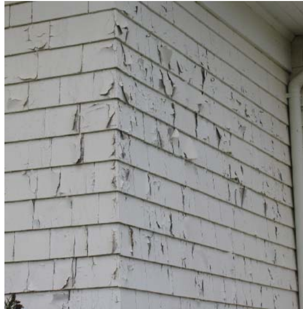
Fig. 36 : Much of the paint has detached from the shingle siding.