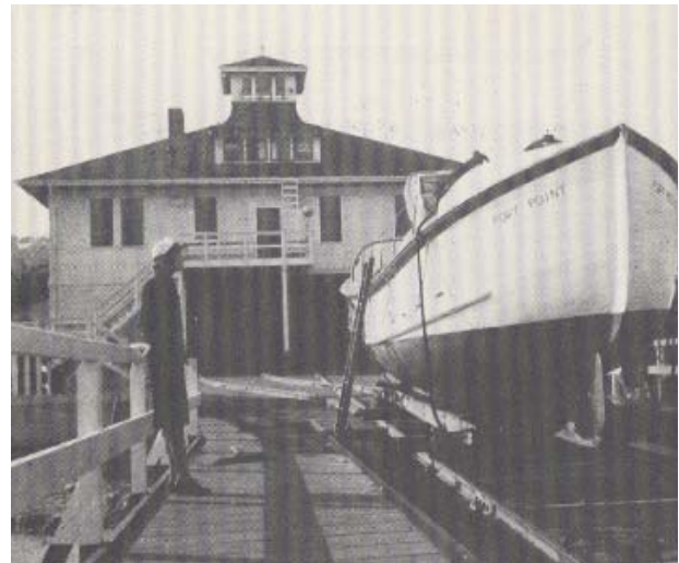
Fig. 9: Lifeboat House during World War II.