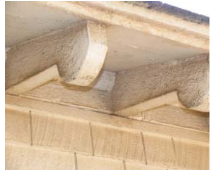
Fig. 14 : Detail of Rounded Exposed Rafter Tails.