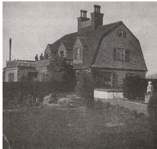
Fig. 7: South (rear) elevation of Officer in Charge Quarters, c. 1900. Note the kitchen addition at left and the original configuration of the center dormer and enclosed porch.