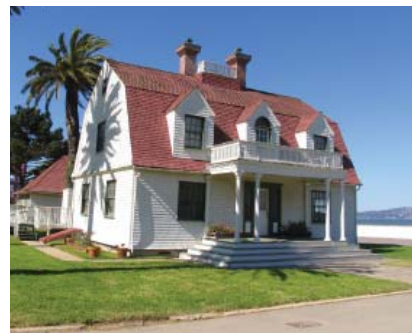
Fig. 17 : The east elevation of the Officer in Charge Quarters.