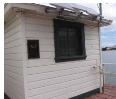
Fig. 20 : South elevation of the Tide Gauge House