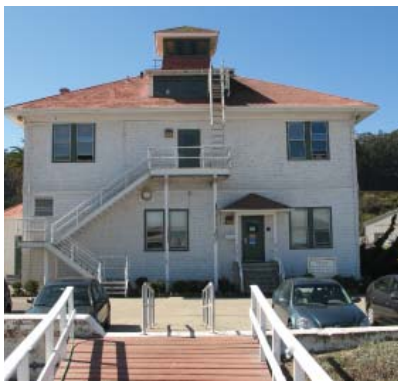
Fig. 21 : North elevation of the Main Boathouse.

The interior of the Main Boathouse has been reconfigured to accommodate office space. The majority of the windows are wood awning or double-hung, with a few metal slider replacements. The ceiling and walls are clad in horizontal wood V-channel tongue-and groove wall cladding with quarter round molding.