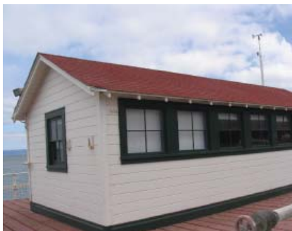
Fig. 18 : South elevation of the Buoy Shack