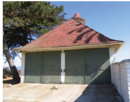
Fig. 13 : Southern exposure of the 1890 Boathouse.