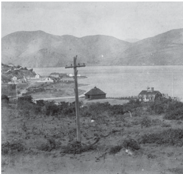
Fig. 2: Presidio grounds. 1890 Boathouse in center. Looking toward Presidio and Black Point from west. University of California, Berkeley