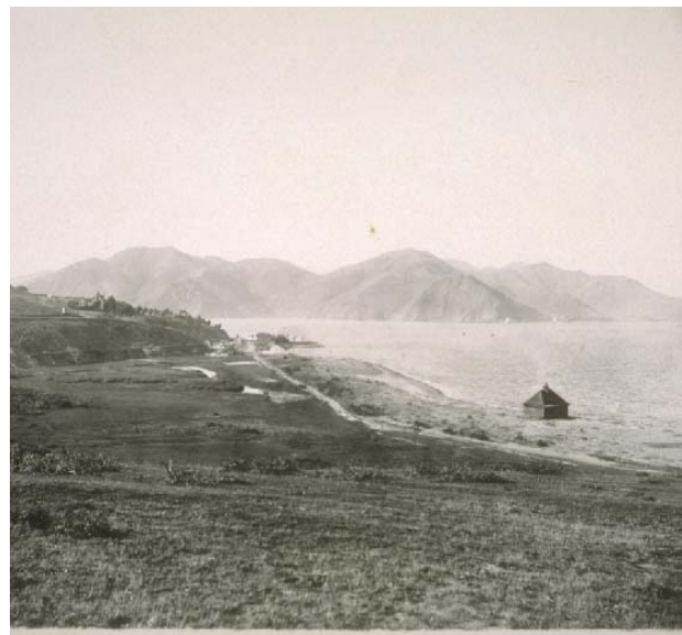
Fig. 3: 1890 Boathouse, c. 1890