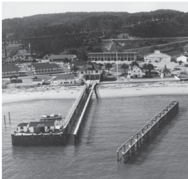
Fig. 10: Boat launch and pier with Buoy Shack and Tide Gauge House, 1958.

17 Various reports from 1993 in folder for PE 1906, PRPP Box 22, national Park Service, Golden Gate NRA, Park Archives and Records Center.