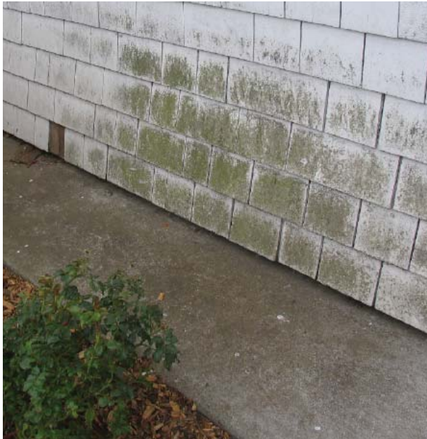
Fig. 35 : Biological growth has developed in moist, shaded areas

The interior is in good condition, though it has been reconfigured substantially. Many of the interior finishes have been obscured with suspended acoustical ceilings and new walls, but most of the significant features behind the obscuring walls have sustained barely any damage and appear to be in good condition. The windows appear to have suffered the most damage at the third and fourth floors. The majority of the fourth-floor lookout tower windows have been replaced with aluminum sliders that are not in keeping with