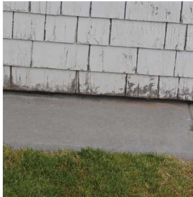
Fig. 34: Improper drainage at grade has lead to shingle deterioration.