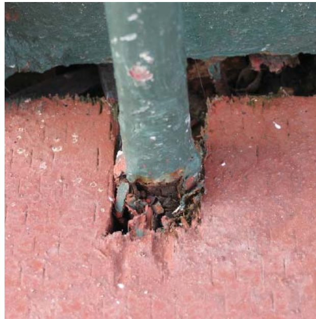
Fig. 32 :Substrate underneath deteriorated paint is deteriorating from rot.