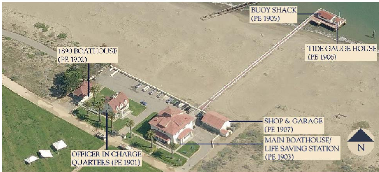
Fig. 1: Location Map – Gulf of the Farallones National Marine Sanctuary, Fort Point Coast Guard Station Crissy Field, San Francisco.

The subject structures are mostly of wood frame construction with concrete floors, wood walls, and wood shingled roofs. Most of the structures are clad in wooden shingles that have been painted white.