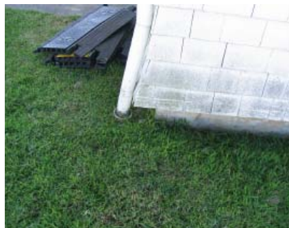
Fig. 16: Detail of flared shingled base at Officer in Charge Quarters.