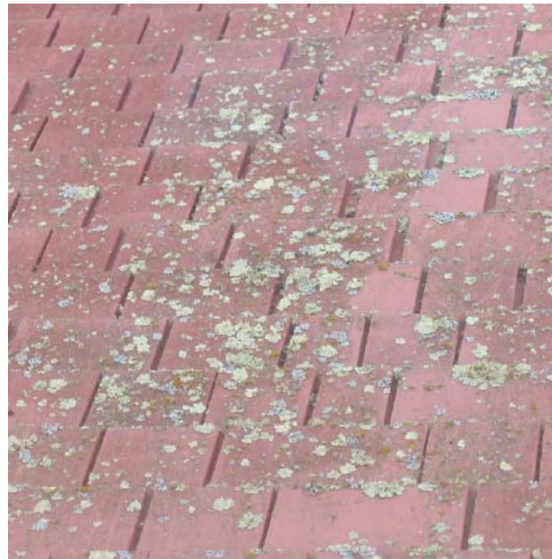
Fig. 28 : Biological growth on the roof at the Main Boathouse.