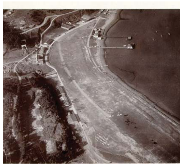
Fig. 11: Aerial photo, 1925.