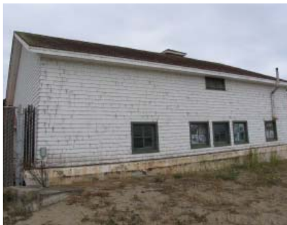
Fig. 24 : North elevation of the Shop & Garage.

The Shop & Garage includes four rooms divided by wide vertical wood boards and two levels that are joined by a wooden stair. The eastern half of the building features extensive exposed wood roof framing at the second floor, where a square loft overlooks the open plan first floor. Poor lighting compromised visibility, but it appears that none of the wood at this half of the building has been coated or finished. The western half of the building follows a more complicated plan. Walls that do not appear to be original form a small