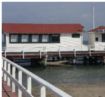
Fig. 19 : South elevation of the Buoy Shack and Tide Gauge House.