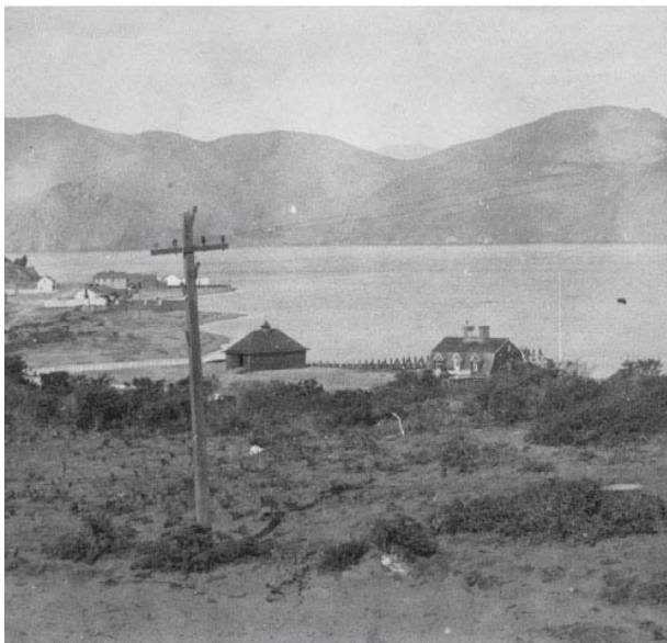
Fig. 6 : Fort Point Life Saving Station, ca. 1890. Note original orientation of buildings.