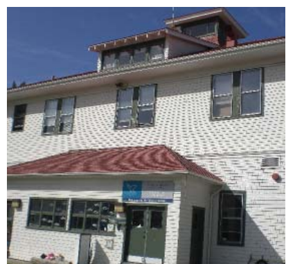
Fig. 23 : East elevation of the Main Boathouse.