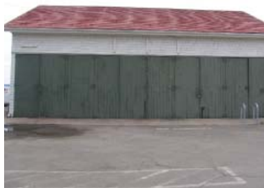
Fig. 25 : South elevation of the Shop & Garage.