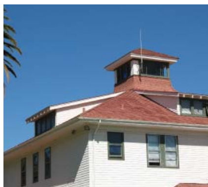
Fig. 22 : Upper levels of the Main Boathouse.