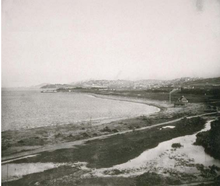
Fig. 4: Fort Point LSS, 1890, from west. Original launch ramp visible.