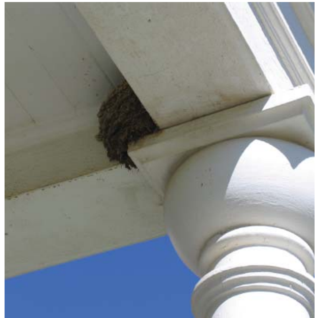
Fig. 30 : Mud Swallows nesting in the eaves of the porch at the Officer in Charge Quarters.