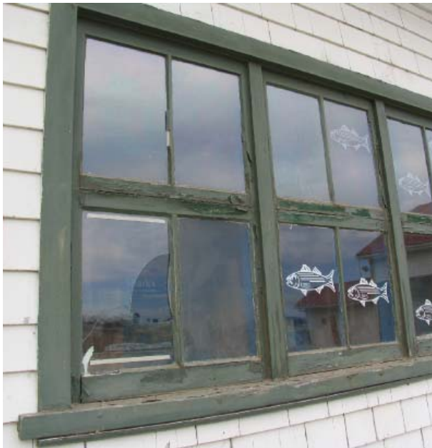
Fig. 33 : The exterior paint is deteriorating on the windows, as is the glazing compound.