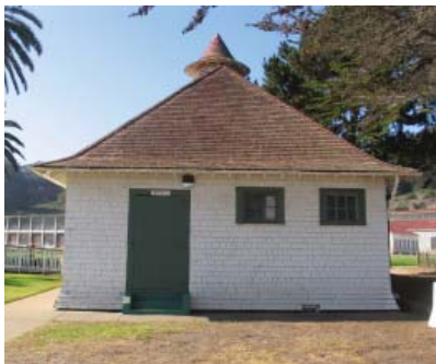
Fig. 12 : Northern exposure of the 1890 Boathouse.

The interior of the 1890 Boathouse consists of four ground level rooms and a large half-story attic space. Some of the rooms appear to have changed configuration. Wide vertical boards form the interior walls of the ground floor, while tongue-and-groove narrow boards with bead molding form the ceiling. The floor of the northern half of the structure is wood, while the southern half has a concrete slab floor. All of the wooden elements are painted, and include the cornice, which appears to be original, five-panel doors that match those in the Officer in Charge Quarters; and casework that also match those found in the Officer in Charge Quarters. A number of newer built-ins appear throughout all of the rooms as well. An original wooden ladder provides access to the attic, which is a single room dominated by exposed redwood framing.