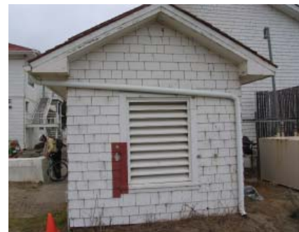
Fig. 26 : East elevation of the Shop & Garage.