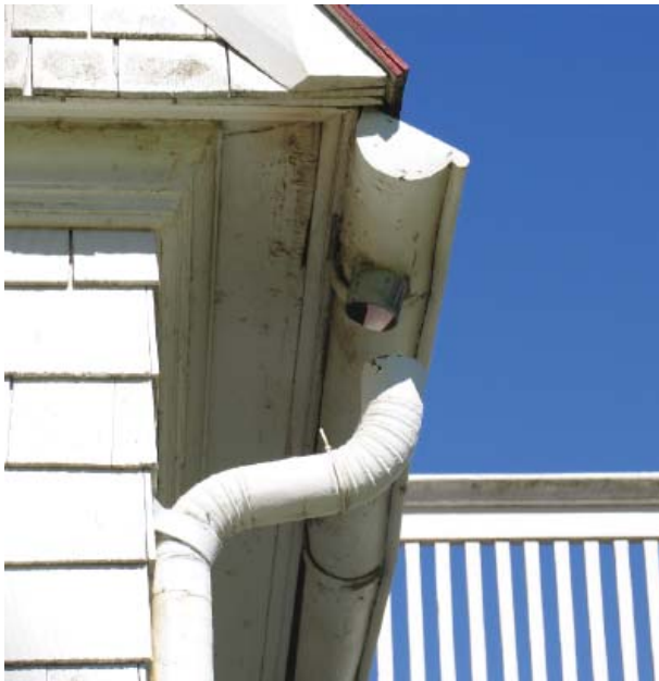
Fig. 29 : Disconnected drain spout at the Officer in Charge Quarters.

Conditions noted on the interior include: