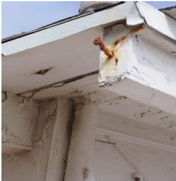
Fig. 31 : Corroded ferrous metal hardware at the Buoy Shack.

Conditions noted on the interior include: