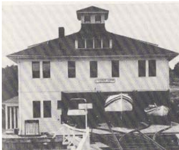
Fig. 8 : North elevation of the Main Boathouse, 1919.