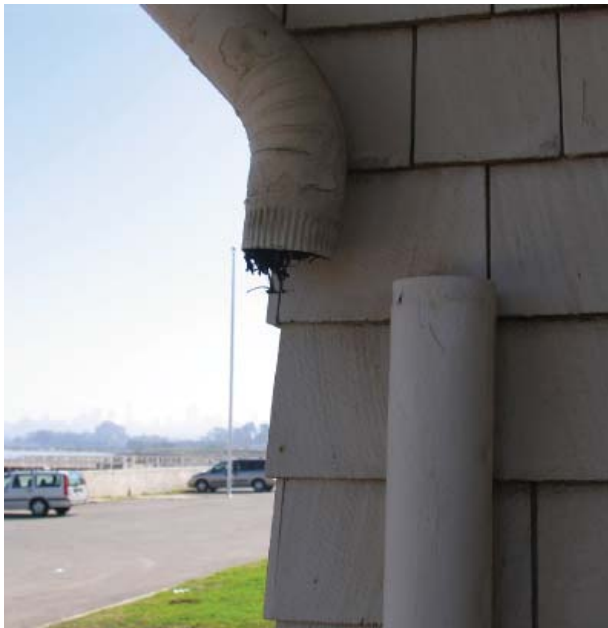
Fig. 27 : Clogged drain at the 1890 Boathouse.

The exterior of the Officer in Charge Quarters appears to be in stable condition. The red shingled roof appears to be sound; however, biological growth in the form of lichen is present. The paint at the decorative wooden elements appears to be in poor condition, whereas the painted shingles seem to be in slightly better condition. The majority of the structure is soiled and shows some evidence of paint failure. The wooden porch and wheelchair ramp are experiencing an excessive amount of water infiltration, resulting in very poor condition of the finishes, which will require a more severe approach to paint removal and reapplication. The wood of the porch, balcony, and wheelchair ramp has deteriorated and will likely need extensive repair or replacement. The majority of the embedded hardware has corroded and bled into the finished