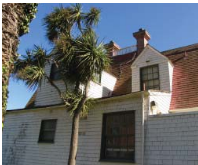
Fig. 15 : The west elevation of the Officer in Charge Quarters.

Despite these alterations, the house retains a number of nineteenth-century decorative elements. Wooden baseboards, quarter round corner and chair rail molding, and crown molding ornament the walls. On the first floor, the chair rail molding is more ornate, with corbelled detailing. It very closely resembles the crown molding throughout the interior. The fireplaces in the two front rooms appear to be original. They