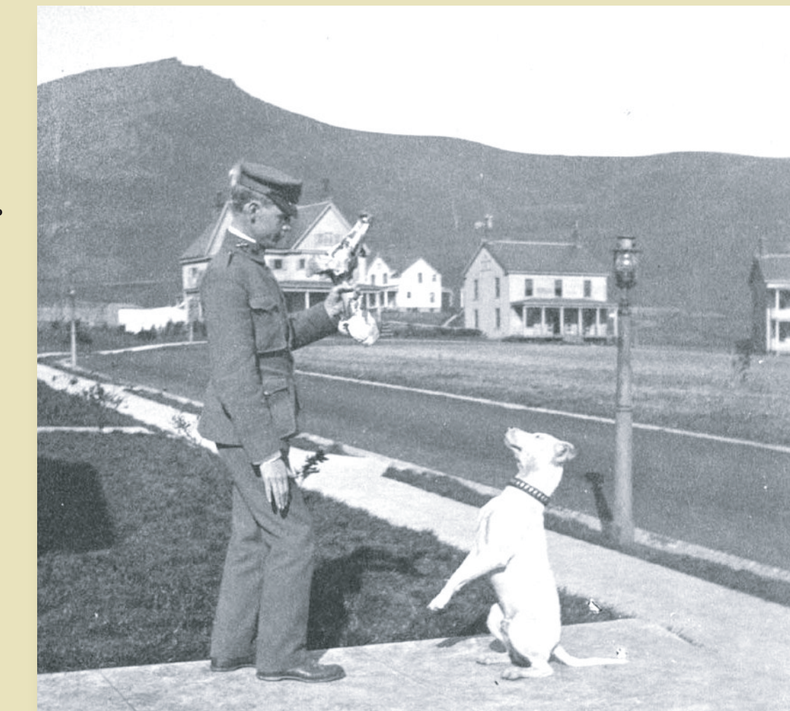
Man and dog, Fort Baker, c.1890-1906

1906 - San Francisco Earthquake and Fire General Funston orders troops into the city to establish martial law after the disaster. Areas of the Presidio and Fort Mason are used as refugee encampments.