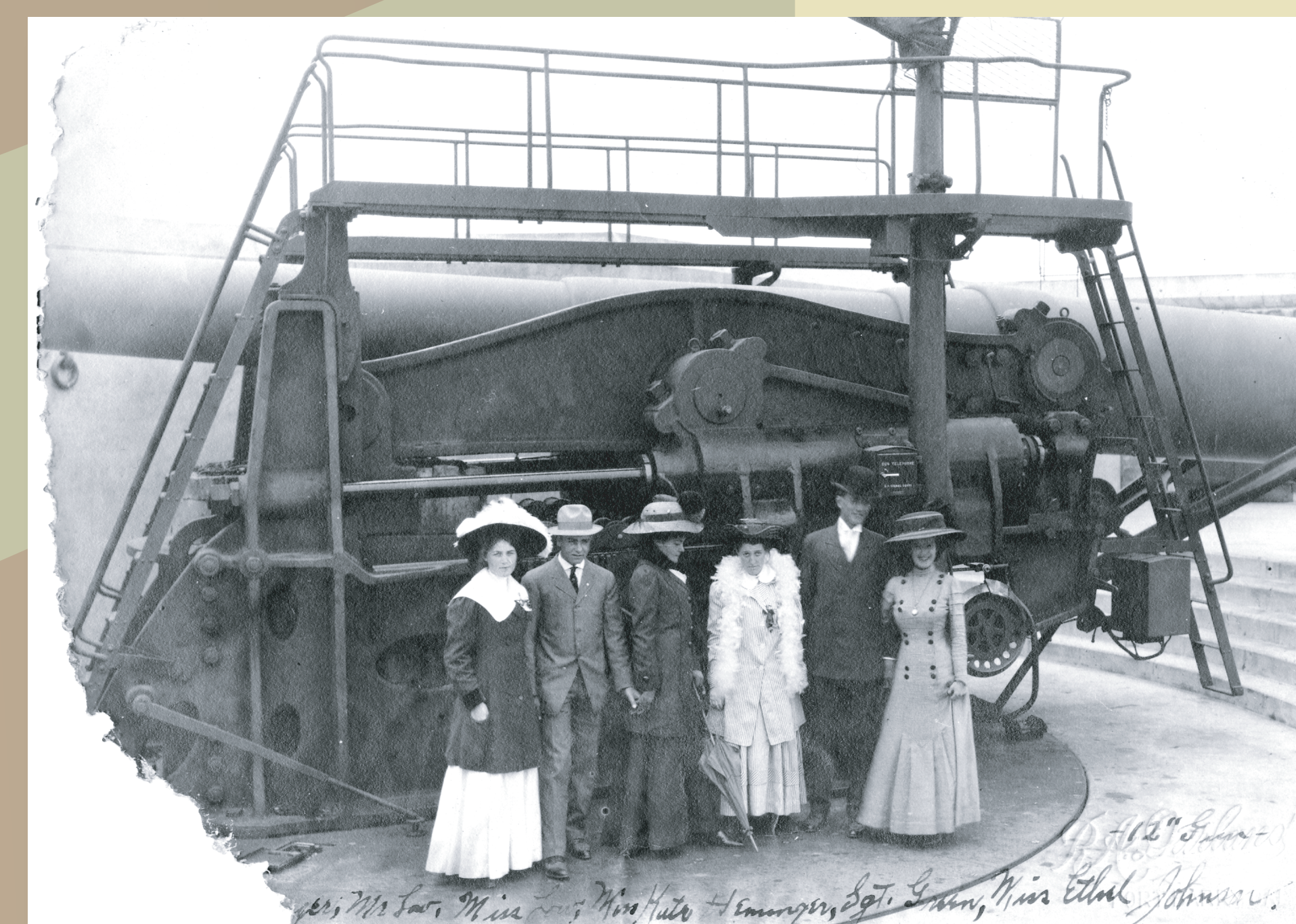
Battery Mendell circa 1908

1915 - Establishment of Fort Mason Depot Army constructs wharves, docks and storehouses to facilitate the shipping of men and materiel to the Pacific. The Depot will later become San Francisco Port of Embarkation.