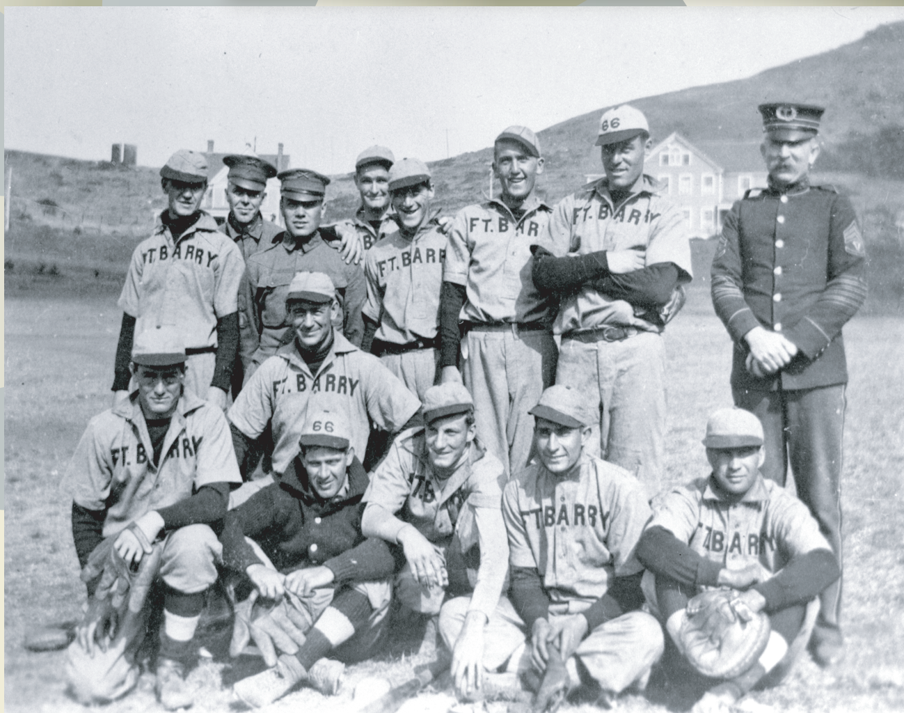
Fort Barry Baseball Team circa 1910

1899 - Letterman General Hospital is established Innovative military hospital is constructed to treat thousands of returning sick and injured troops.