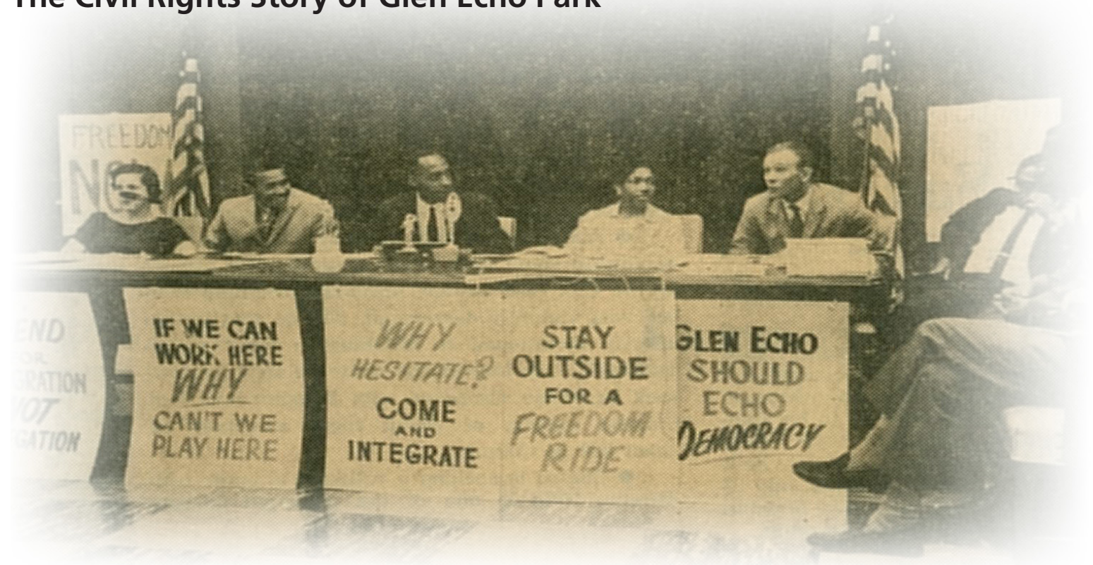
Glen Echo Park Picketing Press Conference