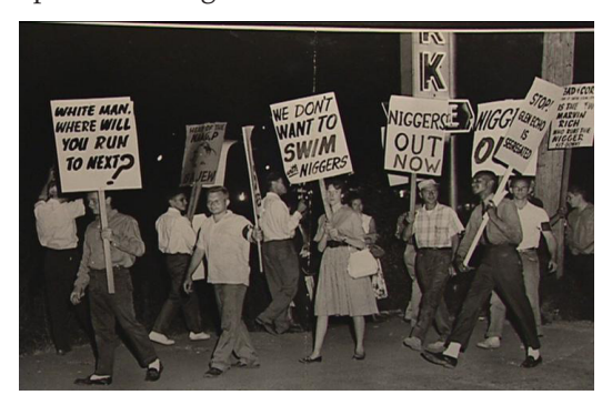
American Nazi Party counter-protesting NAG and Bannockburn picketers

But they were neither alone nor unopposed. Shortly after picketing began, a counter-demonstration was instigated by George Lincoln Rockwell and the American Nazi Party. While no pickters were harmed, there was a constant threat of violence - a rock thrown, a bottle tossed - for those struggling to provoke change.