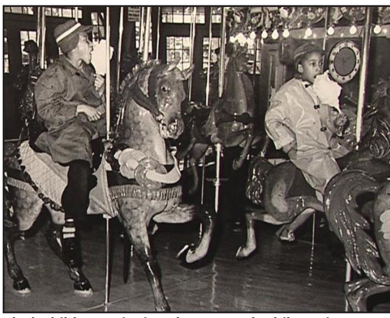
Black children enjoying the carousel while eating cotton candy in the 1960s.