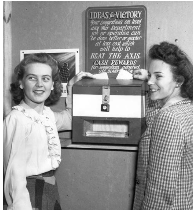
Ideas for Victory! During World War II, civilians served at Fort Hancock. The fort continues to hold great potential for ideas in community service and education.