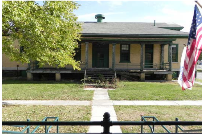
TOP PHOTO: Building 55, one of three former Mess Halls available for lease. BOTTOM PHOTO: Building 60, former Gas Station. Behind Building 60 is the former gym, Building 70 NPS PHOTOS.

Constructed in 1905, these buff-brick buildings have 6,676 square feet of space. Mess Hall Buildings 55-57 are three of four, originally identical, 140-man mess halls designed and constructed as part of the second phase of building at Fort Hancock during 1904-1905. Each building has a hipped roof with large, gable-end dormers to the north and south. Each building is symmetrical with seven bays on the east and west elevations and four bays on the north and south elevations. Each building has a large, five-bay wide porch on the west with a low slope, hipped roof. On the east, there is a smaller, two-bay wide porch with a low-slope roof. Limited public parking is available across from Building 57.