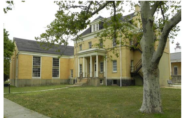
TOP TWO PHOTOS: Building 40, former YMCA. BOTTOM PHOTO: Building 53, former Post Exchange / Kitchen.