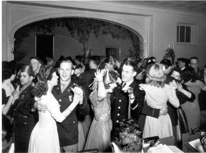
Officers and enlisted soldiers celebrated holidays at Fort Hancock with parties, dances and entertainment.

a. Lessee is responsible for all applicable taxes and assessments on the leased facilities imposed by federal, state, or local agencies.