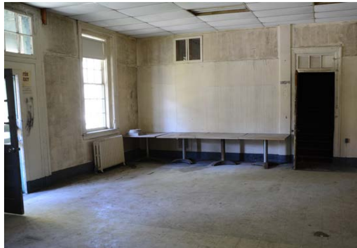
Former mess hall, Building 55.

c. Any material change in the approved Construction Documents and any deviation in actual construction from these documents are subject to the Lessor's prior written approval under the procedures identified in the Lease.