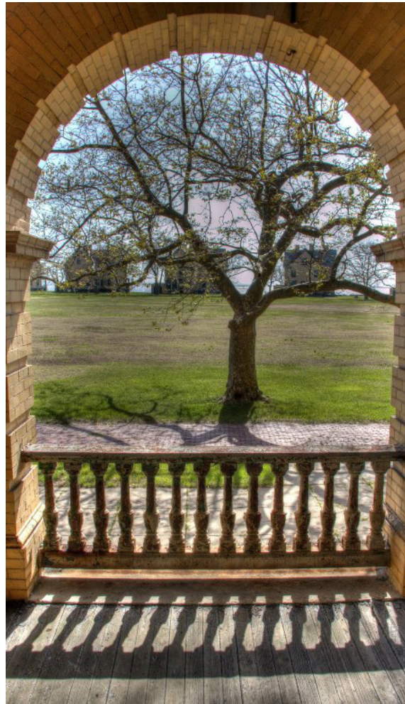
The parade grounds as seen from the porch of one of the barracks.

Alterations and improvements to the historic structures and landscapes, within Fort Hancock and Sandy Hook Proving Ground NHL District, must be made in a manner consistent with the Secretary of the Interior's Standards for the Treatment of Historic Properties (SOI). They must also be reviewed and approved by NPS and may require consultation with SHPO as necessary. Simple maintenance projects do not typically require this level of review. Exterior and interior character defining features must be maintained as part of any rehabilitation efforts made by the successful applicant.