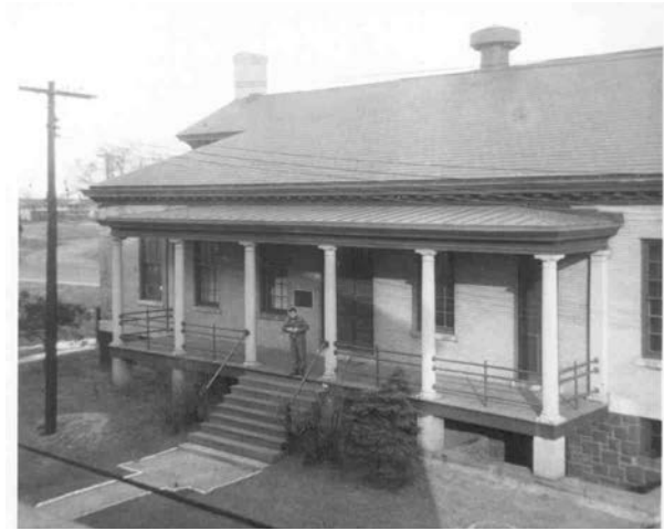
One of four mess halls built across from four barracks. Mess halls were built in 1905 and offer 6,676 square feet. NPS ARCHIVES