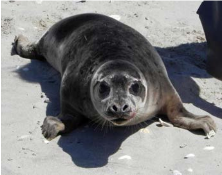
The NPS balances preservation of historic structures with care for wildlife habitats and natural resources. Three varieties of seals overwinter here on a sandbar in the bay.

Proposals may be delivered in person, by U.S. Mail, or by another delivery service. Submission of proposals by telephone, fax, e-mail, or other methods will not be considered. Proposals will not be returned.