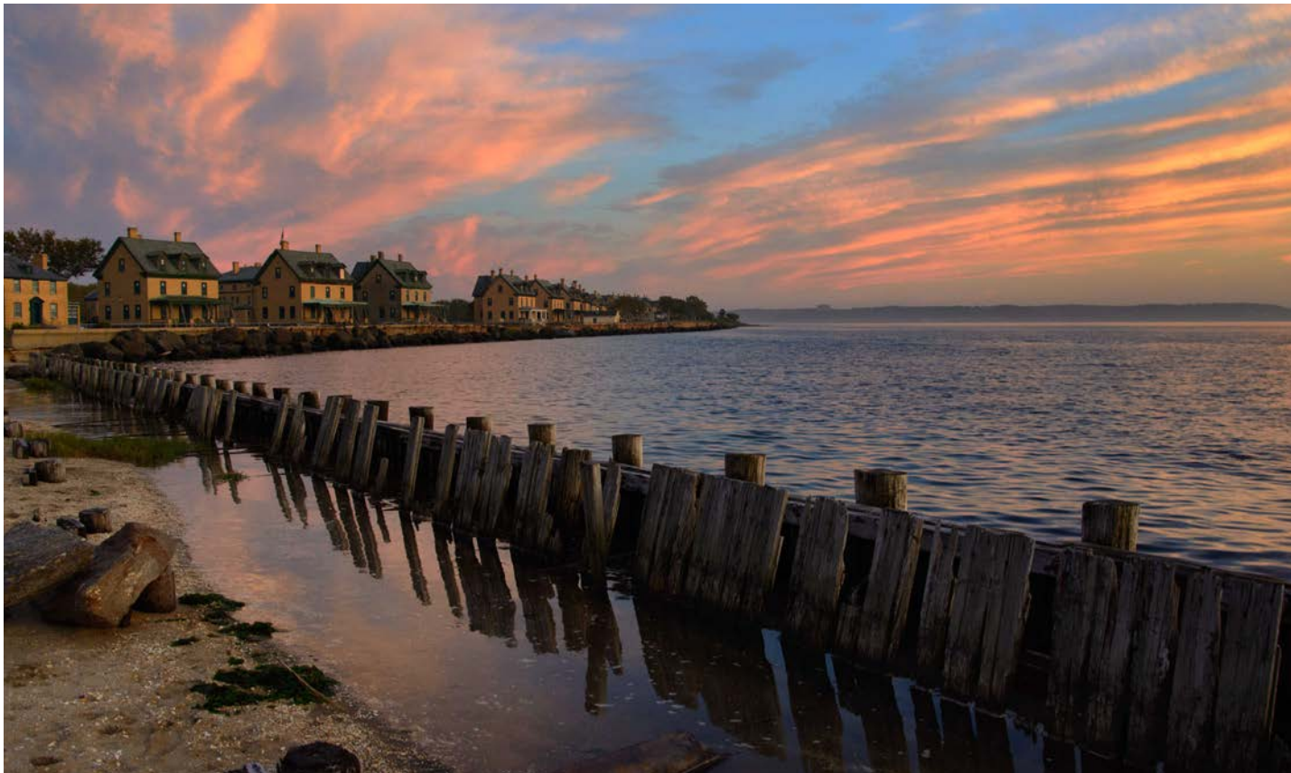
Buildings on Officers Row face west, to enjoy bayside sunsets.

All Proposals submitted in response to this Request for Proposals may be disclosed by NPS to any person, upon request, to the extent required or authorized by the Freedom