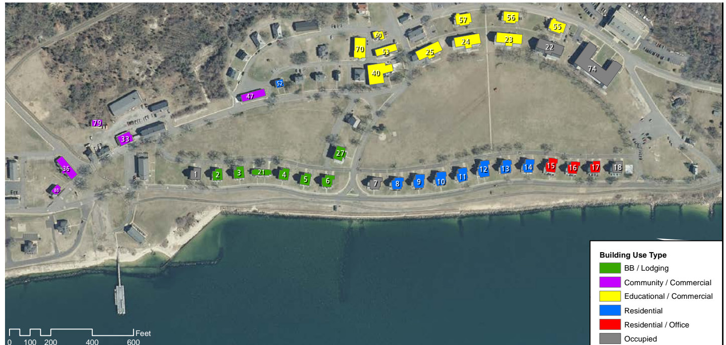
Use Map (fall 2014) shows how the park envisions the growth of different areas of concentration to create a new, vibrant community at Fort Hancock. NPS GRAPHIC

In addition to considering a phased approach, NPS has adopted a use map which will guide future development. The map was informed by written responses to Gateway's December 2013 Request for Expressions of Interest (RFEI). The map includes five basic zones: residential; residential/