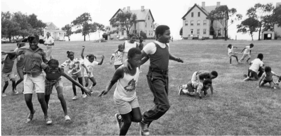
IN 1972, an Act of Congress created Gateway National Recreation Area. Sandy Hook was included. Once the US Army left on December 31, 1974, the new national park began offering a variety of programs for youth and students.

1. Light Fixtures/Electrical: The electrical and lighting systems in many of the buildings have not operated in many years and do not meet current code and energy efficiency standards. It is assumed that the installation of new systems including fixtures, wiring, and panels will be required.