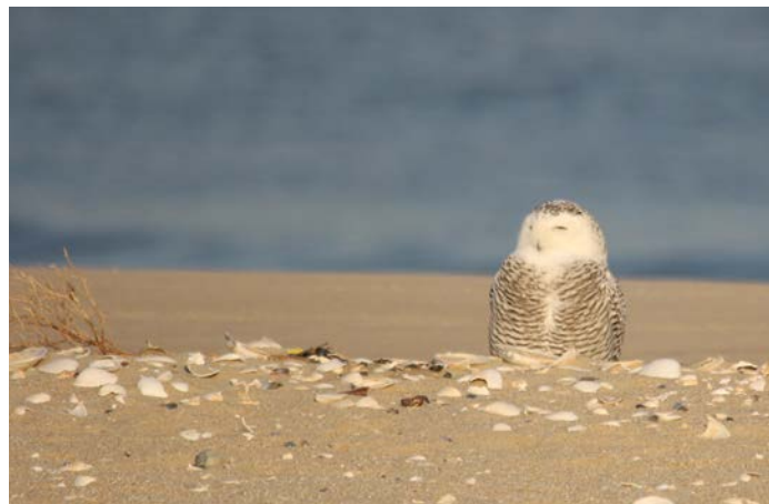
Snowy owls on Sandy Hook's beach? Yes, during some winter seasons at Sandy Hook, which provides important habitats for birds and animals year-round.

c. Fireplaces: All mantels are to be retained and repaired. Safe conversion to gas or electric fire will be permitted. The use of wood burning fireplaces will not be permitted.