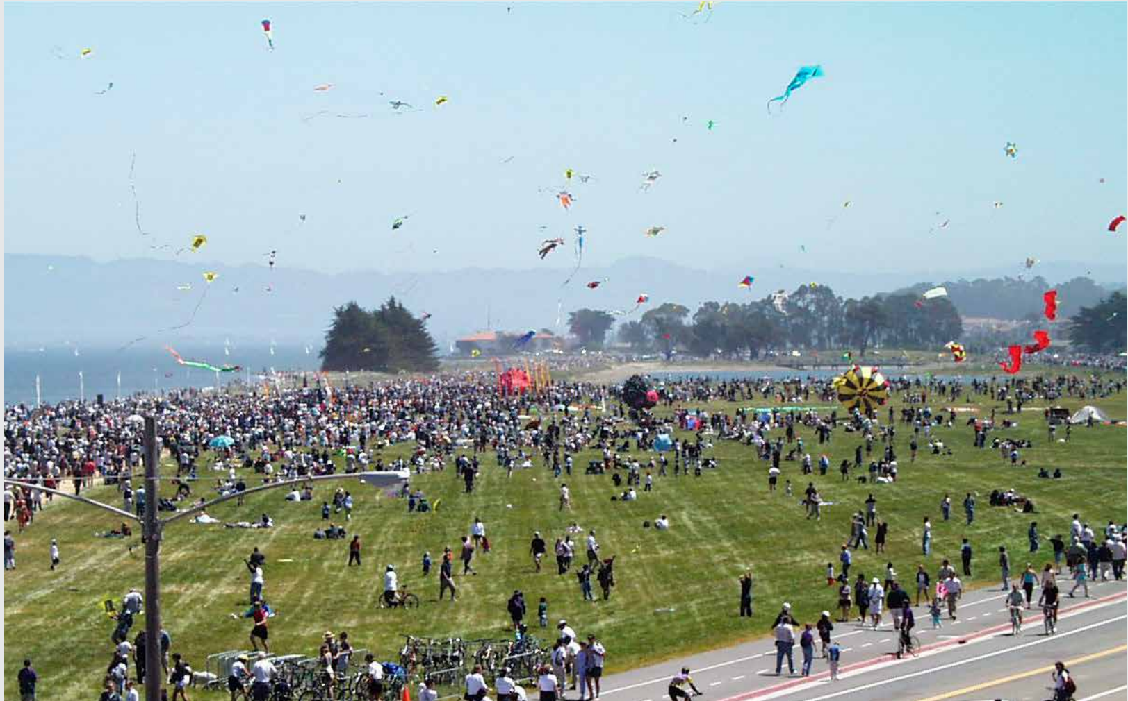
Crissy Field, Opening Day, May 2001