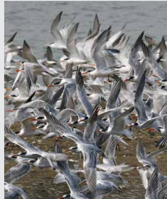
Terns on Crissy

Finally, provide a summary that reiterates how your proposal would advance each of the Trust's six goals for a cultural facility at the former Commissary site.