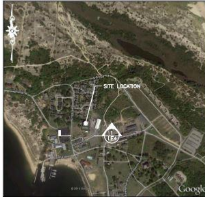
1 KEY MAP 11x17 SCALE: NTS 22x34 SCALE: NTS