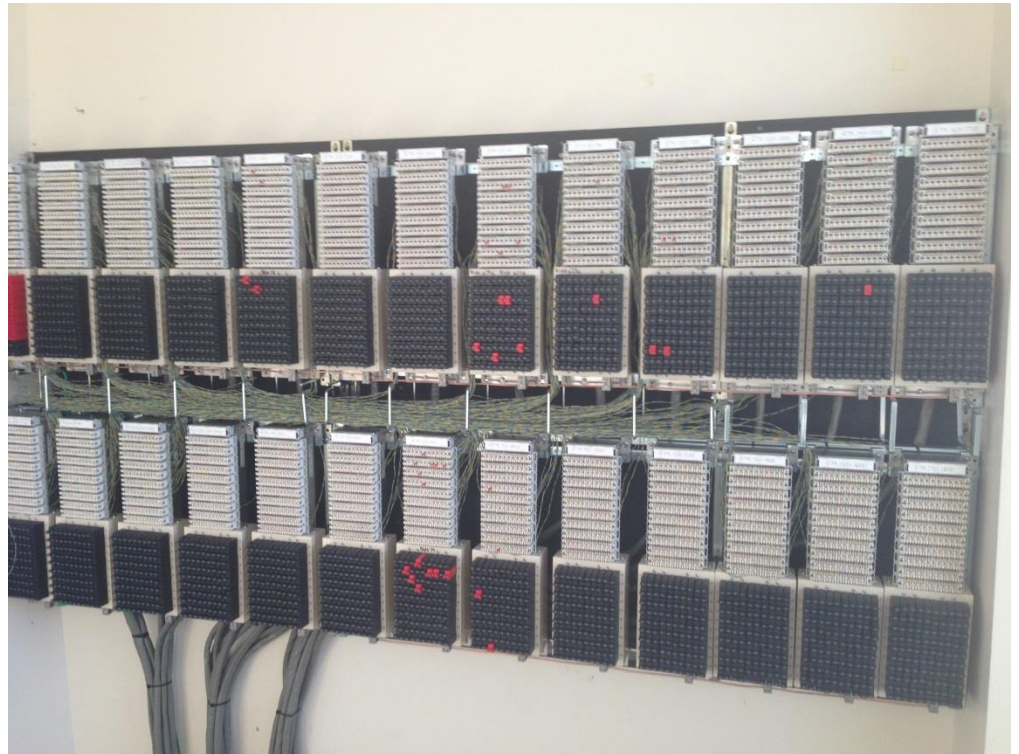
Verizon rebuilt frame in B26 (2013)

Pre-Sandy this frame was in the basement of B26. For a year after Sandy, Verizon worked on moving this frame to the first floor...they repaired it to the current state it is in today.