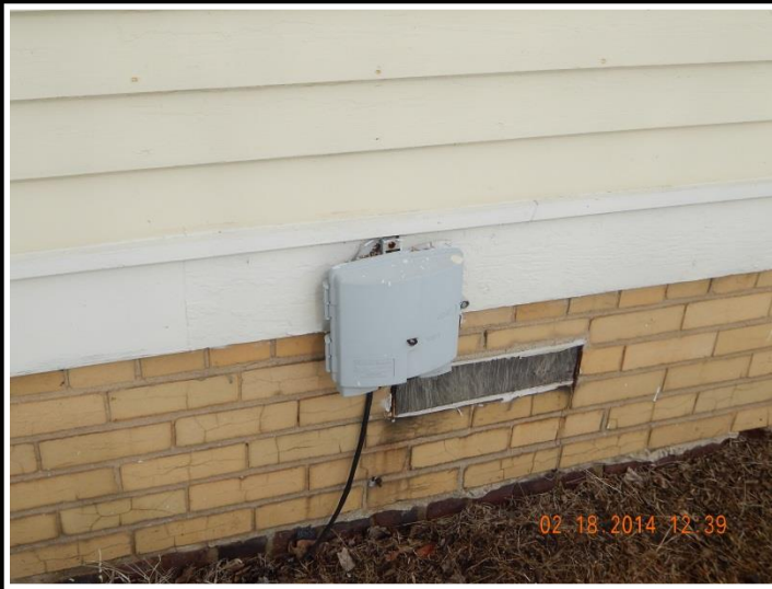
Network Interface Device

Sandy Hook is comprised of buildings that predate modern infrastructure. Most buildings have some copper to them already, but we do not really know the state of this cable if the building was not occupied before.