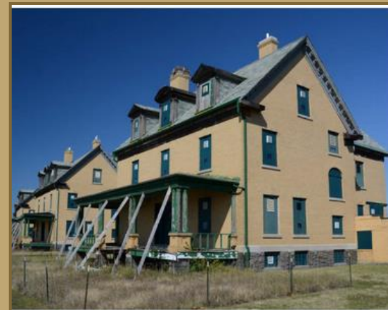
Building 6 on Officers Row.

Please describe in detail how your plans to operate a bed and breakfast or lodging operation at Fort Hancock during peak summer season will translate to year-round use of the facility. Applicants should describe, if applicable, what activities and entertainment they would provide.