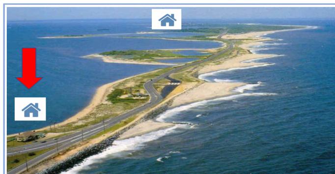
SH 600 (aka Sandlass House )