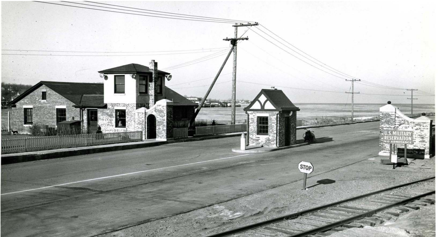
Main Entrance early-1930s