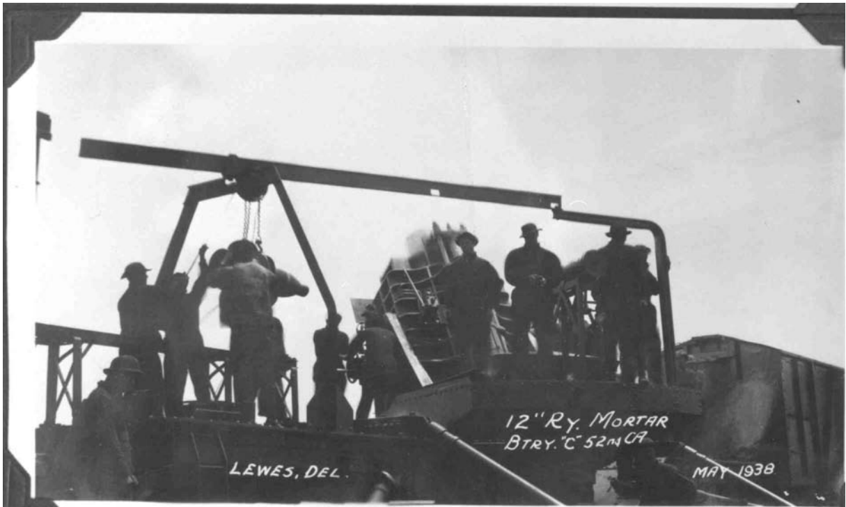
12-inch mortar of Battery C, 52 nd Coast Artillery at Lewes, Delaware.

AZ: Up in here. In there like this the large bolts. The gun went like this. I was on the ground. That day I was working on the (inaudible). We used to alternate, change. The gun went like that. Everybody saw something fly up. You inspect everything. Each person has certain things to inspect. The sergeant in charge of the guns says, "Number 1 gun out of order." Boom, the other gun goes off. 30 seconds later the other gun goes off. That sergeant say, "Number 2 gun out of order." Both guns, it's unbelievable they both of them broke the same way like somebody sawed the gun the bolts.