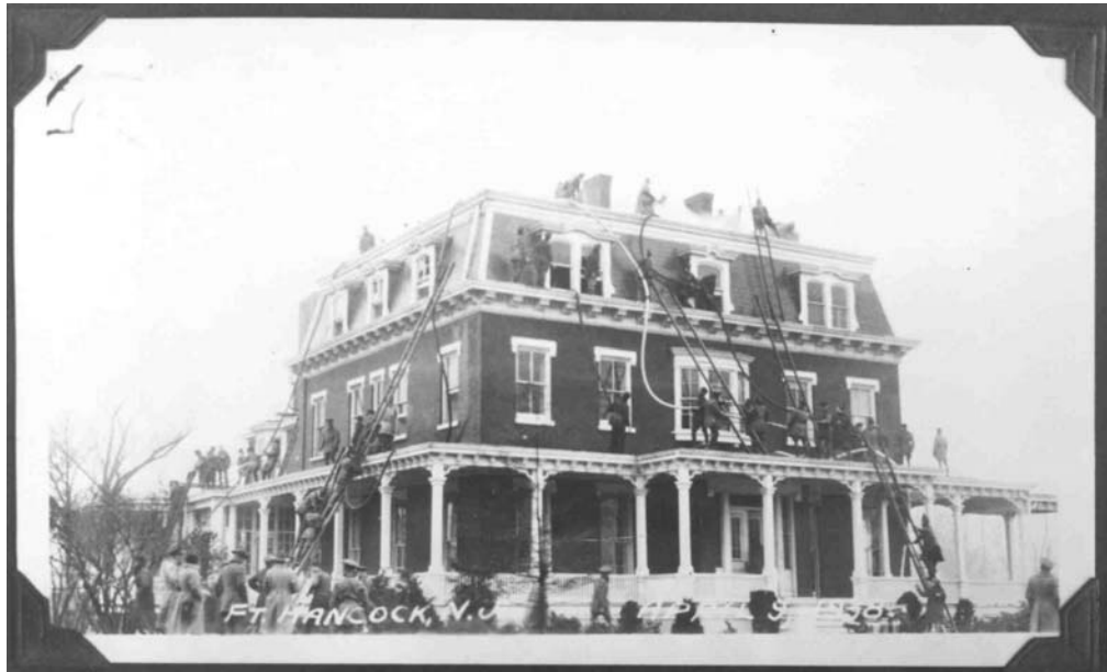
Fire at Fort Hancock Officers' Club, April 9, 1938.