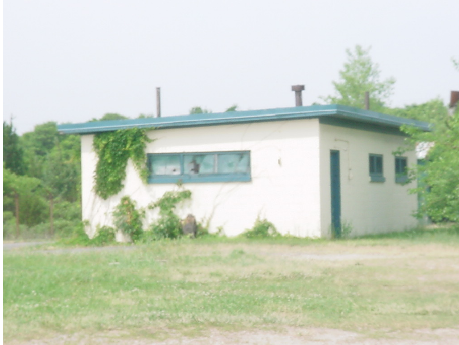
Building 434, Latrine. Photo taken in 2003.

RM: Septic tank, okay. In this building is a bathroom. Okay, there is bathroom facilities and there is first aid facilities and there is fallout facilities and rations. In the event of a nuclear blast and people were caught they had big fifty gallon drums with certain powder that people would be powdered with after they were stripped and had taken a shower. They also had paint and different tools in it. Right around to the left of it and to back of it to the side was a garbage bin where people put their garbage.