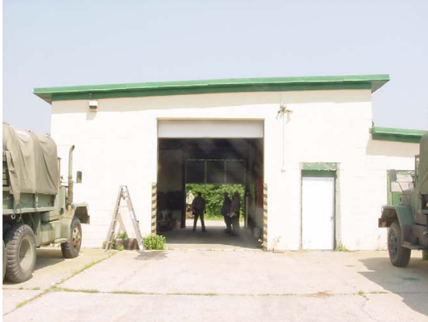
Building 449, Missile Assembly Building. Photo taken in 2003.

PD: Peter Dessauer and Tom Hoffman are now standing on the front concrete pad of Building S-449 (1959) used for what?