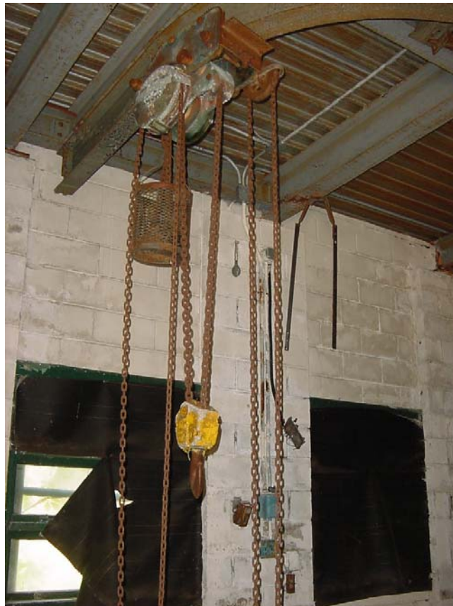
Building 450, Warhead Assembly Building in 2003. Image shows hoist system.

PD: We are now both walking on the east side of Building S-449. We are now walking to a building which has earth berms surrounding it on all four sides and then large night lights. This is Building S-450, 450 (1959).