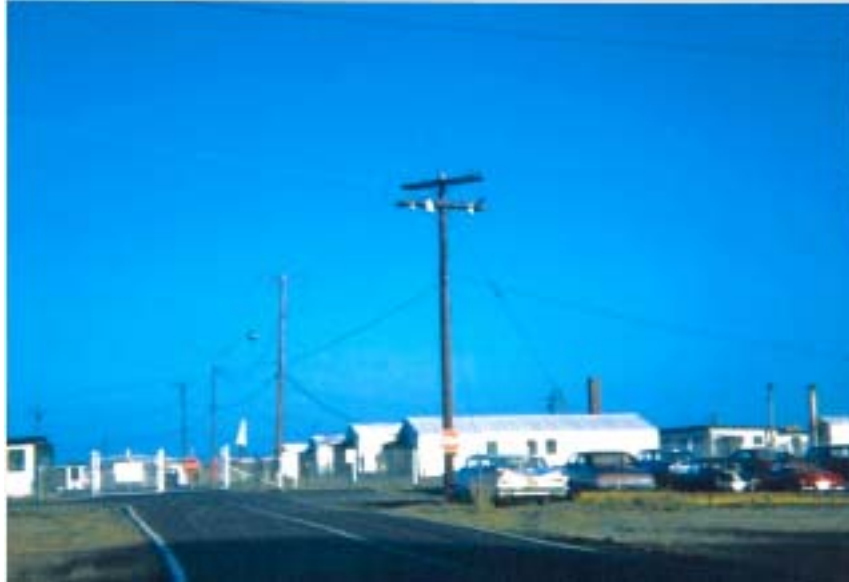
1960s image of Fort Hancock's Launch Area. Ready Barracks, Buildings 430-433 are behind cars.

PD: We are now walking into T-431 which is now a garage.