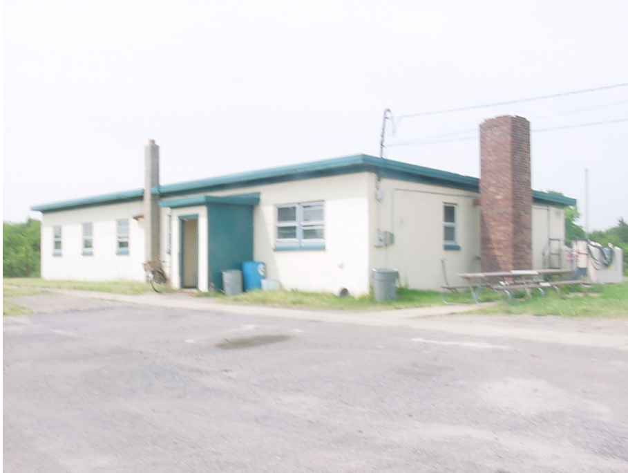
Building 437, Ready Room. Photo taken in 2003.

RM: This is my favorite room and I think every GI that was ever stationed here favorite room. This was the recreation room. This was, they had 24 hour duty here. It was 24 hours on, 24 hours off and then you worked two eight hour shifts. When you first walk in to your left you have a TV, a nice half way decent color TV. You had a soda machine over in the corner over here which everybody would dive to take a break. Whenever they would take a break they would always try to come down here as much as possible to get a soda. As you go in the back, the bunks were lined against the right of the wall, okay. You had approximately two, four, six, eight, approximately 12 to 14 bunks.