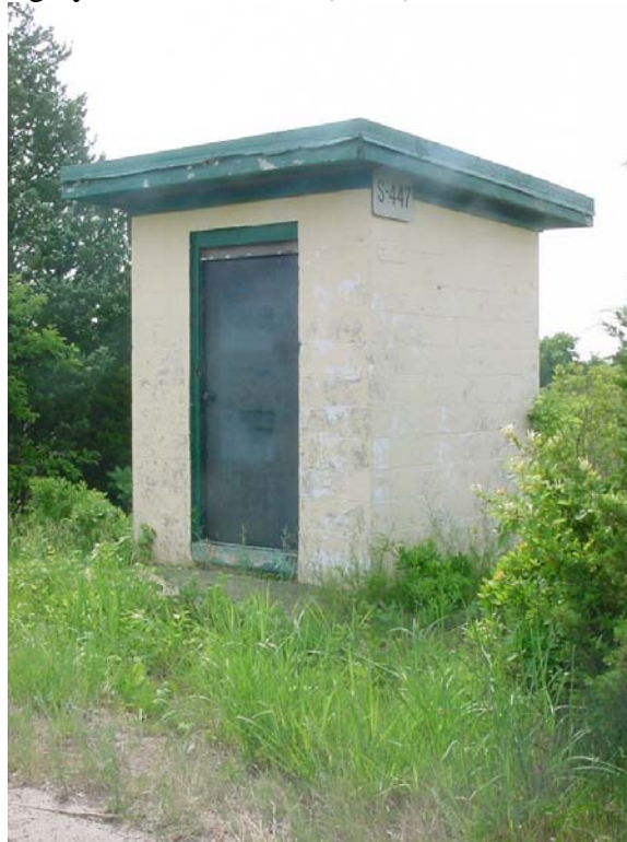
Building S-447. Photo taken in 2003.

PD: We are now walking by structure S-447 (1959). What was this used for?