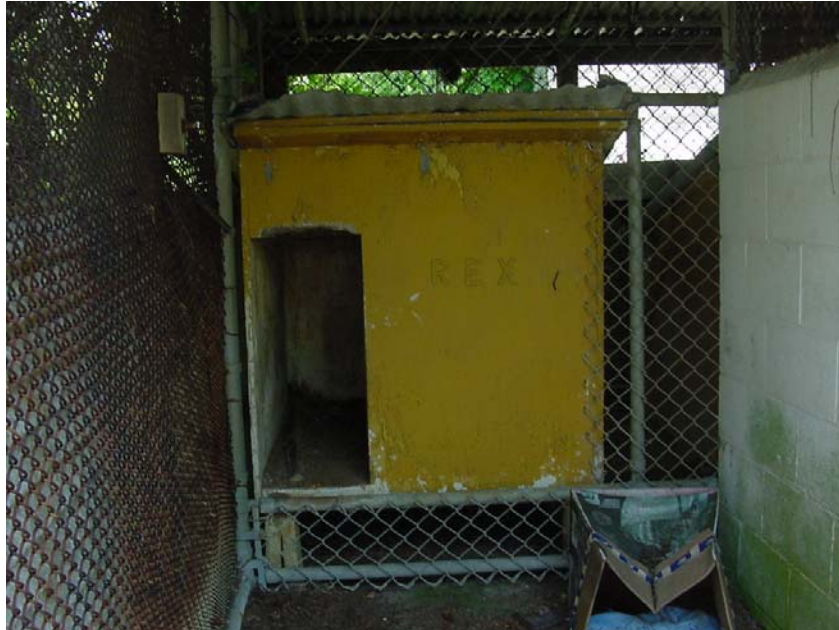
Building 458, Kennel Building. Photo taken in 2003.

PD: Alright Tom, tell me what you know about these kennels and what they were used for?