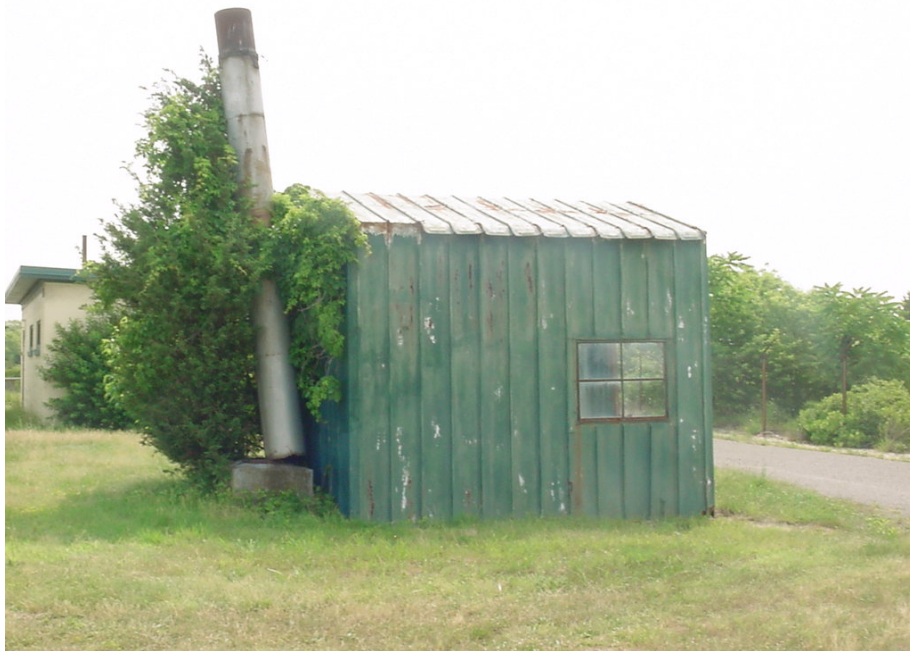
Building 435, Boiler House. Photo taken in 2003.

PD: This would be a private bathroom on sort of the west side of this building and this is the officer of the day's private bath. (Tape stops and restarts.) We are now west from S-434 toward a small building that is called T-435 (1955). On the south side of this building is an old rusty shell. What was this used for?