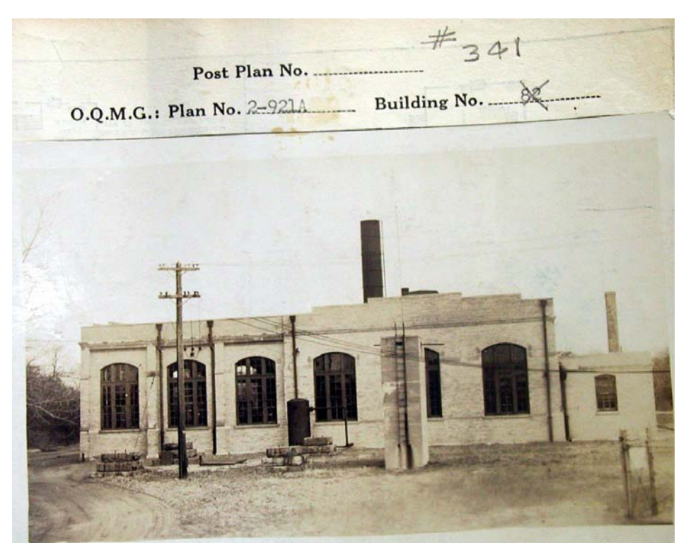
Fort Hancock Post Record Book image of Water Treatment Plant circa 1940.