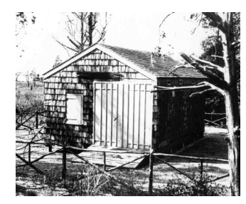
1849 Lifeboat Station currently on display at Twin Lights State Historic Site, Highlands, New Jersey

New Jersey saw many shipwrecks on or near its shores in the 19th century. Thisdestined the state to play a key role in the founding of what became the U.S. Life-Saving Service. In 1848, Monmouth County Congressman William A. Newell reportedto Congress that 158 sailing vessels had been lost off the New Jersey coast between 1839 and 1848. Newell asked Congress to appropriate $10,000 to build eight "lifeboat stations" equipped with "surfboats, lifeboats, and other means for the preservation oflife and property shipwrecked on the coast of New Jersey between Sandy Hook andLittle Egg Harbor."