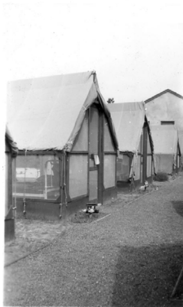
“Tent City” at Fort Hancock, c. 1940