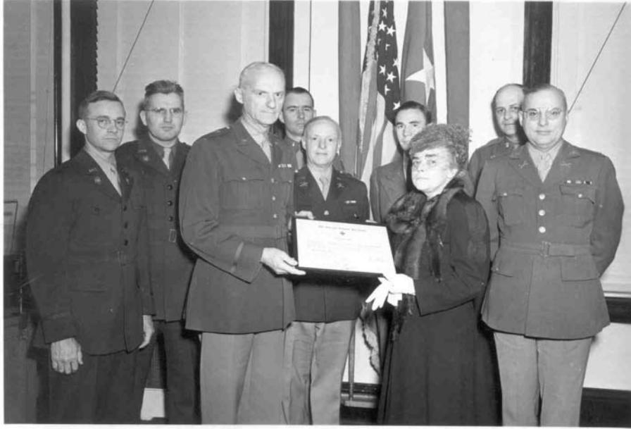
General Gage presenting certificate to Red Cross representative.