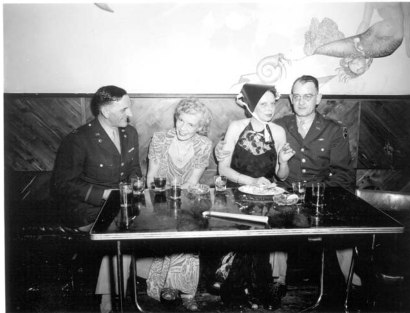
New Year's Eve celebration 1944 at Fort Hancock Officers' Club. Mermaid and nautical drawing are visible on the walls of the room.

TH: Your wife also about the Officers' Row House had burned.