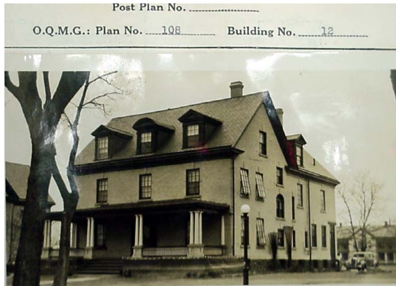
Commanding Officer's Quarters from Post Record Book, 1940.