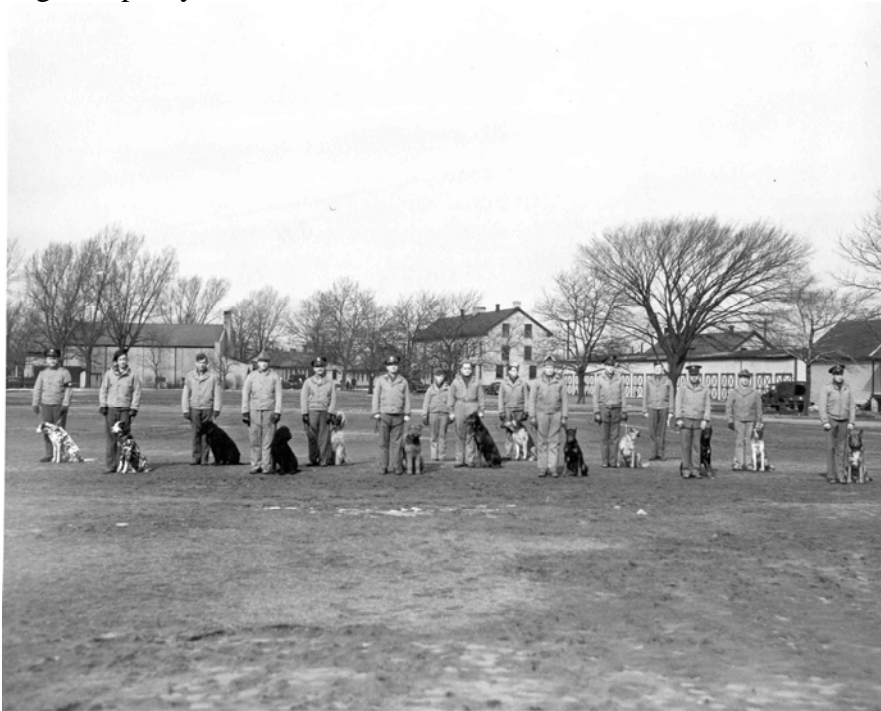
"Dogs for Defense" on Fort Hancock's North Parade Ground.