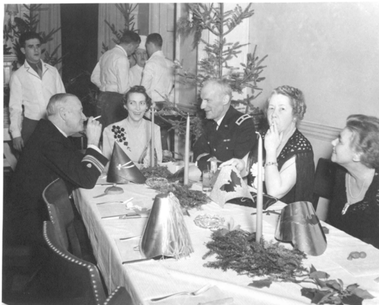
New Year's Eve Celebration at Fort Hancock Officers' Club.