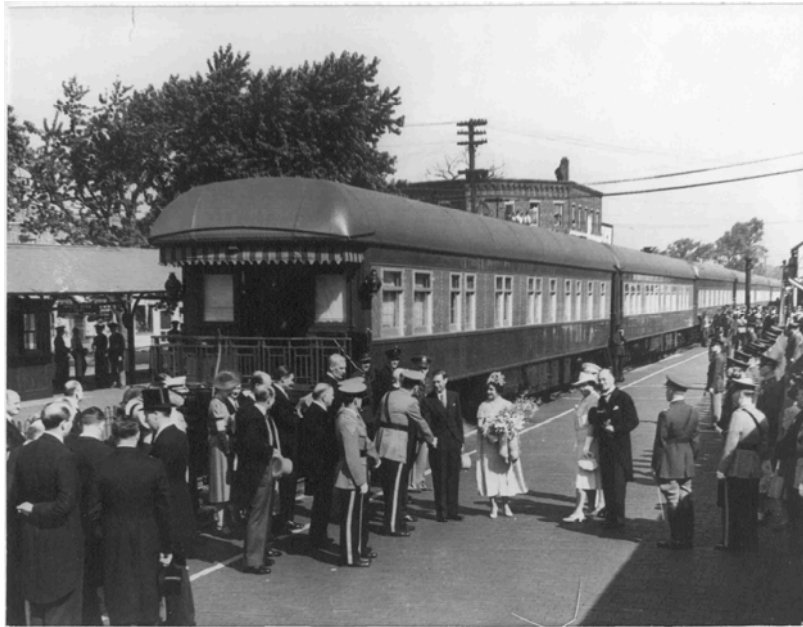
King George VI and Queen Elizabeth disembark their train at Red Bank (NJ) Train Station.