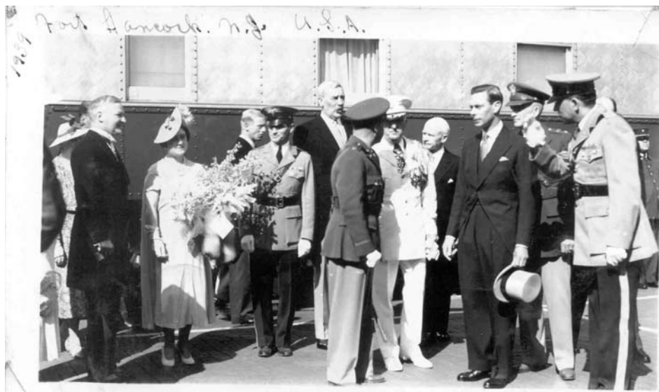
King and Queen meet with dignitaries at Red Bank (NJ) Train Station