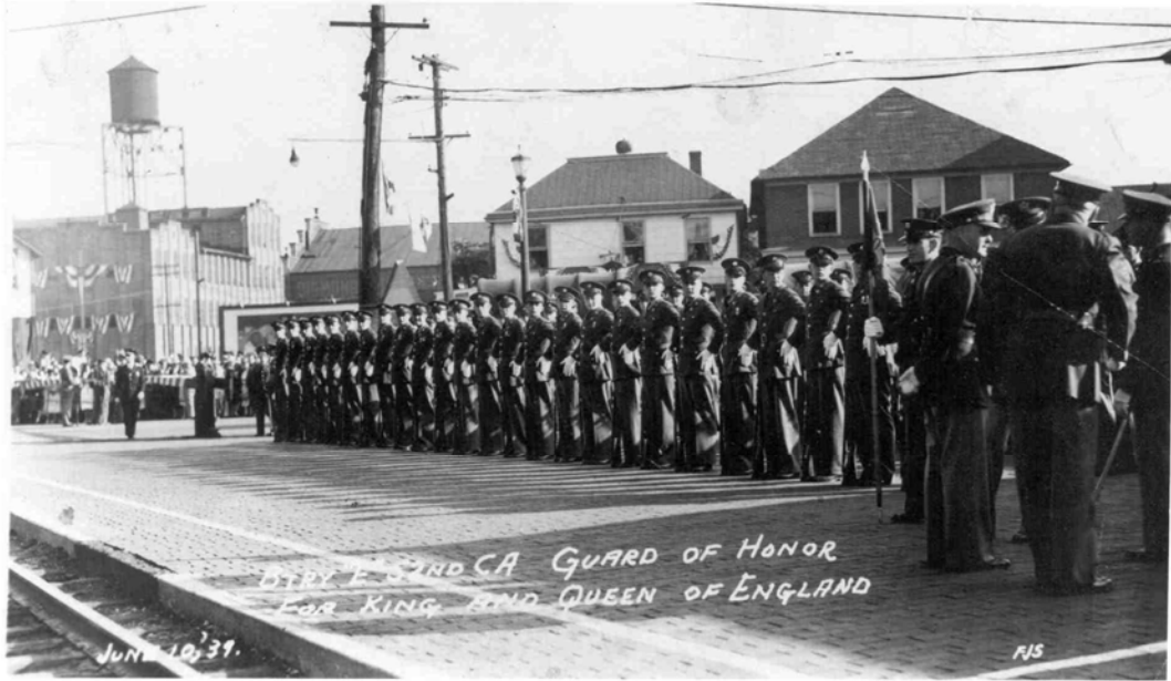
52 nd Coast Artillery, Battery E "Guard of Honor" in Red Bank, NJ.