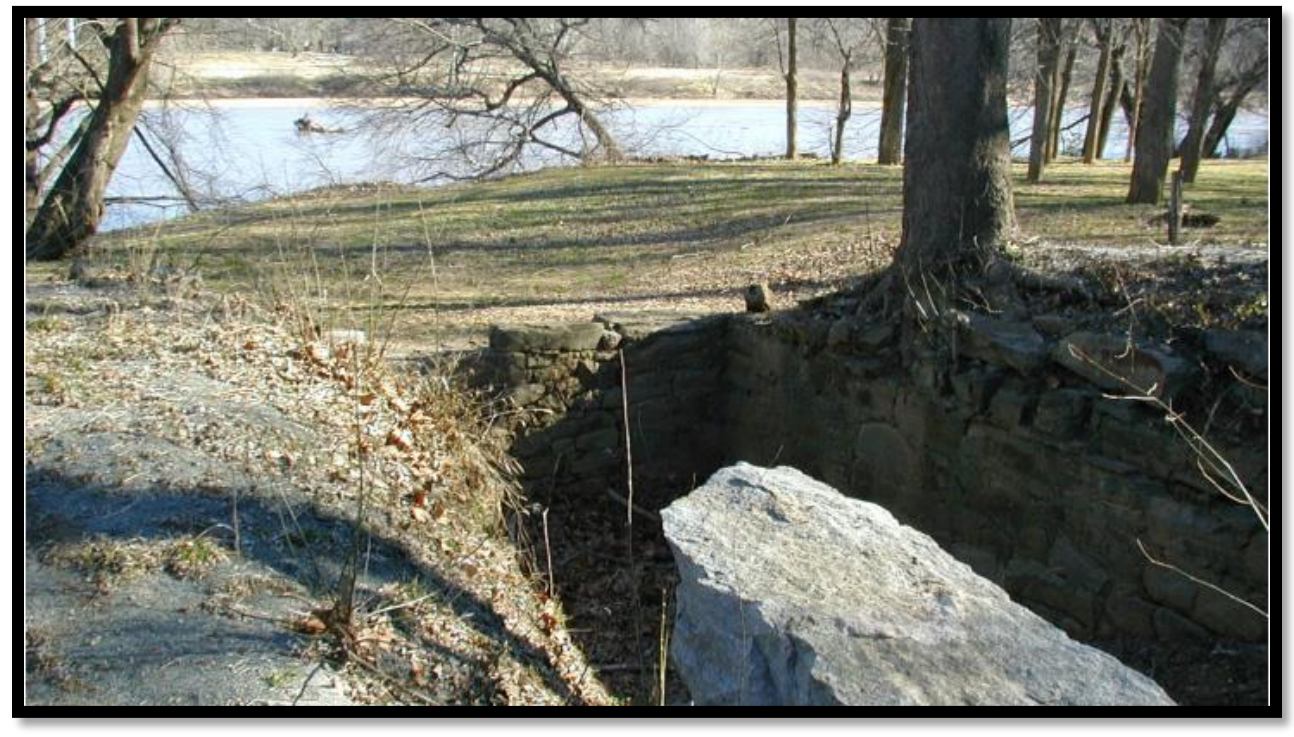
The ruins of the Bridgewater Mill – known as Ficklens Mill – where Washington crossed the Rappahannock to freedom