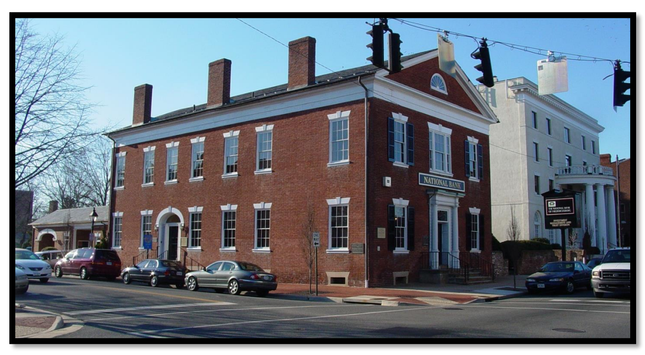
A modern view of the Farmer's Bank building on Princess Anne Street