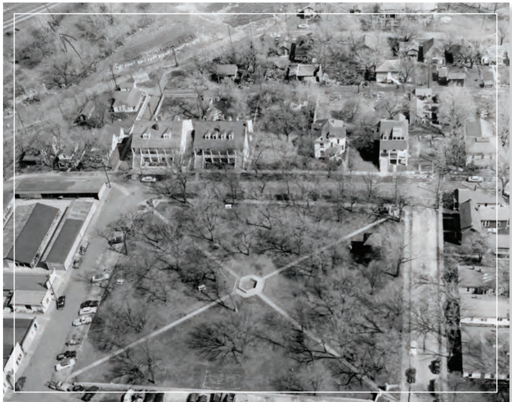
Late 1950s, pre-site redevelopment

While not included in this document, a park atlas is also part of a foundation project. The atlas is a series of maps compiled from available geographic information system (GIS) data on natural and cultural resources, visitor use patterns, facilities, and other topics. It serves as a GIS-based support tool for planning and park operations. The atlas is published as a (hard copy) paper product and as geospatial data for use in a web mapping environment. The park atlas for Fort Scott National Historic Site can be accessed online at: http://insideparkatlas.nps.gov/