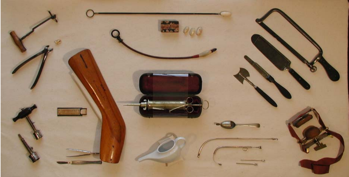
Examples of medical instruments from the 1800s.

Many of the enlisted soldiers at Fort Davis could not read or write, so we do not have many letters or personal accounts of their lives. Using official army death records, however, we can better understand the dangers that soldiers faced.