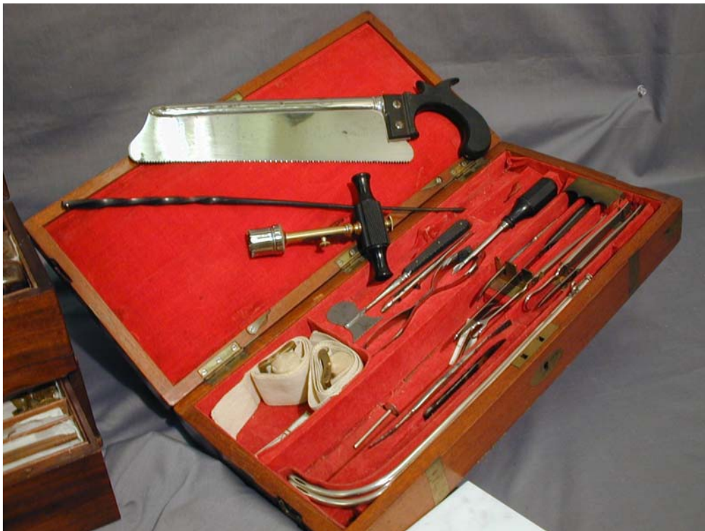
Surgeon's set of medical instruments used during the 1800s

E. What do you think could have been done to lessen the dangers? _____