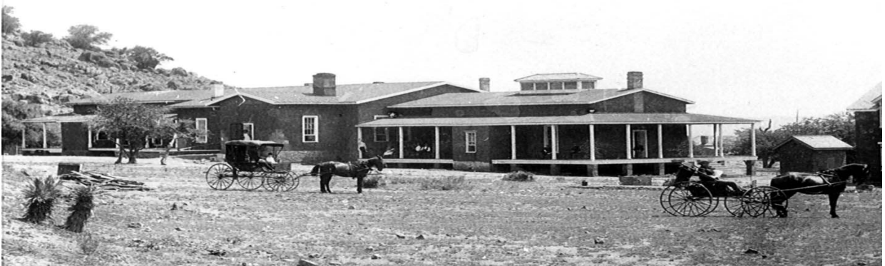
At the Fort Davis post hospital (shown here from the rear around 1889), many soldiers suffered and died—far from home & family.