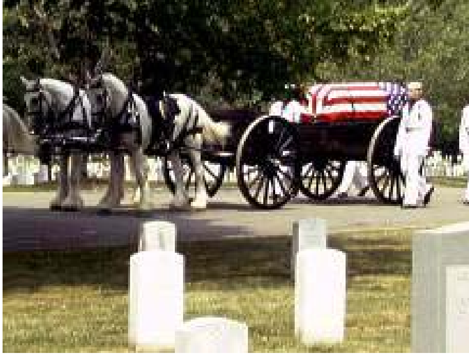
Funeral procession near Tomb of the Unknown Soldier in Arlington National Cemetery, Virginia

DIRECTIONS: You have been hired to design a memorial for the soldiers and others who died at Fort Davis. Work alone or with a small group of classmates or a partner. Sketch a plan of the memorial, write a description of it, or do both.