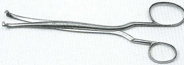
Forceps designed to remove arrowheads

There was very little that doctors could do to treat illnesses except to give medication to ease the pain. One Fort Davis soldier jammed his finger while playing baseball, and the army surgeon amputated his finger! People often died from diseases like pneumonia and diarrhea that are now treatable with modern medicines.