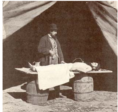
Embalming a dead soldier's body during the Civil War

B. What was the average age of soldiers who died at Fort Davis 1880-1888? _____