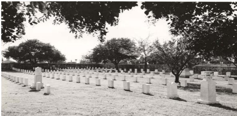
National Cemetery in San Antonio with Fort Davis graves

After Fort Davis was abandoned, the remains of the soldiers and others who were buried in the fort cemetery were transferred to the San Antonio National Cemetery. The graves there are marked with small stone markers or headstones with the name,