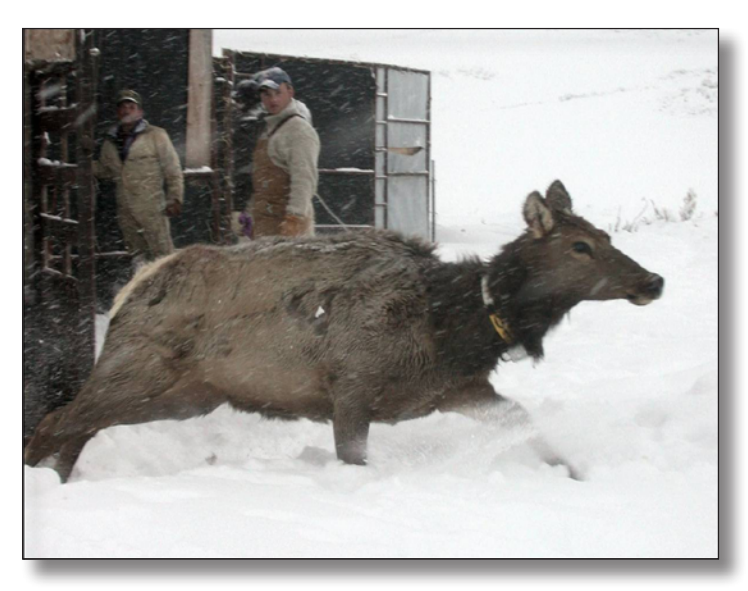
A female elk leaves a chute after being radio collared for research and monitoring purposes in Fossil Butte National Monument.

collared elk were 12 times more likely to be on the Monument during hunting season than during rest of the year. Examining daytime locations only, researchers found collared elk were 23 times more likely to be on the Monument during hunting season than they were during the rest of the year.