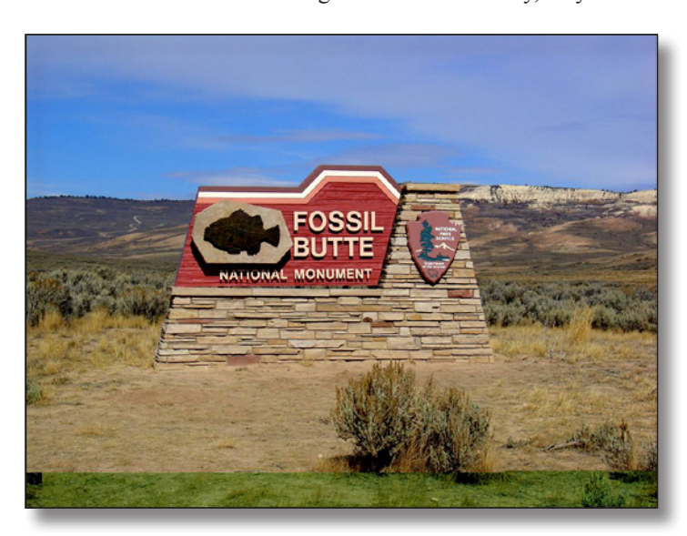
Fossil Butte National Monument, located in southwest Wyoming, is home of some of the world's best preserved Eocene fossils.

The USGS scientists found that this subgroup of the West Green River Herd preferentially used the Monument, where hunting is not allowed, during the hunting season. During the hunting season, collared elk were nearly twice as likely to be on the Monument during the daytime versus nighttime. During the rest of the year, collared elk were slightly more likely to be on the Monument during the nighttime versus daytime. When researchers looked at nighttime locations only, they found