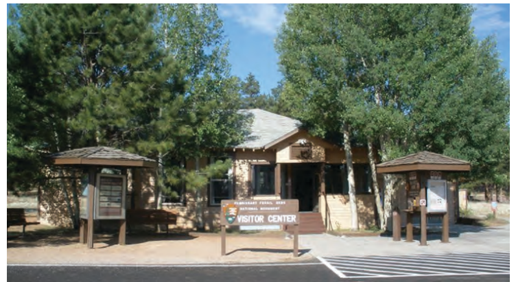
The original visitor center at Florissant Fossil Beds National Monument was previously part of the Baker property. The current Visitor Center and Paleontology Lab was built on the same footprint in 2013.

The government purchased land from 18 private owners over the following five years to create the monument. The small museum on Baker's former property was operated as a visitor center for many years, until funding finally became available for a new visitor and research center, which opened in 2013. The new facility provides storage for fossil collections and exhibits for the public.