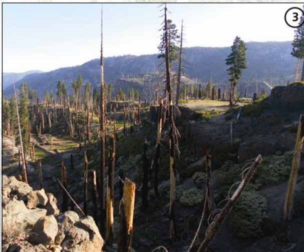
View of The Butresses. Note the stair-step pattern of the basalt lava flows. These lava flows are much older than those of Devils Postpile.

In volcanic landscapes, young lava flows often overlie older ones. The line of “contact” between them is an important clue in when constructing the history of the land. Because pumice blankets the landscape, it is younger than all the lavas and granites below. Similarly, the basalt of Devils Postpile lies over the andesite of Mammoth Pass, which in turn is above the dacite of Rainbow Falls. Such relationships allow volcanologists to put eruptions in chronological order even before calibrating the age and frequency using radioisotopic dating in the lab.