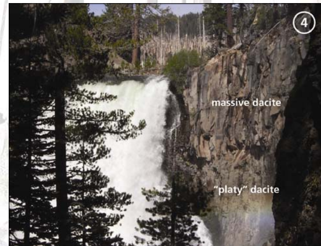
The cliffs beside Rainbow Falls show how the dacite flow cooled to form both massive and platy rock.

West of Devils Postpile is a stairstep of dark basaltic ledges, each formed by a separate flow, some with columns. Exposed columns north of King Creek rival those of Devils Postpile and are flush on granite: strikingly black-on-white. The Butresses lavas are about 30 times older than those of Devils Postpile. Other remnants indicate that 1,500 vertical feet of the lava flows have been removed by erosion, mainly glaciers. A big surprise to geologists is that such old lava extends down to the present-day river level, indicating that the Middle Fork San Joaquin River has remained at its current elevation for more than two million years, despite numerous glaciations.