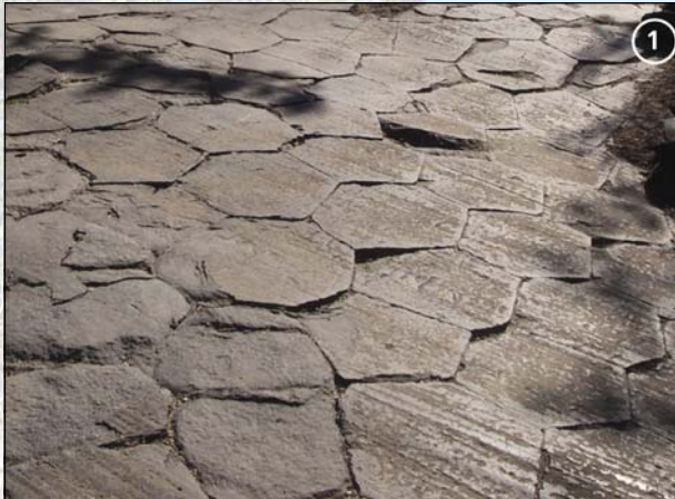
Photo of the top of Devils Postpile. Note the glacial polish and striations.

Today, most rock from this flow has been stripped away by glaciers that advanced down the canyon about 20,000 years ago, but a series of lava remnants survives along the canyon floor including the Devils Postpile. Other outcrops above the river suggest a minimum original thickness of nearly 350 feet.