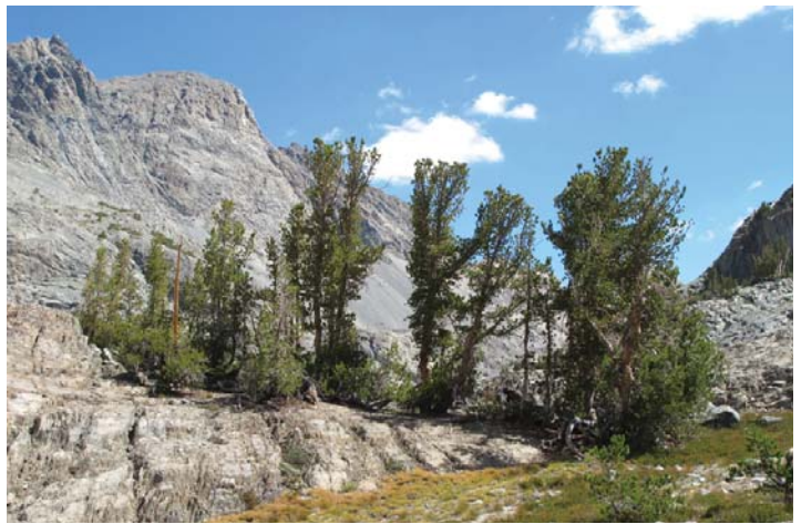
Figure 6. Whitebark pine ( Pinus albicaulis ) in Kings Canyon National Park. Whitebark pine is showing severe declines in much of its range and the species is currently warranted for listing as a federal endangered species.

The SIEN parks contain the headwaters and large portions of seven major Sierra Nevada watersheds—the Tuolumne, Merced, San Joaquin, Kings, Kaweah, Kern and Tule. The distribution and movement of water and its interactions with the surrounding environment, or hydrology, will be monitored in a subset of major rivers to better understand how water dynamics change seasonally and over long time periods. Climate-related changes in snowpack and snowmelt patterns will have major effects on river flow patterns. Figure 8 shows the greater variability of hydrologic patterns that are already occurring or anticipated to occur with expected temperature increases. A recent assessment of local stream gages and snow courses indicated that snowmelt is occurring earlier, and less of the total stream discharge is occurring between April and July when most of snowmelt runoff has historically occurred (Andrews 2011). Monitoring of river flow patterns will help park and water managers to better understand and predict the timing of the delivery of snow runoff as well as the effects of climate change.