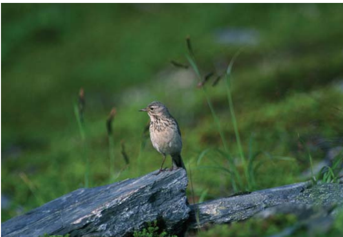
Figure 4. American pipits breed in Sierra Nevada alpine meadows. It is uncertain how a warming climate will affect these birds, but alpine environments are among the most vulnerable to climate change impacts.