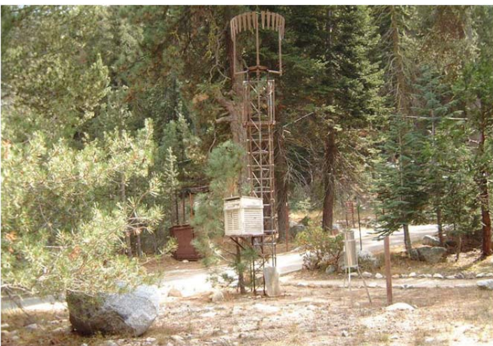
Figure 5. Weather station in the Lodgepole area, Sequoia National Park -- one of the National Weather Service COOP stations that will be used in SIEN's climate monitoring project.