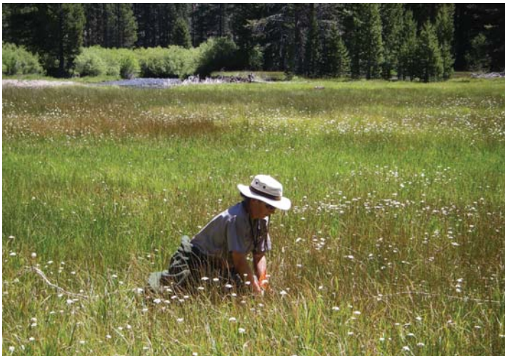
Figure 9. Botanist installs a wetland monitoring plot in Devils Postpile National Monument.