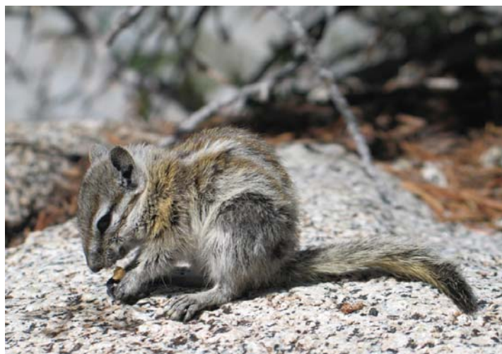
Figure 2. Alpine chipmunk ( Tamias alpinus ), a high-elevation species endemic to the Sierra Nevada, has shown contraction of its lower range.