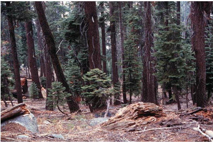
Figure 3. Long-term monitoring plot in red fir forest, Sequoia National Park - one of 30 forest monitoring plots currently monitored by the USGS Sequoia-Kings Canyon Field Station.