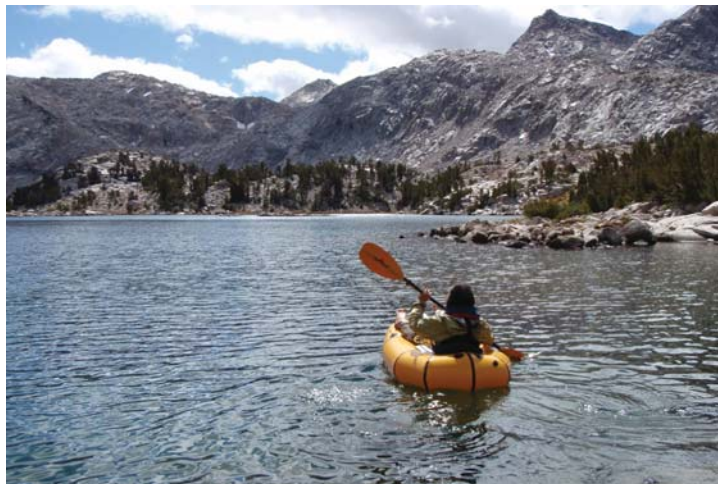
Figure 7. Biological technician paddles out to collect mid-lake water temperature profiles and a water sample in Kings Canyon National Park.