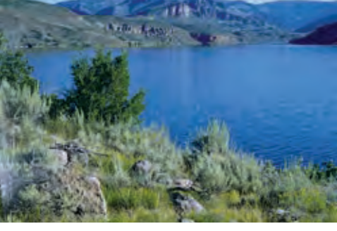
Blue Mesa Reservoir is Colorado's largest body of water and America's largest stocked kokanee salmon fishery.

The Dillon Pinnacles Trail threads dry mesa country to the spectacular Dillon Pinnacles and beyond for an impressive view of Blue Mesa Reservoir.