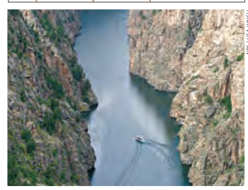
The Morrow Point Reservoir is in the upper reaches of Black Canvon.