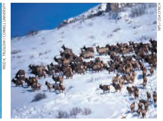
The number of elk herds that winter here depends on the severity of the weather.