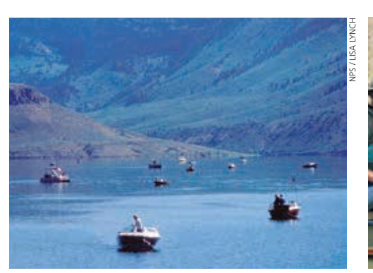
Mornings often bring calm waters at Blue Mesa Reservoir, but afternoons can bring winds and storms.

Blue Mesa Reservoir is 20 miles (32 km) long. Its three basins, Iola, Cebolla, and Sapinero, are suitable for boating.