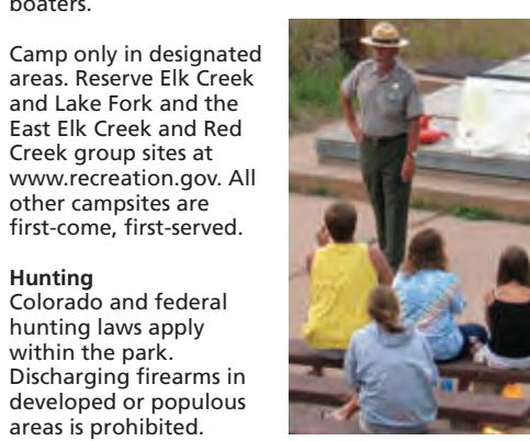
Check at the Elk Creek Visitor Center for rangerled and other program schedules.

Toxic algae can occur, primarily in summer. Check conditions at the visitor center.