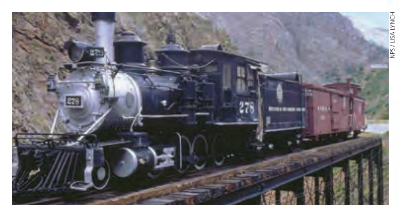
Locomotive #278, located at Cimarron, stands atop the last remaining railroad trestle along the Black Canyon of the Gunnison route.

Visit the park website for more winter recreation and safety information.