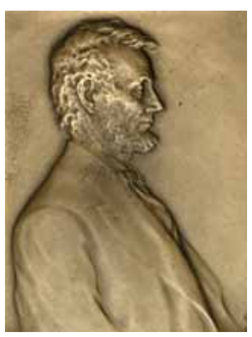
"PRESIDENTIAL MEDAL OF FREEDOM," CARL 18042