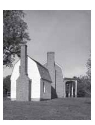
By the middle of the 18th century, the biggest plantations had 100 or more slaves, most working the tobacco fields.

final blow was the buyout, funded by a $206 billion settlement between the tobacco companies and 46 states. Tobacco auction houses closed one by one as farmers switched to other crops. The change was profound. Because raising tobacco required so many hands, it engendered a sense of community among those who spent days in the fields and barns. The auctions were an opportunity to visit with other farmers and exchange news. While there is still agriculture here, it is but a shadow of the days of big tobacco. Today, with suburban development perhaps just over the horizon, alarm over the fate of the barns helped secure a grant from the federal Save America's Treasures program. This funded research for a National Register nomination, and a project by the University of Delaware Center for