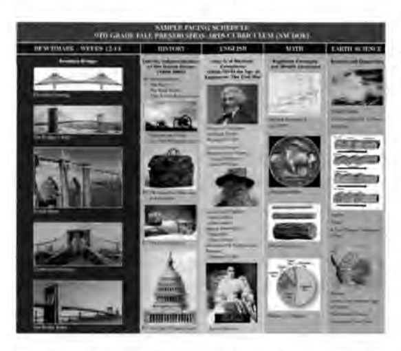
FIGURE 1 Ninth grade Preservation Arts students receive the recommended New York State Regents academic curriculum through interdisciplinary study of the Brooklyn Bridge

Fine, Visual, and Performing Arts. The goal of the Preservation Arts and Technology program is to prepare high school students for higher education or work as preservation artisans.