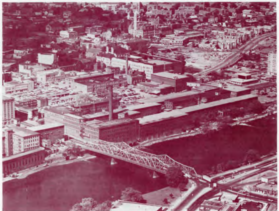
The Merrimack River in the foreground drops 30 feet at Lowell and, through an intricate canal system, powers the red brick mill complexes lining its banks. Textile mills have dominated the urban landscape since 1822 and today are integral to revitalisation and the new National Historical Park.