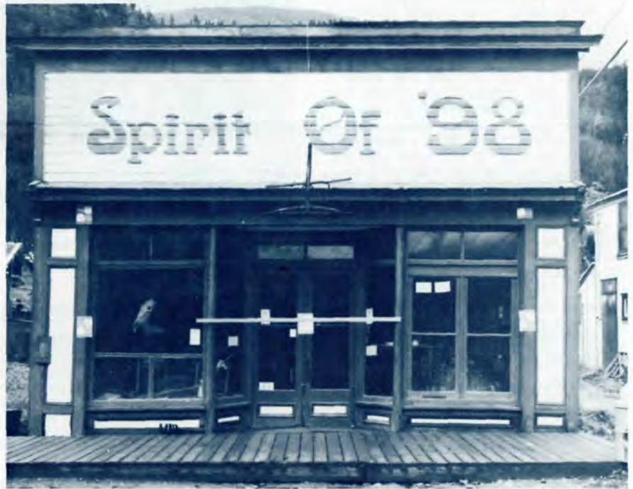
Braskett's Trading Post as seen today. Skagway, Alaska.