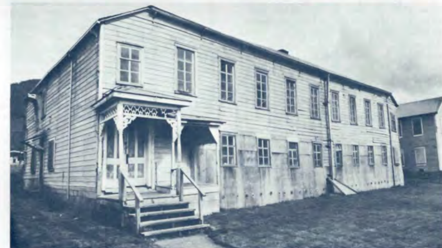
Top: Russian Bishop's House, 1985. Note the priest with the two children on the porch. Bottom: Pre-restoration Russian Bishop's House. Note the structural changes.

Size is often no measure of cultural diversity. Consider 108-acre Sitka National Historical Park which administers a variety of sites that include an 1804 Indian fort, totem poles dating from before the 1890's, and an 1842 Russian structure built for the Bishop of Kamchatka, the Kurile Islands and Alaska. A variety of Native, European, and American artifacts fill the gaps in between. Settled by the Kiksadi clan of the Tlingit Indians, captured and colonized by the Russians, and occupied by the United States, Sitka has inherited a rich cultural milieu.