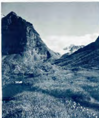
Turquoise Lake area. Lake Clark National Monument.

Both men enjoy the arctic environment as well as the skills that make