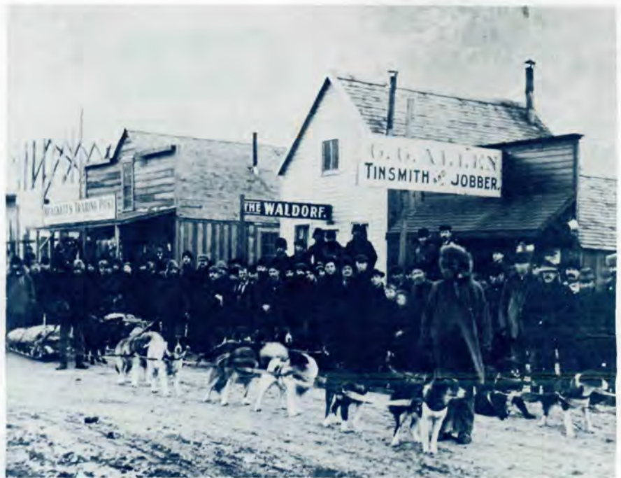
Brackett's Trading Post in December, 1897.

Endings, however, tend to become beginnings. Historic photographs uncovered for the property owner adjacent to the Ganty and Frandson grocery revealed a surprise, an ignored December 1897 photograph which showed the grocery as the Brackett Trading Post. Things began to click--Brackett's father built the town's significant toll road, Alaska's first; he also built an outfitter's store in October, 1897, but failing to clear title, moved out. This building became our bakery and grocery. As Brackett's Trading Post, its significance rose.