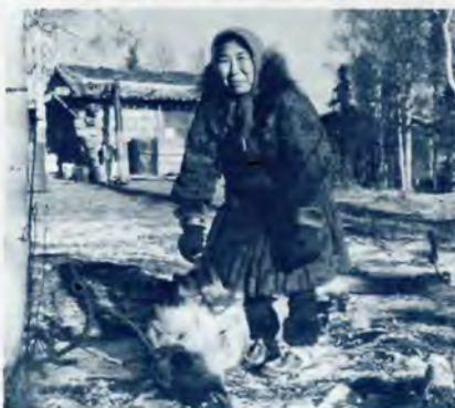
Top: Eskimo woman trimming seal intestines. Bottom: Eskimo woman butchering caribou along Kobuk River.

held that local natives should be involved in management of parks and their resources.