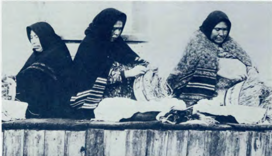
Top: Iconostasis, Second Floor Chapel, Russian Bishop's House. Bottom: Three women weaving baskets.