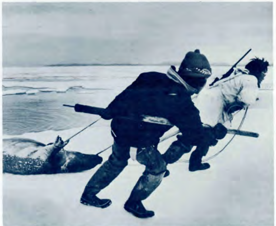
Eskimo hunters haul a seal kill in Cape Krusenstern National Monument, Alaska. The new area would permit subsistence use of renewable resources needed for human life.

A considerable amount of my time is spent questioning what it means to live in rural Alaska and to have a heritage which is reflected in one's daily life ways. I recently uncovered an old picture of Athabascan Indians gathered at a historic site near Arctic Village. The picture had particular meaning because I knew many of the people and had heard stories about the site. They were children when the