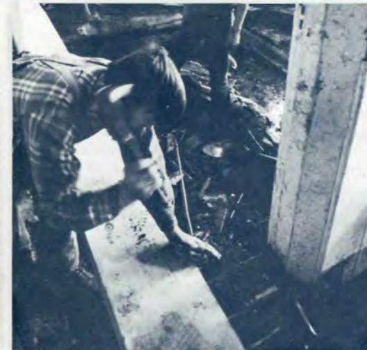
Above: Restoration activities, Russian Bishop's House. Left: Fog woman totem pole.