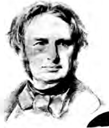
Henry W. Longfellow

In the past few years, the ratio between the time spent reviewing and that spent providing assistance in meeting National Register criteria and standards has shifted dramatically. Changing from reviewing 100 percent of the nominations submitted to a smaller percentage based on the past performance of each state and Federal agency enabled us to devote more time to developing written guidance on Register standards, conducting workshops, and evaluating the overall state and Federal programs that produce nominations. Also, as the field of those participating in the National Register programs has continued to expand in recent years, we have found it increasingly important to target guidance not only to state and Federal preservationists, but to myriad others as well, including local governments, consultants, businesses and private individuals, whose knowledge of history,