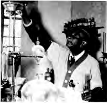
George Washington Carver

proposed action and its anticipated effects, documents previous ACHP review of the proposal, and states any actions proposed to mitigate any adverse effects of the proposal. I work with park staffs to ensure that no actions are undertaken without prior approval of XXX forms, and coordinate the review of the forms by regional cultural resources professionals. I also serve as liaison with the SHPO and ACHP to provide information they need for Section 106 consultations.