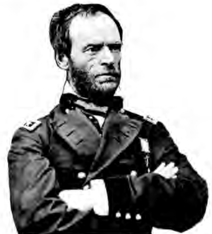
Gen. William T. Sherman

Now that we no longer review every nomination we receive, one of the ways that the National Register staff helps protect the quality of the national program is by participating in periodic evaluations of state preservation programs. One of my on-going special projects has been to assist in the formulation of procedures used to evaluate portions of the state programs relating to surveys and National Register activities, and also to develop and refine procedures for conducting nominations audits used in each of these evaluations. When these program evaluations occur every few years, each reviewer, including myself, participates in the ones for the states with which we work.