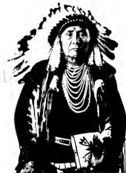
Nez Perce Chief Joseph

It is said variety is the spice of life, and it is variety that has kept my job interesting and appealing over many years, including periods of frustration with bureaucracy. It is essential that the work be grounded solidly in the application of the standards of the profession in which I was trained, the use of nationally consistent and uniform program criteria, and the constant study of resources being identified and evaluated. But the specific tasks, areas of the country, and historical themes and resources involved in my work change constantly, and thus continue to intrigue and challenge me.