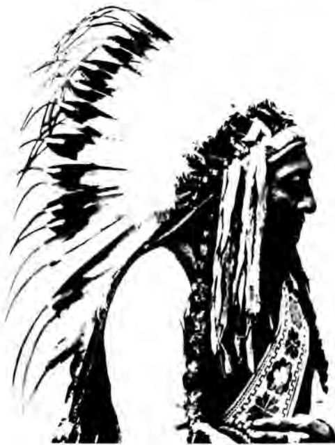
Sioux Chief Sitting Bull