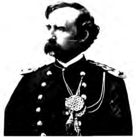
Lt. Col. George Armstrong Custer

For nominations and determinations of eligibility, my decisions generally are final on behalf of the Keeper of the National Register; for other reviews, my comments generally are advisory in nature. Frequently, I discuss unclear cases with other reviewers, and the staff