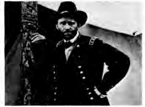
Ulysses S. Grant

DSC historians often become involved in planning, design, and construction projects as participating members of interdisciplinary teams. In this capacity they assist planning teams in the preparation of general management plans, development concept plans, and evaluation of new areas under consideration for possible inclusion in the National Park System. DSC historians have become increasingly involved in compliance concerns in recent years, working with the Advisory Council on Historic Preservation and State Historic Preservation Officers to ensure that NPS actions conform to legal requirements, and taking an active role in preparing