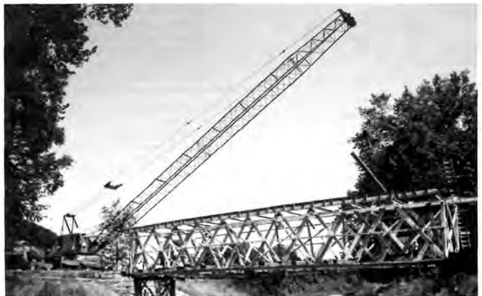
Crane lowering second truss in place.