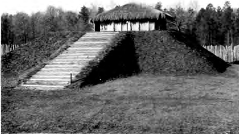
Town Creek Indian Mound, NHL, Mt. Gilead, NC.

more determined eligible for listing. Four million properties have been included in State inventories, for the most part compiled using National Register criteria and standards. The National Register is not a comprehensive catalogue of the Nation's historic resources. It is a list of evaluated properties to consult during project planning; most importantly, it is a consistent system for documenting, evaluating, and registering historic resources. National Register criteria for evaluation and documentation standards are used by every Federal agency, State, and Territory of the United States to identify historic properties for consideration in making planning and development decisions. The National Register's broad criteria, written soon after the passage of the Act, and the National Register nomination form have remained virtually unchanged in 20 years, while the National Register program has matured with the preservation movement.