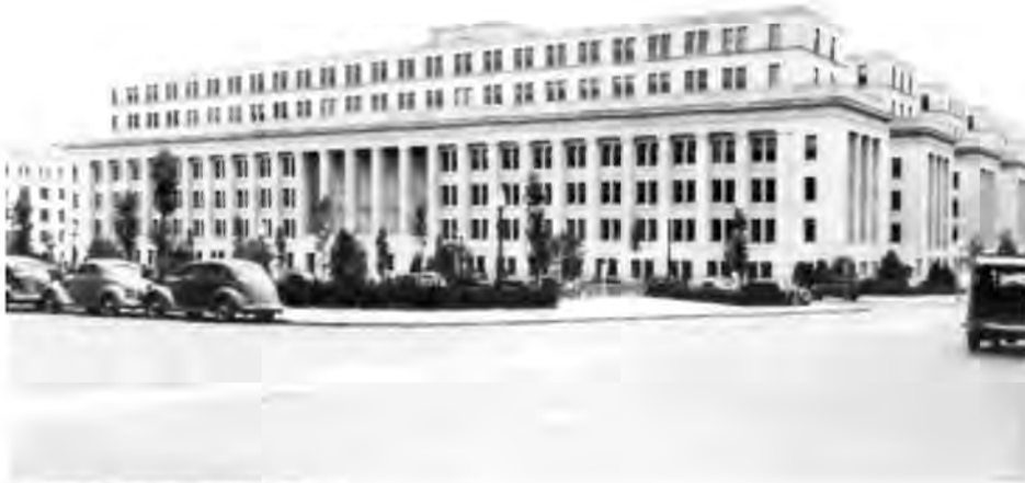
U.S. Department of the Interior.

Through a series of illustrated examples, this publication suggests ways that attached new additions can successfully serve contemporary uses as part of rehabilitation work while preserving significant historic materials and the building's historic character. This guidance should be particularly useful for anyone planning rehabilitation work on a certified historic structure because it discusses new additions exclusively within the framework of the Department of Interior's Standards for Rehabilitation.