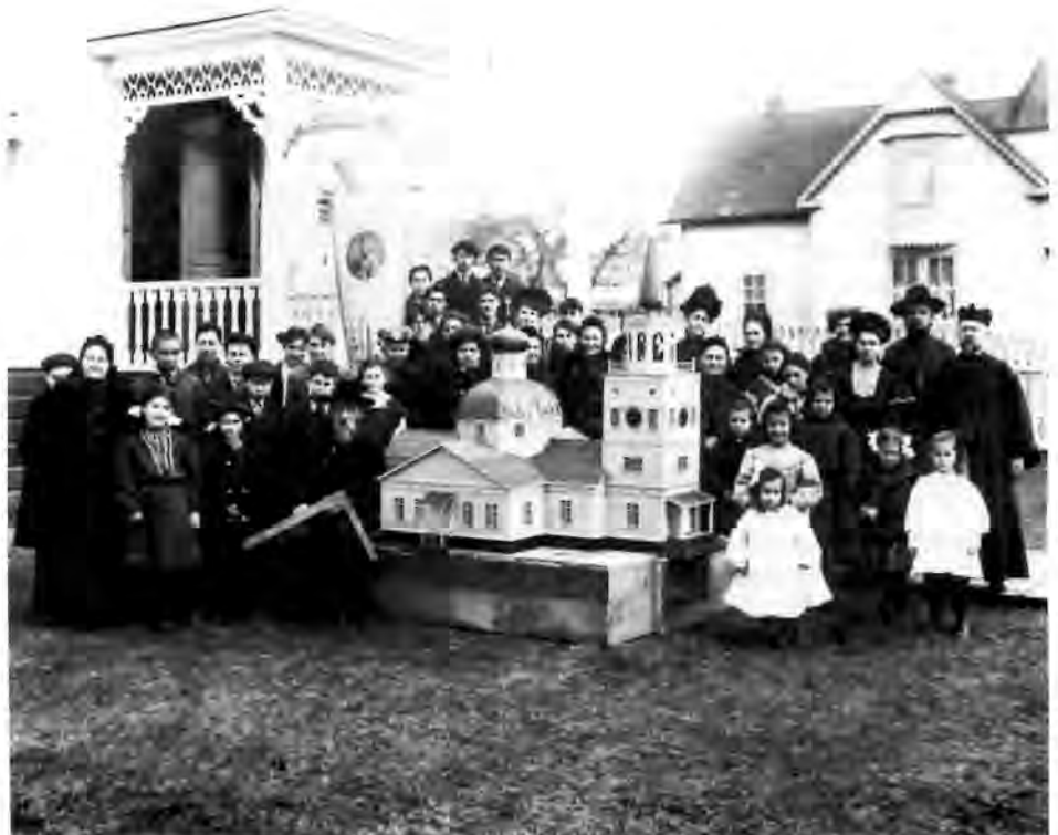
Members of St. Nicholas Brotherhood in Sitka posed around model of St. Michael Cathedral. The model was built in 1909 for a Smithsonian exhibition.