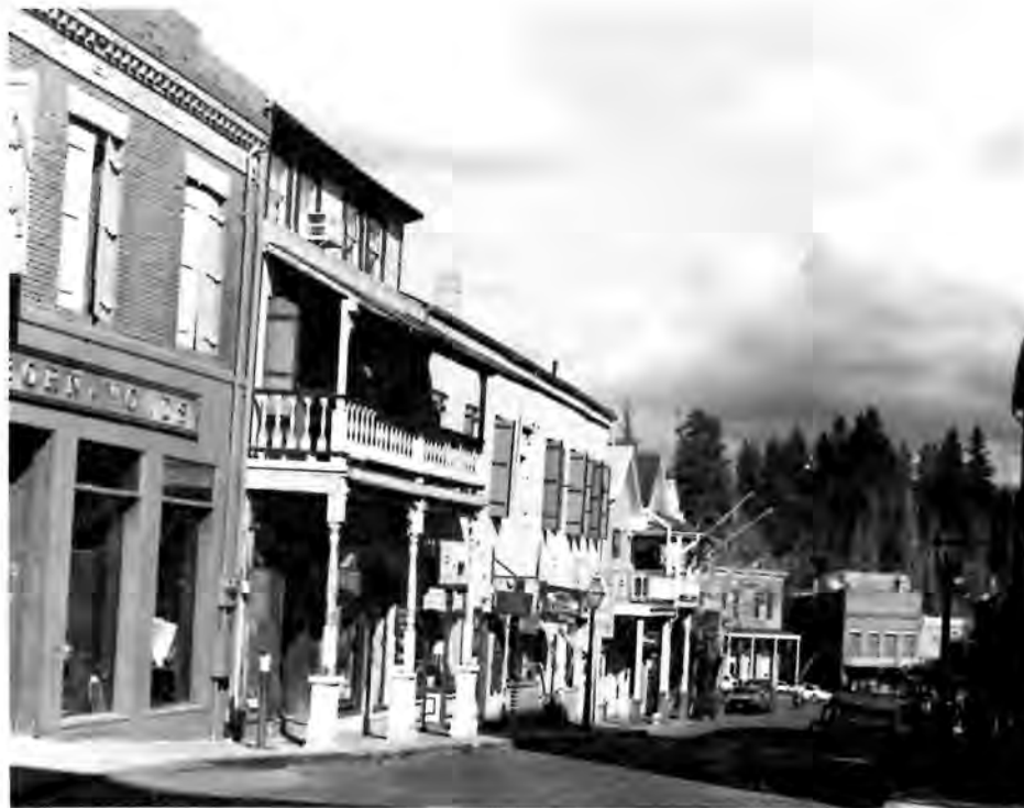
Downtown historic district (200 block of Commercial Street), Nevada City, CA.

The 1980 Amendments also better defined the role of the Department of the Interior in setting standards and guidelines to be used by all participants in the national program. The National Register staff has increasingly focused its attention more on oversight of State historic preservation programs, which must carry out their work in accordance with the Secretary of the Interior's Standards and Guidelines for Identification, Evaluation, and Registration, than on decisions about individual nominations. The National Register staff now also provides more direct