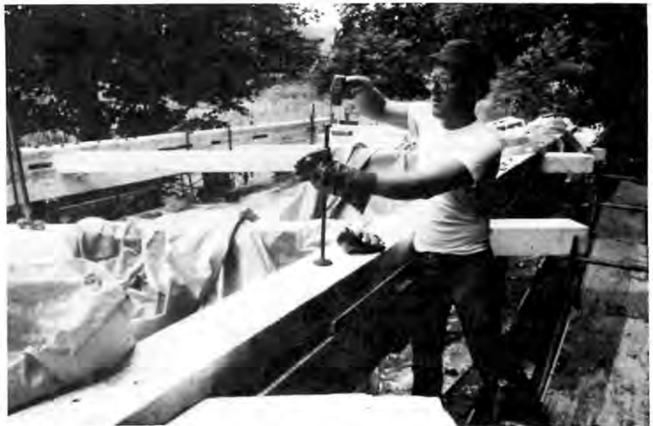
Bolting together bridge.

The bridge is 100 feet long, 18 feet wide, and 19 feet high, with a wood shingle roof which is painted red, its original color. It is open only to non-vehicular traffic to prolong its life and make its recreational use safer for hikers, bicyclists, skiers, and horseback riders.