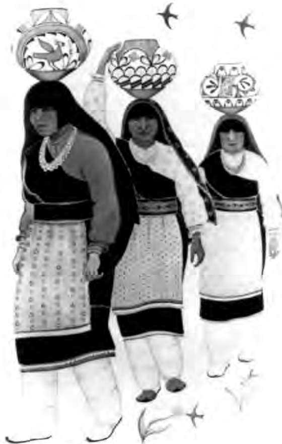
Detail from The Interior Building: Its Architecture and Its Art .

When ordering, add $4.00 for first book (foreign orders, $5.00) and $1.00 for each additional book to cover shipping. Address to: Krieger Publishing Co., Inc.; P.O. Box 9542; Melbourne, FL 32902; 305/724-9542.