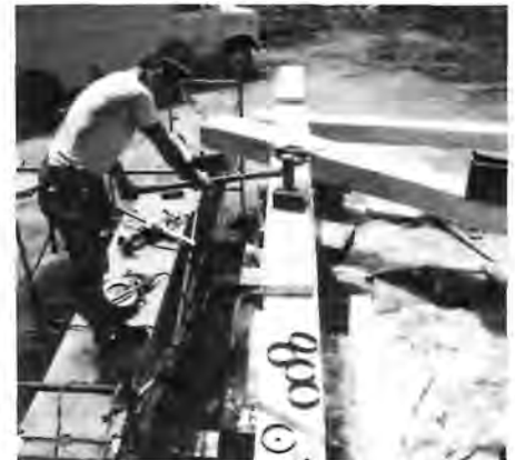
Shear connector rings.