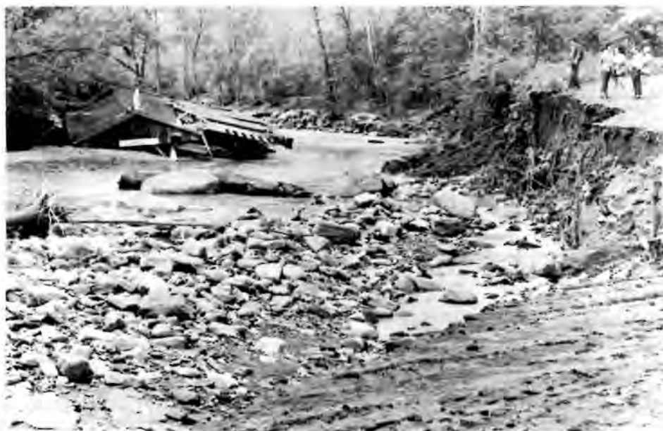
Everett Road Covered Bridge after the flood.