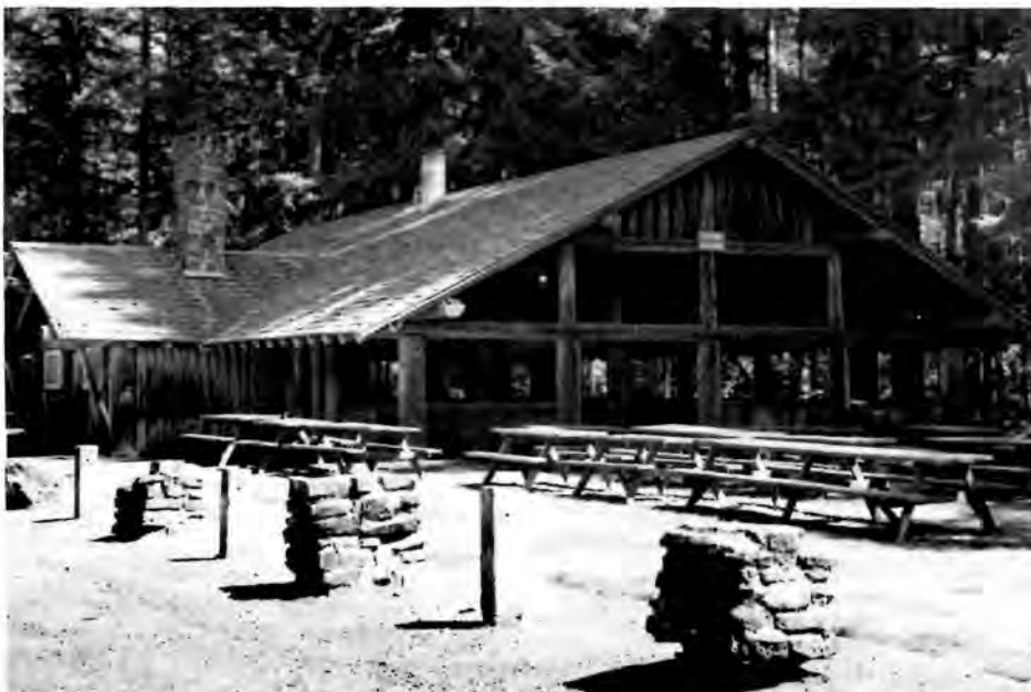
Central Shelter, Lewisville Park, Washington.

In 1974, the Housing and Community Development Act made local surveys of historic resources eligible for funding under Community Development Block Grants, dramatically increasing the funding available for local surveys. In response, the National Register published Guidelines for Local