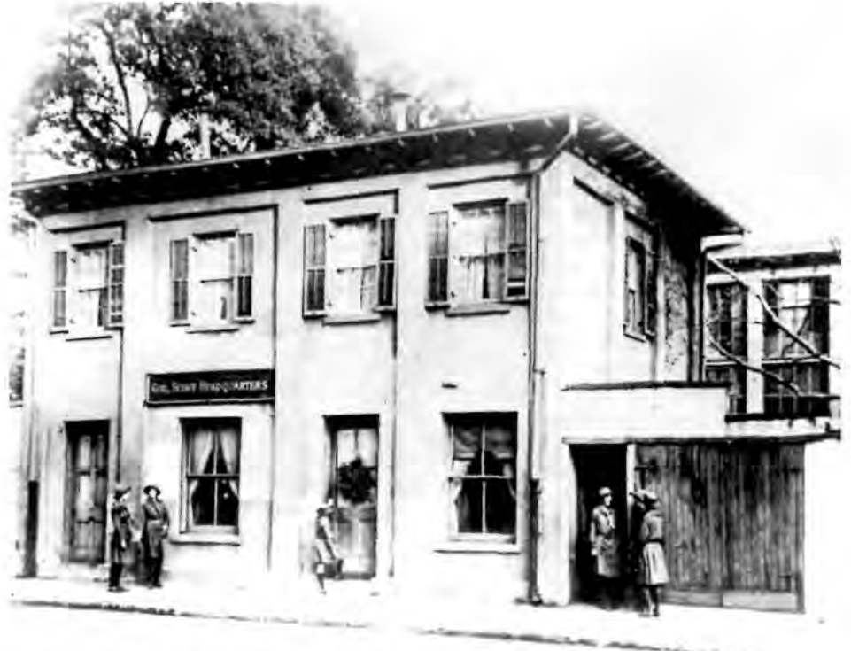
Juliette Gordon Low Birthplace, NHL (First Girl Scout Headquarters), Savannah, GA.

directed Federal agencies to locate, inventory, and nominate their historic properties, and to ask the Secretary of the Interior for an opinion concerning a property's significance before taking any action that might harm an eligible property. The NPS asked each Federal agency to appoint a liaison officer, establish procedures to accept Federal nominations, and