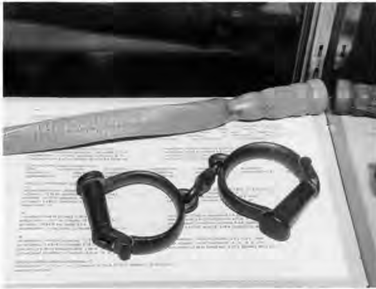
Shackles and cane. Cane was carved with the names of soldiers who were prisoners of war and resided in Scranton in the late 1880s.

prisoner of war by the Confederate Army. A magnifying glass is needed to read the name, unit, engagement when captured, date released, and prison. Soldiers captured during the last year of the war were sent to prison camps. The camps were purposefully built along a railroad for ease of delivering the prisoners. The Erie Railroad served a nearby Union prison camp in Elmira, NY, that held 12,000 Confederate prisoners. southern railroads carried Union prisoners to Andersonville, GA, and Florence, SC.