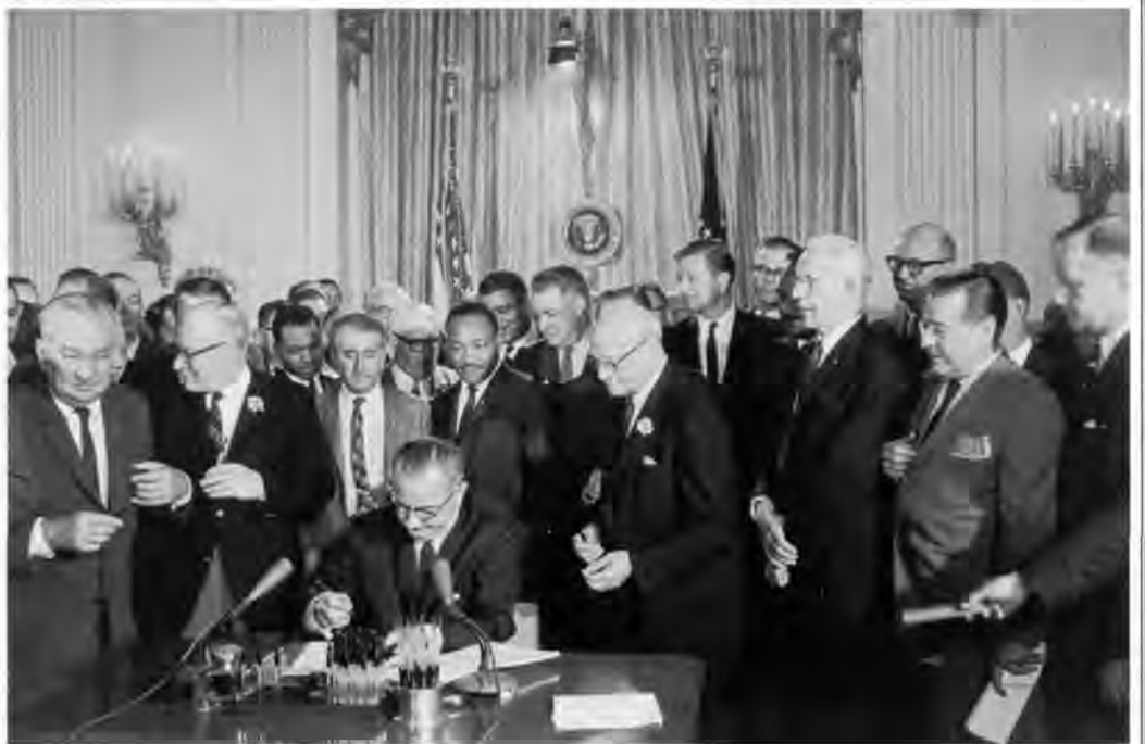
Almost a century after the ratification of the 14th Amendment to the U.S. Constitution, President Lyndon B. Johnson, with Martin Luther King, Jr., looking on, signed the Civil Rights Act of 1964. This photo is part of an online travel itinerary, "Historic Places of the Civil Rights Movement" created by the National Register of Historic Places at < www.cr.nps.gov/nr/travel/civilrights/ >.

Much of the public conversation today about the Civil War and its meaning for contemporary society is shaped by structured forgetting and wishful thinking. As popular as the war is today, there is little interest — outside academic circles — in exploring the causes of the war and considering its profound legacies. Suggestions that slavery really was at the core of mid-19th-century