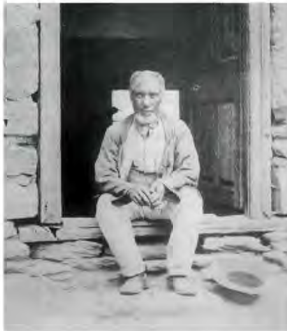
This wartime photograph shows a former Arlington slave sitting in the doorway of one of the slave quarters.

In 1857, Custis died without having accomplished his long-term goal of emancipation. Following Custis’ death, Robert E. Lee, Custis’ son-in-law, administered the estate for several years. During the Civil War, Mrs. Lee lost the plantation due to her inability to pay property taxes. Subsequently, the Federal Government purchased the property at a public auction. In