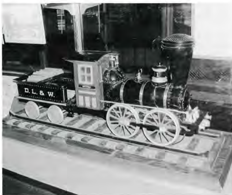
Model of the Spitfire locomotive, one of the first locomotives purchased by the Delaware, Lackawanna and Western Railroad Company prior to the Civil War.