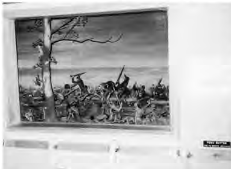
Bloody Angle diorama at the Chancellorsville Visitor Center at Fredericksburg and Spotsylvania National Military Park.

Once the national themes are in place, individual parks will “plug in” to those that best reflect that particular park’s story or resources. For exam-