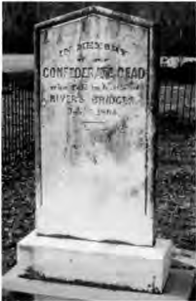
The Confederate monument at Rivers Bridge.