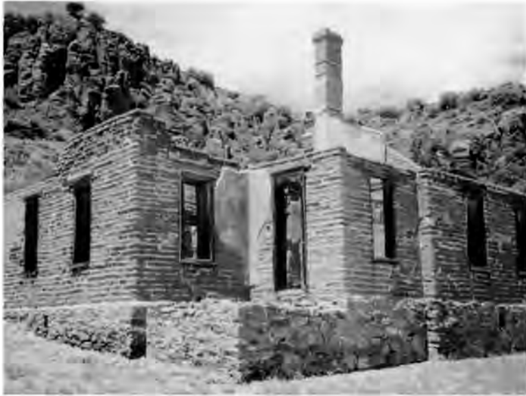
Non-commissioned Officers' Quarters, Ft. Davis National Historic Site.

adobe caps were placed on nearly all the walls, and tall unstable walls were braced with internal armatures of iron. Soil-cement adobes were used to rebuild missing corners and fill eroded wall bases. Almost every chemical in the NPS arsenal was at one time or another sprayed on a wall at Fort Union, but preservation today relies primarily on unamended mud shelter coats and adobes.