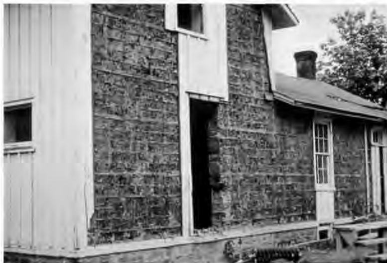
When it was demolished in the 1970s, this board-and-batten sided building in Geneva was found to be load bearing mud brick construction, originally sided with wood.