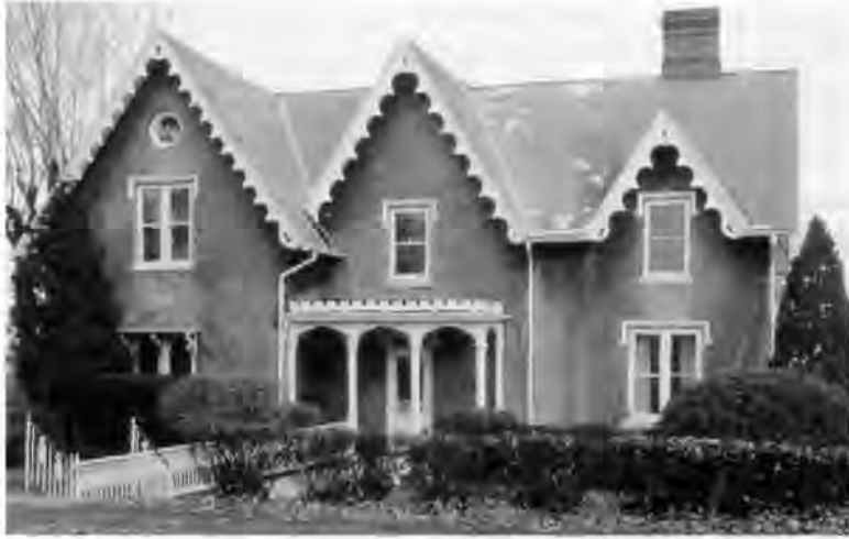
This Gothic Revival style residence in Geneva, Ontario County, New York, is typical of earthen buildings constructed in Geneva. Over 20 mud brick buildings had been constructed in Ontario County by 1855.

reported that “houses, properly constructed (of unburnt brick) are warmer, more durable, and also cheaper than frame, and are destined to take the place of the log shanty, as well as the more expensive wooden walls.”