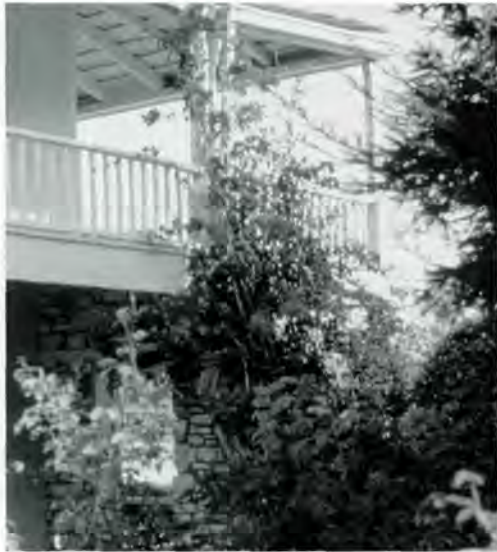
"Larkin House," Monterey, California, Monterey-style icon with broad overhanging corridors.