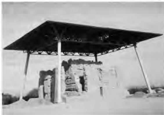
East elevation, The Great House, Casa Grande ruins.

In 1996 work began with a partnership planning team made up of the Arizona State Historic Preservation Officer, the Architectural Conservation Laboratory in the Graduate Program of Historic Preservation at the University of Pennsylvania, and National Park Service staff. The University of Pennsylvania has for eight years partnered with parks in the Southwest to answer difficult research questions, develop pilot preservation programs, and assist with training activities through the cooperative