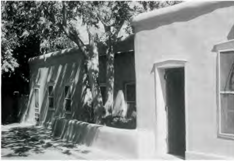
Adobe buildings fronting street line on Canyon Road, Santa Fe, New Mexico.