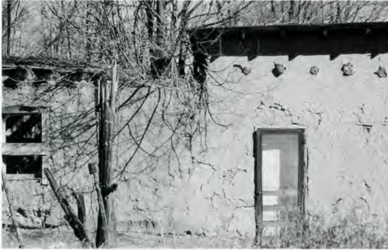
Deteriorating adobe buildings, Taos County, New Mexico.