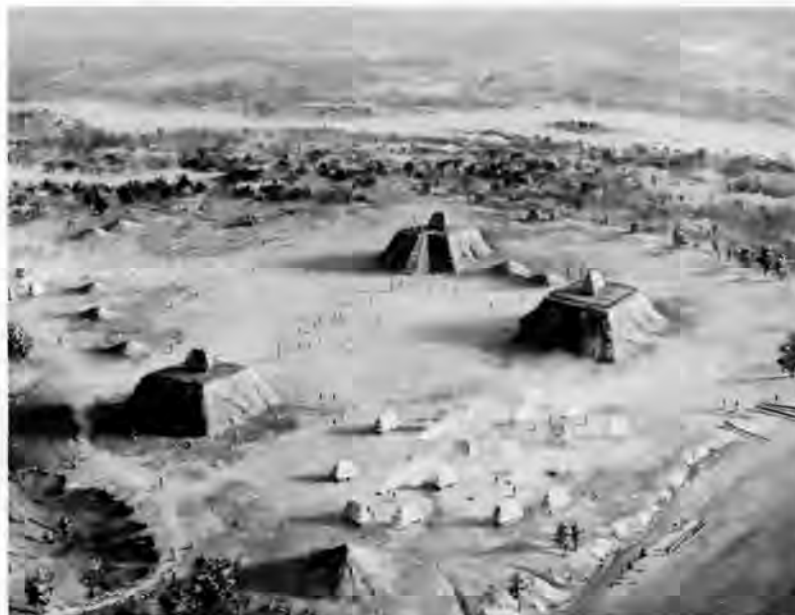
Pritchard Landing, a Middle woodland mound complex c. A.D. 800, Ouachita Valley, Louisiana.

Beginning about 3,000 years ago, groups throughout the Southeast and Midwest began a tradition of burying their dead in or below earthen mounds. Some of the earliest such mounds were small, and individuals were buried without elaborate burial goods. Collective burials were often placed in larger conical or rounded mounds. In these early mounds, most members of society were allowed burial entry; however, over time