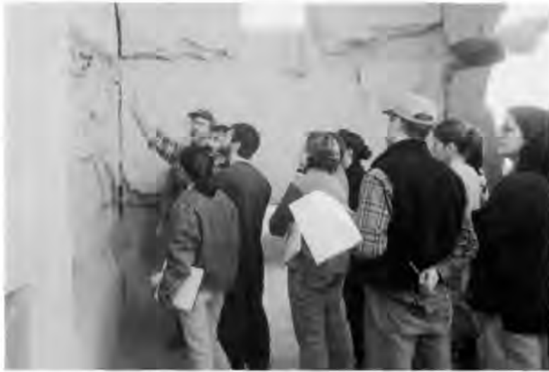
University of Pennsylvania 1998 Field School surveying interior walls.