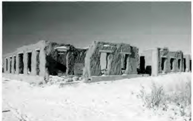
Fort Union, New Mexico, post hospital in winter.

What these forts have in common is that they were constructed nearly entirely, or in part, of adobe, and they share the modern problem of preserving such a fugitive material. Adobe construction is a good choice for arid climates because its principal agent of destruction, water, is in short supply. But it does rain and snow and blow in arid climates, and adobe left unsheltered is vulnerable. And while adobe requires little capital, it requires constant maintenance to fix leaky roofs, repair failing plasters, and replace erosion and loss.