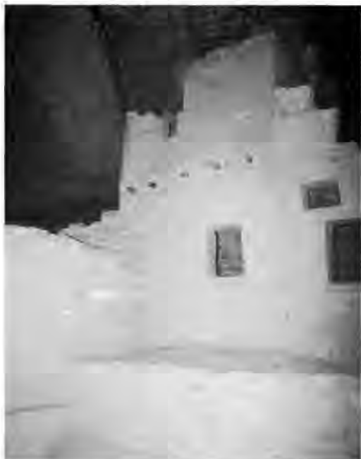
Architectural finishes on the Speaker Chief Tower in Cliff Palace, Mesa Verde National Park.

symbolic. For example, the selection and use of certain binders or aggregates for color, texture, plasticity, low shrinkage, and early or damp set all suggest a level of sophistication in keeping with other technological achievements.