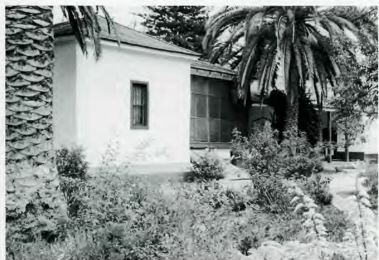
After being heavily damaged during the Northridge Earthquake, Rancho Camulos was seismically strengthened by less invasive approaches than usual.