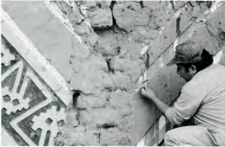
Huaca de la Luna, Trujillo, Perú. Cleaning and conservation of murals on recently excavated earthen architecture.