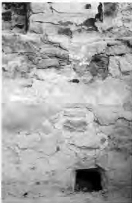
Kiva "C" finishes, Mug House, Mesa Verde National Park.

Most, if not all, conservation treatments are temporary in that they require monitoring, maintenance, and usually eventual re-application. While modern conservation principles demand treatments to be executed with stable materials and in a manner that allows for re-treatment in the future, it would be incorrect to think that many necessary stabilization techniques, such as consolidation or grouting, regardless of the materials used, are in fact reversible or allow for complete re-treatment. Therefore, every effort should