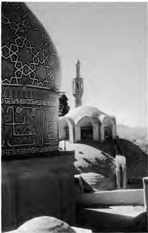
Dervish Mosque, Mahan, Iran, covered with tile.

bricks from the local soil, and employed townspeople in need of jobs to build their school. It is in sound shape today. The Works Progress Administration (WPA) made wide use of adobe and rammed earth during the drought and Great Depression of the 1930s. Farmers were relocated to Bosque Farms, New Mexico, where the government provided plats of irrigated land and arranged for the design and construction of more than 40 small homes. The government super-