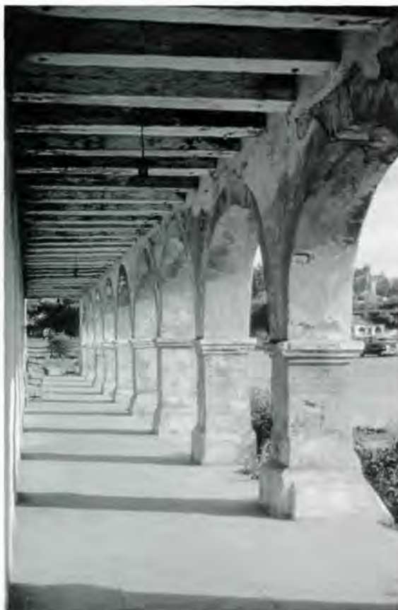
Arcaded corridor, Mission Santa Inés, Solvang, California.