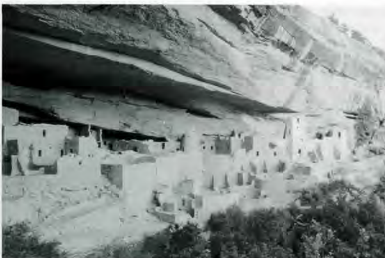
Cliff Palace, Mesa Verde National Park.

Plaster occurrence, type, and frequency of application can connote important archeological information about past technical knowledge and attitudes toward space and its differentiation. Moreover, the presence of specific components that determine physical appearance or performance can be useful indicators for identifying cultural values be they aesthetic, utilitarian, or