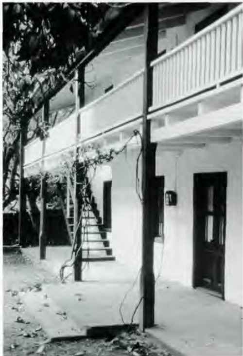
Adobe Castro, rancho rural en adobe, del estilo Monterey, en Watsonville, California.