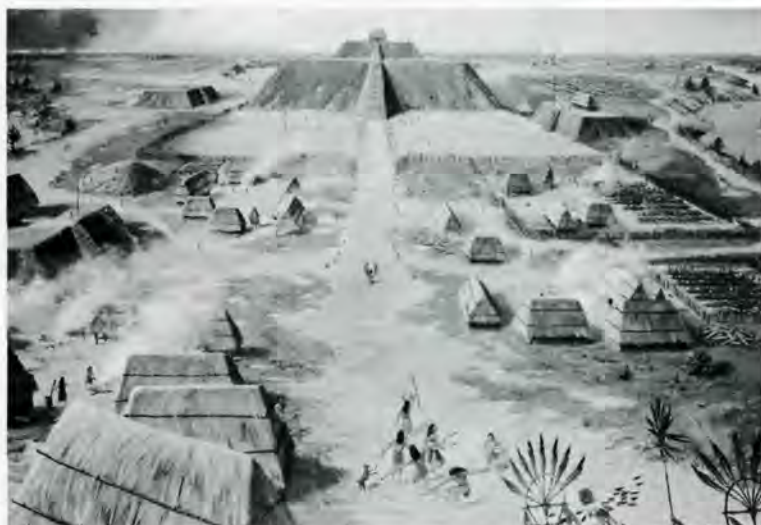
Typical Mississippian temple mound complex c. 1200-1450, southeastern United States.

The earliest known earthen construction in Eastern North America dates to about 7,500 years ago. Located at L'Anse Amour, Labrador, it is a burial mound of a child, and it measures 10 meters in diameter and 1.5 m high. The mound was built by a small group of egalitarian hunter-