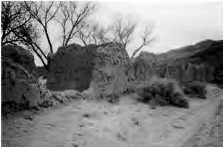
Wall fragments at Ft. Selden, New Mexico State Monument.

Military records of the day reveal that preserving the structures during their heyday was no picnic: