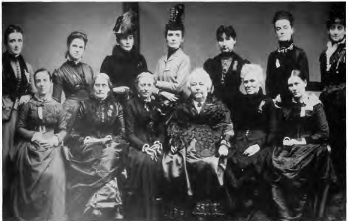
1888 International Council of Women. Susan B. Anthony and Elizabeth Cady Stanton seated second and fourth from left, first row.

Seneca Falls Convention took place within the context of active organizing for women's rights. In 1878, the National Woman Suffrage Association called the first recorded celebration, held at the Unitarian Church in Rochester, NY, in place of its regular annual convention. In addition to Stanton, delegates included Sojourner Truth, who had been speaking for women's and African-American civil rights for 27 years, Frederick Douglass, publisher and statesman, and Quaker minister and anti-slavery activist Lucretia Mott, Stanton's mentor and role model. With the character of "a reunion...of near and dear relatives...which help to sustain reformers while they battle ignorance and prejudice in order to secure justice," it was also an occasion to call for change. Stanton returned to an early theme of the women's rights movement: the "perverted application of the scriptures" which denied women equal rights. Stanton spent much of the 1870s travelling as a popular speaker, and repeatedly found the Bible used to refute her arguments about women's equality with men. She encouraged women to decide for themselves what the Holy Scriptures said about women's equality, sponsoring three resolutions on self-development. The first called it the "duty of every individual" to develop herself; the second appealed to women to exercise their own critical thinking in analyzing the