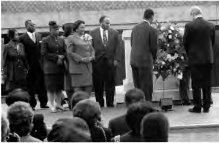
Family members and visiting dignitaries place wreaths on the gravesite to commemorate Dr. King's birthday in January and his death in April. President Clinton joined Mrs. King and family members in placing a wreath during KingWeek festivities in January 1995.

In the 30 years since his death Dr. King has enjoyed continued popularity. Individuals, communities, governments, and organizations have celebrated his message by creating physical monuments, conducting research, instituting programs, and holding yearly commemorative events. Scholarly interest in his work remains high. The interpretation of his legacy often leads to controversy over his role and his methods but the physical and intellectual monuments continue to grow.