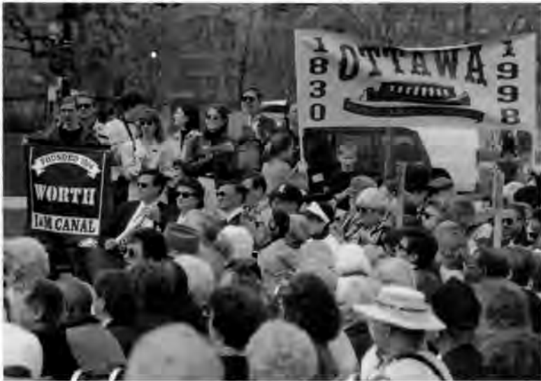
Part of the crowd at the April 18, 1998, Illinois and Michigan Canal "birthday party."

In 1994, the commission formed a committee including representatives from Corridor Commission partners, both public and private, and from citizen boosters, to plan the commemoration. Everyone hoped that the 49 Corridor communities would produce their own sesquicentennial events. Such celebrations could bring needed capital improvements, tourism dollars, and a renewed interest in the importance of the I&M Canal to the region.