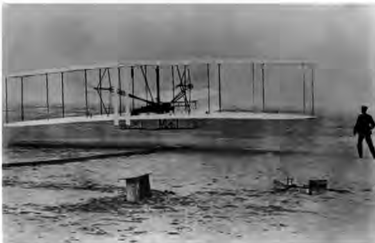
Orville and Wilbur Wright conducted the first flight on December 17, 1903.