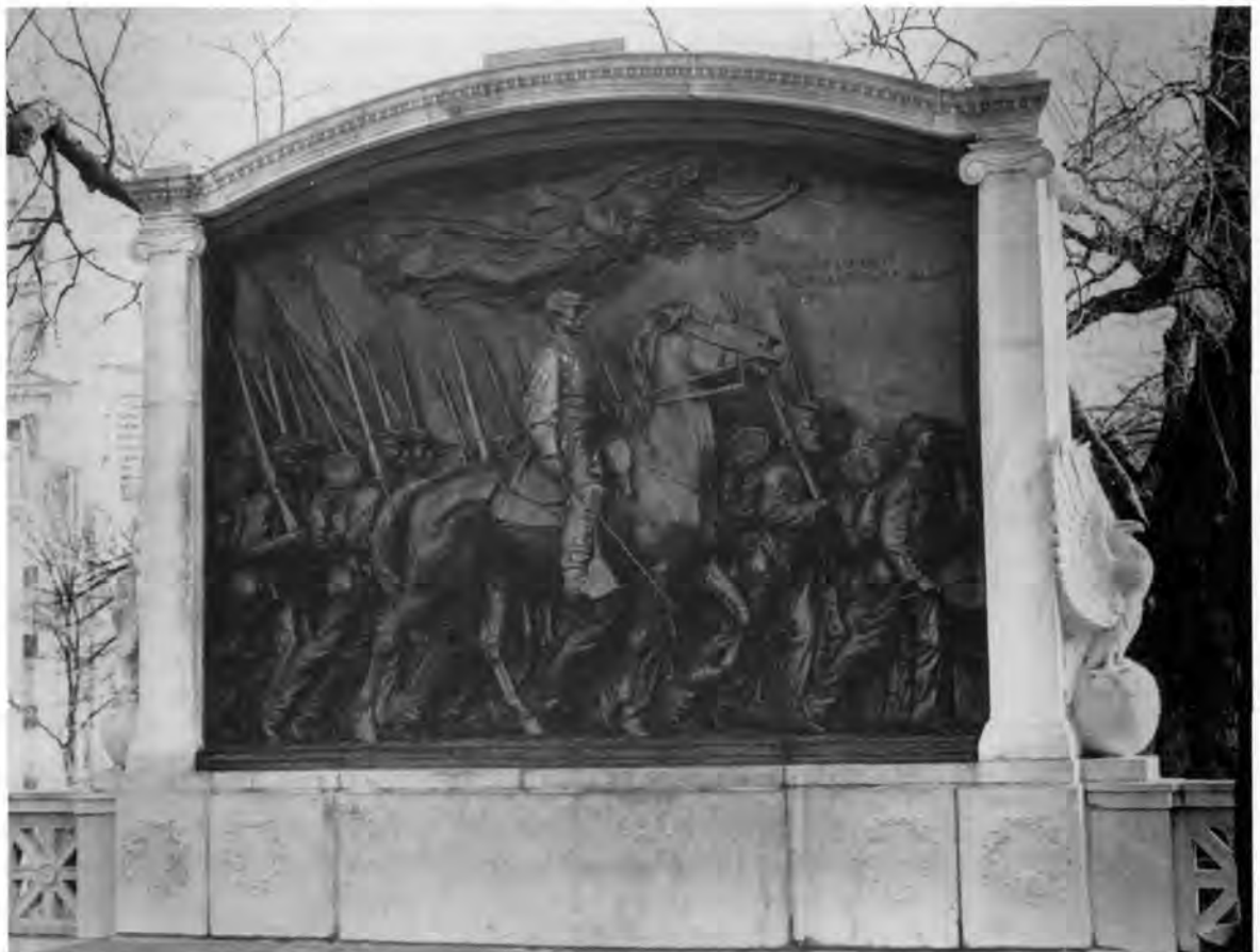
Robert Gould Shaw/54th Massachusetts Regiment Monument.

The symposium featured historians, African-American Civil War re-enactors, public figures, and others in a lively two days of discussion. The one topic that every symposium session addressed, often with strongly divergent viewpoints, was the movie Glory . Released in 1989, the film has certainly accomplished a great deal in bringing to a broad public the story of the 54th Massachusetts Regiment and the fact that African Americans played a significant role in the Union Army. Glory , starring Matthew Broderick, Denzel Washington, and Morgan Freeman, and directed by Ed Zwick, depicts Shaw and an ensemble of fictionalized black characters.