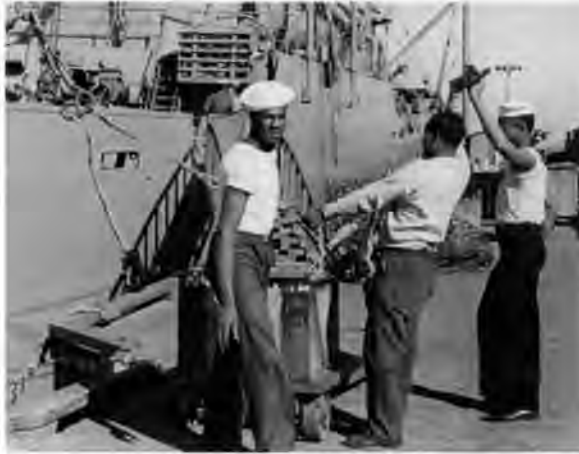
Black sailors assemble munitions.

the air, accompanied by a loud, sharp thundering. A column of smoke billowed from the pier, and fire glowed orange and yellow. Flashing like fireworks, smaller explosions went off in the cloud as it rose. Within six seconds, a deeper explosion erupted as the contents of the Bryan detonated as one massive bomb. A seismic shock wave was felt as far away as Boulder City, Nevada. A pillar of fire and smoke stretched over two miles into the sky above Port Chicago.