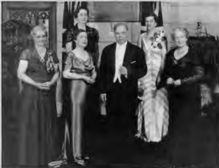
Unveiling the plaque dedicated to the Famous Five Alberta women and the Persons' Case. In 1929, Canadian women were recognized as "persons" within the meaning of section 24 of the British North America Act. The case which led to recognition is commonly referred to as the "Persons' Case" and involved women's eligibility for appointment to the Senate. To commemorate the five Alberta women, Magistrate Emily F. Murphy, Henrietta Muir Edwards, Nellie L. McClung, Louise C. McKinney, and the Honourable Irene Parlby, a plaque was installed by the Canadian Federation of Business and Professional Women's Clubs and unveiled by the Right Honourable W. L. Mackenzie King, Prime Minister of Canada, on June 11, 1938. In this picture: the Honourable Irene Parlby (left), the Honourable W. L. Mackenzie King, Mrs. Nellie McClung, (right) and three representatives of the Women's Clubs.

Henrietta Muir Edwards (1849-1933): journalist, suffragist, and organizer. She started the Working Girls' Association in Montreal in 1875 which was a forerunner on the YWCA. She edited a paper for the working women of Canada. Later, while living in Alberta, she compiled two works on Alberta and federal laws affecting women and children.