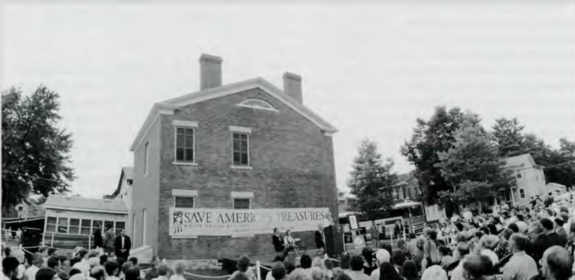
First Lady Hillary Rodham Clinton unveils the "Honor the Past, Imagine the Future" badge, which is identical to the "Save America's Treasures" logo.