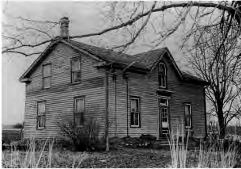
Adelaide Hunter Hoodless Homestead, St. George, Ontario. Built in the 1830s, this house, a wood frame building, is representative of a vernacular type widespread in eastern and central Canada during the first half of the 19th century. This house tells the story of the rural domestic experience. It was the hard labour and the isolation of the rural Canadian woman's lot that Adelaide Hunter Hoodless tried to alleviate.

Institute with the help of Erland Lee of Stoney Creek, Ontario, a well known member of the Farmer's Institute. Their goal was to foster women's education in rural communities and to encourage their involvement in national and world issues. The organization's motto, For Home and Country, was a statement of its objectives: value rural life; inform women through the study of issues, especially those concerning women and children in Canada and around the world; and foster joint projects to achieve common goals. This group was especially focused on education, notably on domestic science and home economics. It was sometimes called the "university for rural women".