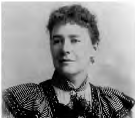
Lady Ishbel Aberdeen (Ishbel Maria Marjoribanks, 1857-1939), was instrumental in forming the Canadian Branch of the National Council of Women and in founding the Victorian Order of Nurses for Canada.

cooking, and assistance in midwifery. However, this concept of home nursing ran counter to the aims of women who wished to establish nursing as a full profession within the field of medical services. At that time, some nursing leaders who were establishing new hospital training schools were trying to change the generally-held view, which Lady Aberdeen initially shared, that nursing was part of the traditional female domestic role which could be carried out by any middle class woman who volunteered her time. The newly professional nursing field viewed it as work to be performed by specially trained, remunerated, and professional nurses. Lady Aberdeen was soon convinced of the advantages of a professional status for women in nursing and the Victorian Order of Home Helpers became the Victorian Order of Nurses.