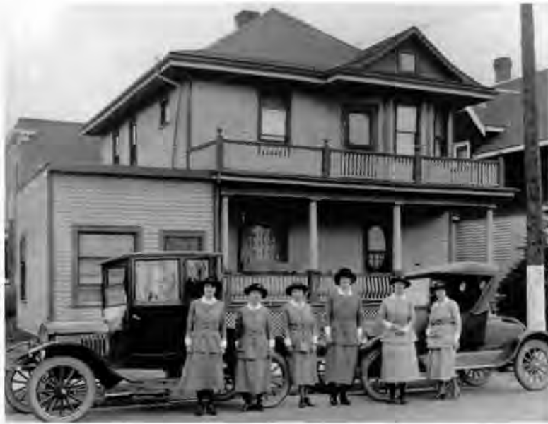
A group of nurses of the Victorian Order of Nurses for Canada in front of their cars in the 1920s. Women driving automobiles were rare sight in Canada up to the 1920s. But a visiting nurse driving a car could make twice as many visits. Thus VON nurses were among the first Canadian women to get behind the wheel for their work.