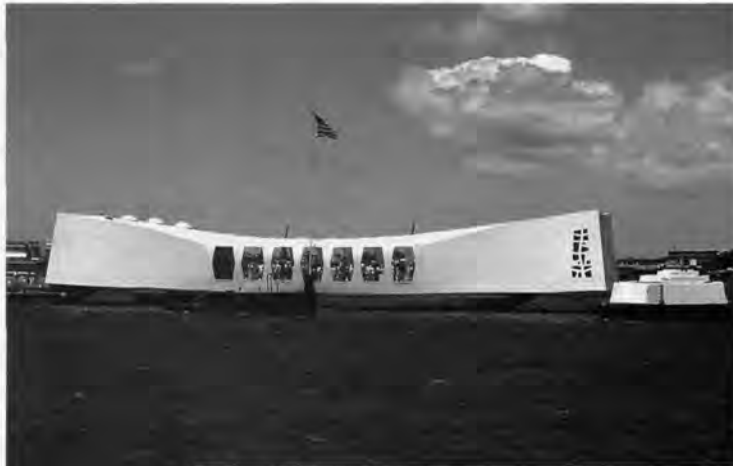
USS Arizona Memorial, Honolulu, Hawaii.

The criticism came to a head before the ceremonies commemorating the 50th anniversary of Pearl Harbor in December 1991. A film shown in the visitors’ center—ironically, produced by the Navy—was deemed by critics to be too sympa-