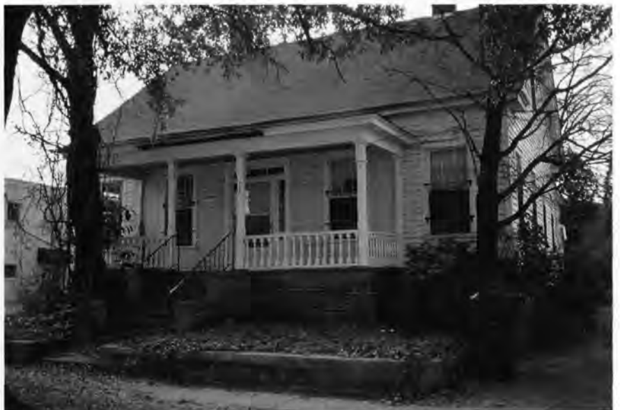
The Columbia, SC home of Modjeska Monteith Simkins, a founder and secretary of the statewide NAACP, is listed in the National Register of Historic Places.

This report surveys the extent to which the civil rights movement of the 1950s and 1960s has been commemorated in the United States. It concludes that there are