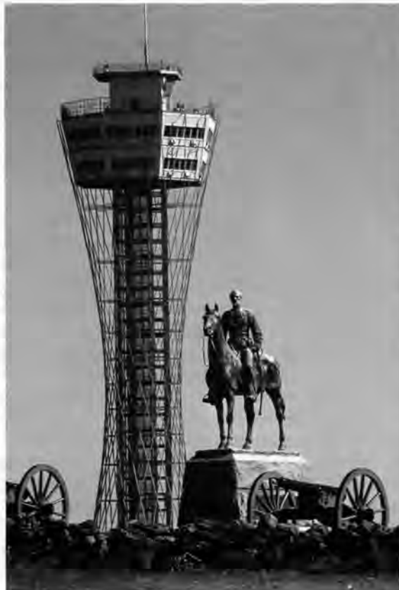
Gettysburg.