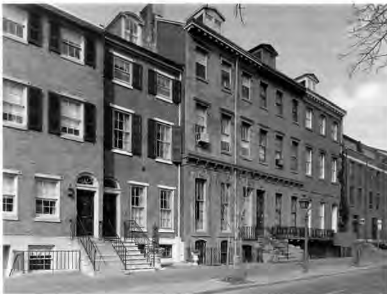
Society Hill Historic District, Philadelphia, Pennsylvania. Photo by G. Thomas, Clio Group, Inc., 1986. Courtesy National Register of Historic Places.

The traditions of preservation and conservation can't be said to reflect the mainstream of American culture, although undeniably there is support for these values. Unfortunately, we as Americans have liked our history served to us as amusement, sanitized and interpreted, but preferably not in our own neighborhood. Historic towns and cities, nice places to visit—but to live in? As we contemplate many of Pennsylvania's 19th-century industrial cities and their struggle for survival, it is becoming clear that a generation of our citizens has never set foot in them, and only knows shopping malls, highway commercial strips, and dormitory suburbs. Their puzzlement at our concern must be similar to that of the U.S. Army Corps of Engineers at the effort to save the snail darter—total incredulity.