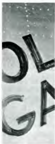
The Boeing B-29 Superfortress Enola Gay landing after the atomic bombing mission on Hiroshima, Japan.