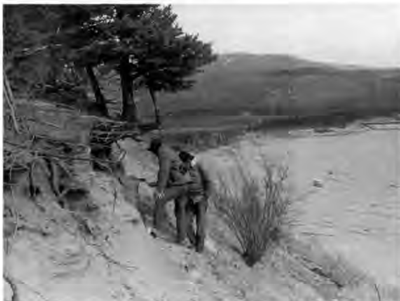
Dry Creek Archeological Site, Alaska. National Historic Landmark file.