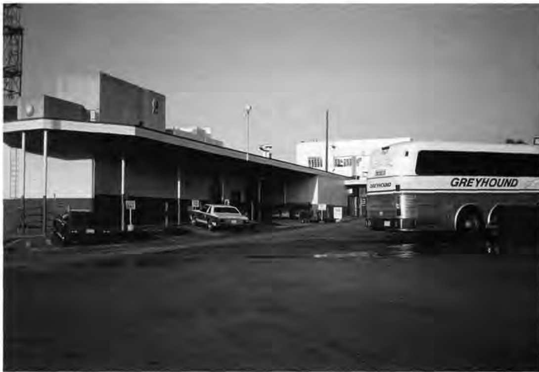
The scene of mob violence against Freedom Riders in 1961, the Greyhound Bus Station in Montgomery, AL, will become a museum of civil rights history.

as new construction), the publication of guides to African American heritage sites by state and local governments, and the erection of historical plaques. In addition to these public efforts, private non-profit organizations are also playing a significant role. Their work has ranged from commissioning memorial sculpture to establishing museums and research centers.