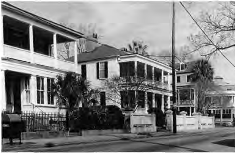
Charleston Historic District, South Carolina.

Is this to conclude that implementing historic preservation strategies, such as historic