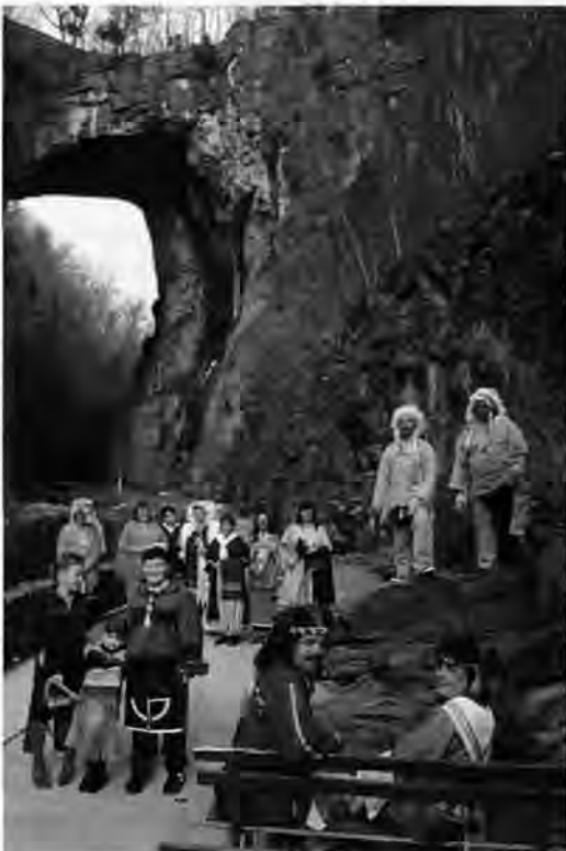
A group of Virginia Monacans at the foot of the Natural Bridge where they celebrated their return at the April Powwow.