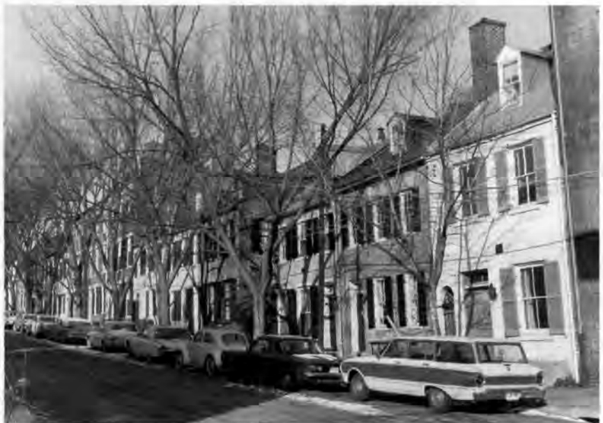
"Captain's Row," Prince Street, Alexandria Historic District, Virginia.