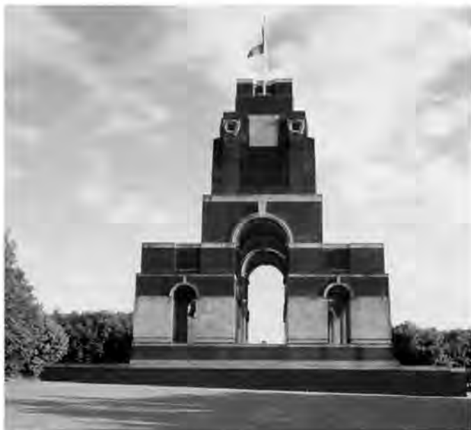
British Memorial, Somme, near Albert, France.

Armed conflict in America has been a much more limited and infrequent phenomenon. Perhaps it is for this reason that Americans have directed significant attention to the physical remnants of the few major wars actually fought on American soil by designating a series of land-based parks to preserve hallowed ground while memorializing and interpreting armed conflict. The National Park Service (NPS) has been assigned to protect and interpret many battlefields and militarily-oriented cultural resources. Additionally, there are state, county, and private battlefield sites and parks scattered throughout the United States. The typical battlefield park is now a well-maintained attraction with a visitors center, loop road, interpretive signs, numerous dramatic monuments, and various cultural resources. America's battlefield