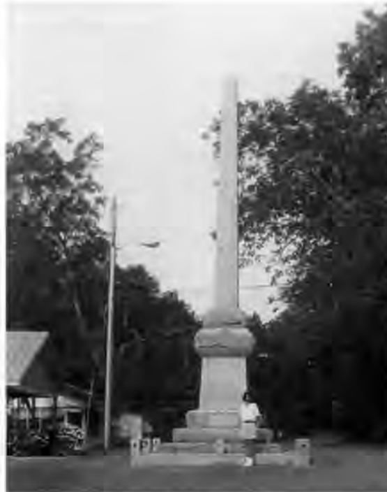
Wirz memorial.