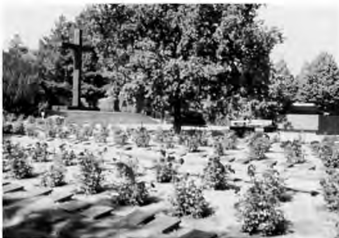
Finnish Cemetery, Helsinki, Finland.