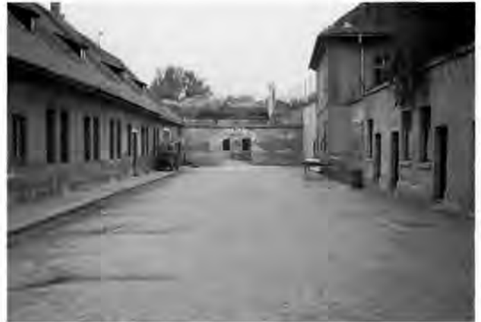
Terezin, Czechoslovakia, Nazi concentration camp.

Europe's commemoration of the Nazi concentration camps projects a grim picture of the Third Reich. Existing structures and complexes were recycled to serve as prisons. For instance, the structures at the concentration camp in the Munich suburb of Dachau served originally as the Royal Bavarian Gun Powder factory. Another prison outside of Antwerp was originally a major fort—the National Memorial of Fort Breendonk honors the 4,000 Belgians incarcerated there.