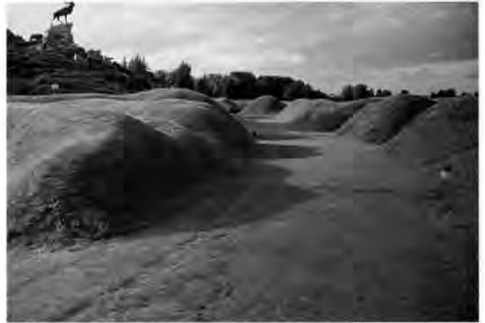
Communication Trench, Beaumont Hamel, Somme.

parks and attendant military cemeteries offer a roadside educational and entertainment package. The European sites necessitate visitors to be more self-directed. There is less emphasis on the preservation of adjacent hallowed ground. The American approach to battlefield commemoration generally does not hold true for similar resources in Europe where smaller land based units and less publicly-financed facility development is apparent. Europe's approach is serious and reflective, less entertaining. Europeans place less emphasis on public recreation and interpretation while dramatically symbolizing the costs of war at somber battlefield cemeteries and memorials.