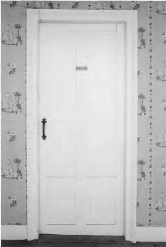
Fig. 1. John Adams Birthplace, Parlor, North Wall, Door to Lean-to, Existing Conditions, 1979. Hidden behind this doorway's surfaces is a complicated history. Investigative analysis of the wall around the doorway, along with the analysis of artifacts taken from their features, suggested the following evolution. Originally, this north wall was an exterior wall without a doorway. Shortly after construction, presumably when the lean-to was extended across the entire north side of the main house, a doorway was introduced. During the Thomas Boylston Adams remodeling, the doorway was eliminated and the opening closed with plaster. In the mid-19th century a doorway (seen above) was reinstated on this wall. However, the new doorway was not in the exact position of the earlier doorway, but was located about a foot farther east. Apparently, the originators of the second doorway did not know that a doorway had previously existed in this relative location. Multiple artifacts were removed from the features associated with this doorway. A closer look through the microscope at each artifact type and the information that it provided relevant to the identification of the Thomas Boylston Adams period treatment follows in figures 2-5.