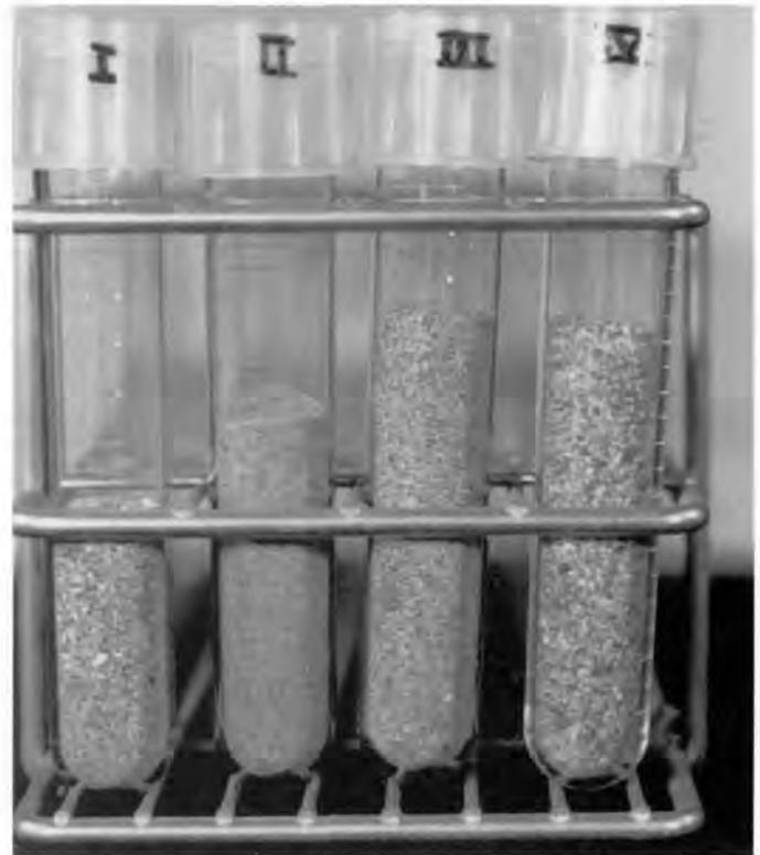
Fig. 3. Examples of Plaster Sand Types, After Analysis. Note that aggregate composition, size, and quantity differ between types. The architectural conservator retrieved a population of plaster samples for analysis from locations throughout the birthplace. These plaster samples were taken from areas of known, suspected, or

nail (specifically, the design of the head and the shank below the head) link it with a nail type produced and/or used in the Boston area between 1796-1815. The characteristic head of this nail type lacks uniformity in shape and size. It is positioned generally eccentric to the shank; i.e., lopsided. In addition, there is a distinct roundness (necklike) under the head that was created by the compression of the clamping device (a heading vise used to grip the nail). This nail type was found securing the lath for the plaster that covered over the first doorway described in figure 1. Its manufacture date suggested that this alteration to the parlor was made during the Thomas Boylston Adams period.