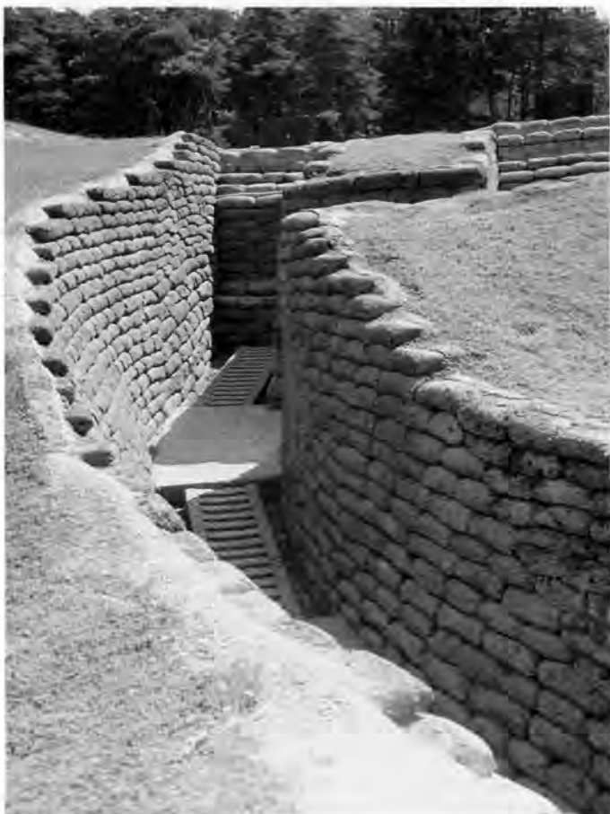
Vimy Ridge, Northern France.

Presentation of the major 20th-century wars varies greatly depending on whether a nation experienced victory or suffered defeat. On the Allied side, in every village, town, and city (many crossroads too) one can see a memorial, statue, or plaque to honor the fallen. The sheer volume of memorials and names denoting World War I dead is much greater than World War II. In France the positive symbolic perception of its success in WWI is just the opposite of its collapse a generation later. For example, it is difficult to find large WWII memorials. The