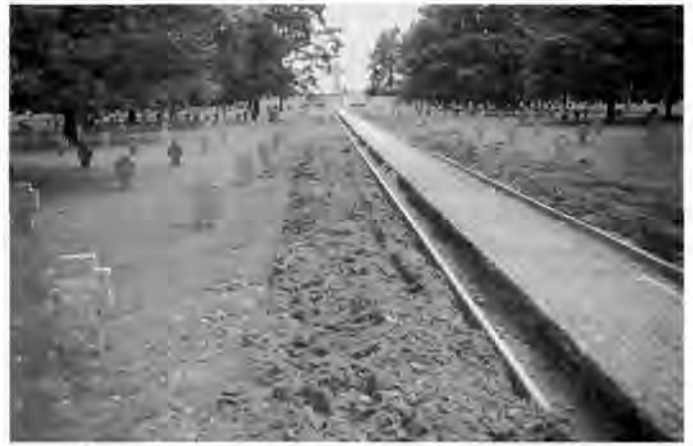
German Cemetery, Luxembourg, near Ham.

Second World War commemoration also relies on statues and cemeteries, but places large emphasis on military hardware such as guns and tanks. The Normandy invasion area and the Battle of the Bulge are well marked and signed. Tanks, landing craft, and mammoth gun emplacements attract visitors. Numerous appreciative memorials and statues commemorate the rank-and-file GI, General Patton, and American action in Belgium/Luxembourg's Ardennes in late 1944-early