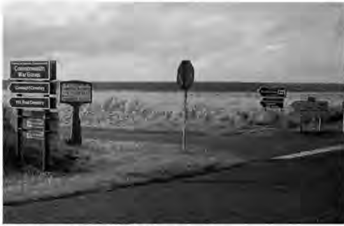
Somme Crossroads. British/French cemetery markers.

Visitors can peer through ground-level windows to view the unidentified human remains. This open display of physical remains at ossuaries is a more literal, funereal style of interpretation. The battlefield region has museums and the interpreted ruins of destroyed villages, (now just shallow depressions with signs denoting locations of the city hall, schools, shops, and houses). One particularly grim site at Verdun is a trench ( Tranchee des Baionnettes ), which was filled by a large German shell and in which was buried a line of French soldiers with fixed bayonets. Now only the rusted tips of the bayonets remain pointing skyward protected by a modest canopy. Throughout the Verdun region many skull and crossbones signs warn visitors not to enter fenced-off areas that still (78 years later) contain unexploded shells. The French take a grim and sober view of losses to their nation during the Great War. Unlike the strong and erect British military statues found in English communities, at Verdun an especially dark view of war is symbolized by a statue of a dead French soldier depicted in Medieval sepulchral style.