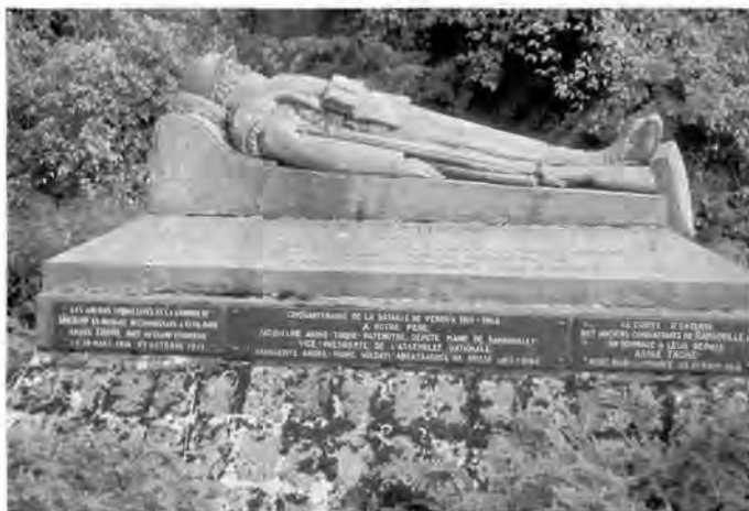
Verdun. Original memorial with subsequent plaques attached.

1940-45 years are usually denoted by a modest plaque attached to the heroic style ubiquitous WWI memorials.