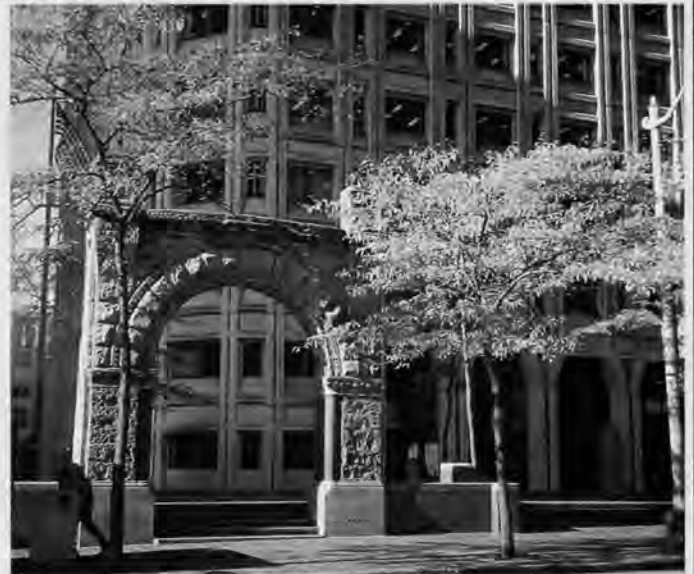
The original arch from the Romanesque-style Burke Building forms an inviting entry to the brick plaza of the Jackson Federal Office Building.

Is this project a good example of the re-use of architectural fragments? Does it teach us about Seattle's history and early building technology? Since none of the loose architectural fragments can be found, does the project become more acceptable to critics? These questions were posed to an interested group of participants at a roundtable of the