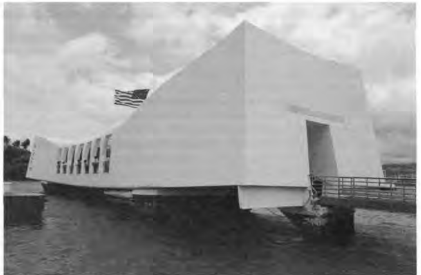
USS Arizona Memorial, Pearl Harbor, Hawaii