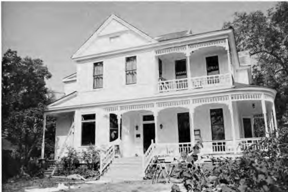
This house at 1200 Dauphin Street in Mobile was condemned by the fire marshal and was days from demolition (August 1990 photo). After being placed on the Endangered Properties List, it was purchased by new owners and underwent a $80,000 restoration in which a $10,000 facade grant played a role (September 1992 photo).