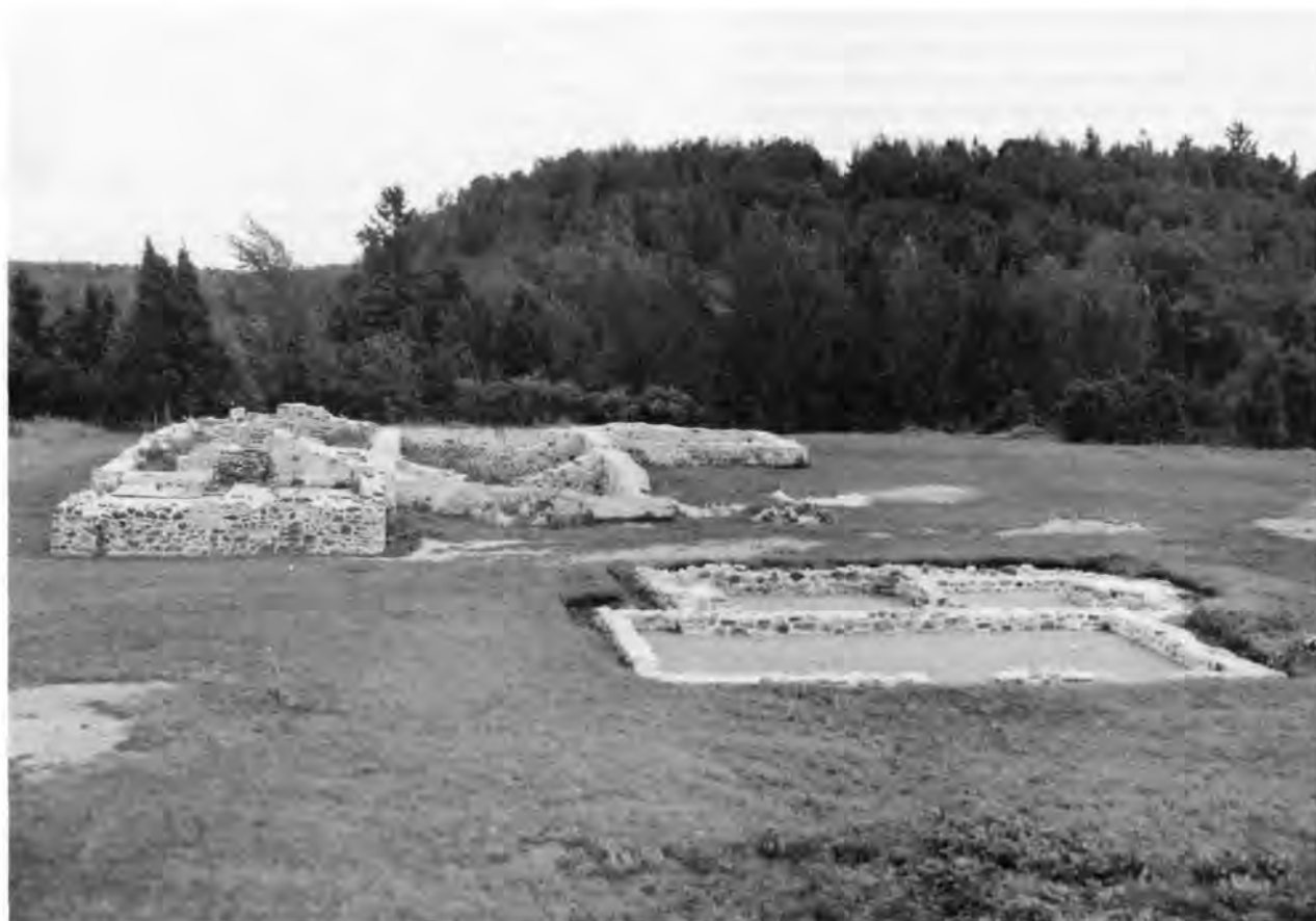
Stabilized ruins of La Grande Maison and the bakery (foreground) at Forges du Saint-Maurice NHS in 1973: major intervention, minimal presentation.