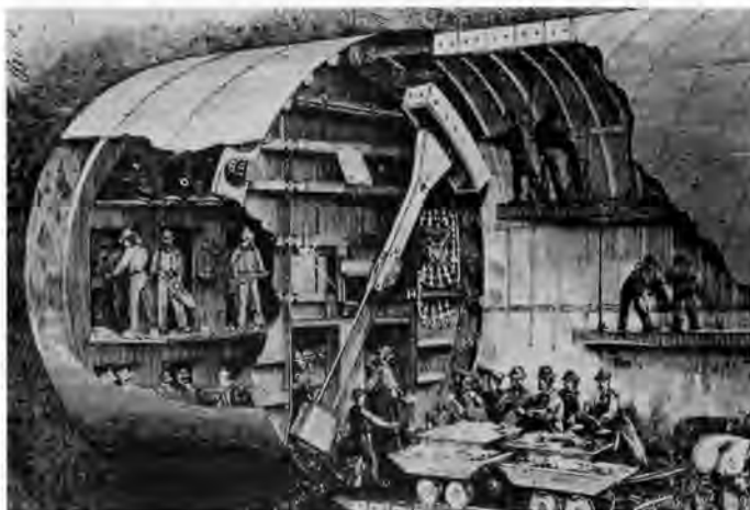
Excavating and assembling the cast iron tunnel lining. Scientific American , August 9, 1890.