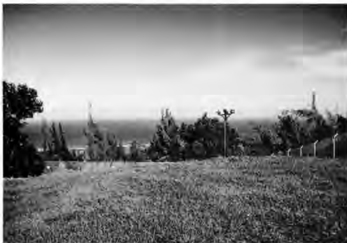
Opana radar site, Kawela, Hawaii, view looking north.

An even more significant aspect of the Opana radar story was the fact that the potential military implications of radar was now obvious for all to see. The use of radar gave the United States the important technological edge that was needed to redress the balance of power with Japan in the Pacific in 1942. In the months after Pearl