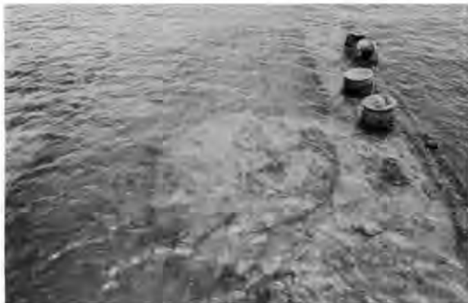
View of USS Arizona under the surface.

many of which are on lands administered by the Department. Sites and programs of the National Park Service will continue to be used to enhance public respect for and understanding of the events leading to the Allied triumph over the Axis.