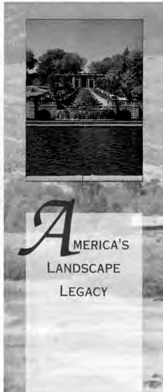
America's Landscape Legacy brochure.