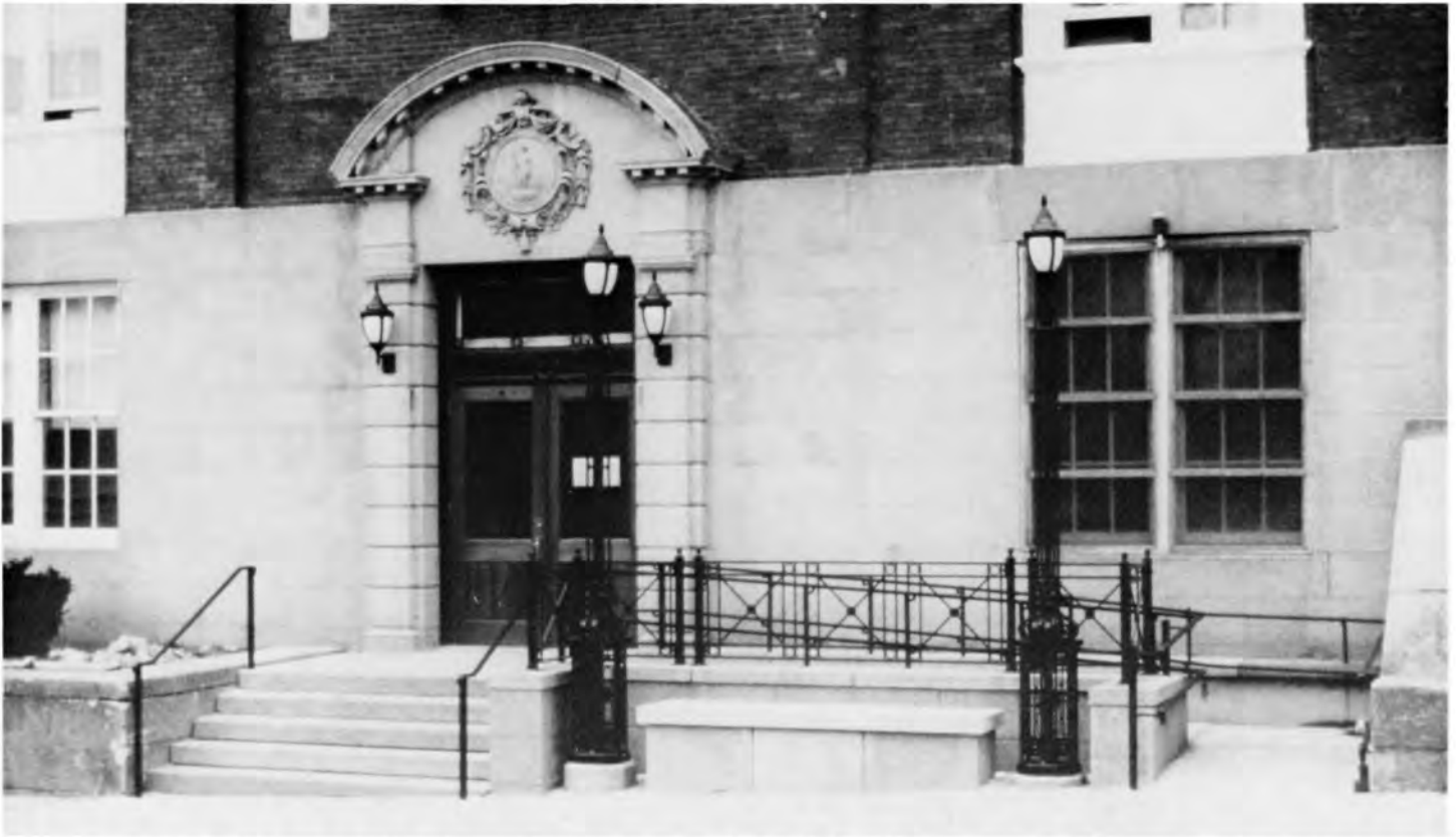
Figure 3: Somerville City Hall. Somerville, Massachusetts. Ramped front entrance. The front entrance's historic design included symmetrically positioned retaining walls and planter beds. The new ramp is successful primarily because its scale is compatible with the building's formal entrance.