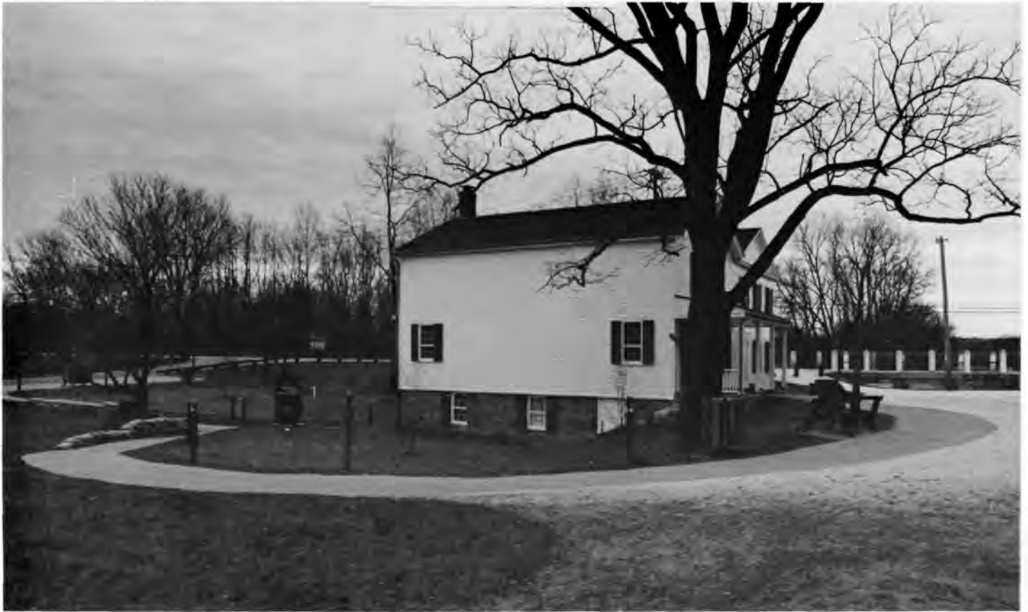
Figure 2: Locktender's House, Cuyahoga Valley National Recreation Area, Ohio. The ca. 1830 Locktender's House on the Ohio and Erie Canal serves as the Visitors' Center for the park. Recent alterations of the building conform with the requirements of the Uniform Federal Accessibility Standards (UFAS). There are designated parking areas, properly graded ramps and walkways around the site, and access within the building to all amenities, such as restrooms, telephones, drinking fountains, and display exhibits.

there has to be a level platform at the entrance, the threshold must be minimal, doors have to open without difficulty and be wide enough to accommodate a wheel chair. The ATBCB proposed minimum requirements for historic buildings are currently found in Uniform Federal Accessibility Standards (UFAS) and are intended to be consistent with the American National Standards Institute (ANSI) requirements which are widely used by state and local building code officials. These current requirements are being revised for use by the ADA and will include provisions for visually and hearing-impaired people.