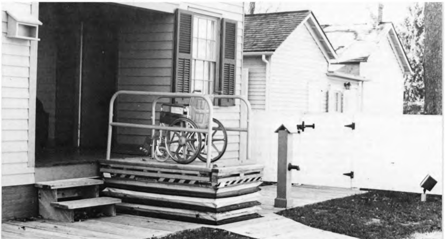
Figure 4: Lincoln Home National Historic Site. Springfield, Illinois. The front entrance could not be altered because of its exceptional significance in association with President Lincoln. Thus, a modified industrial scissors lift (that retracts to ground level when not in use) was installed at the rear porch entrance. A fabric skirt protects the mechanical pit that houses the hydraulic mechanism. Due to security reasons, an NPS park ranger assists disabled individuals into the house through cordoned-off areas to the house's front rooms. The second floor is not accessible to the disabled; however, because the Lincoln Home is part of a historical park, providing alternative exhibits at the nearby visitors' center, the limited first-floor access to the historic house appears to meet minimum requirements.