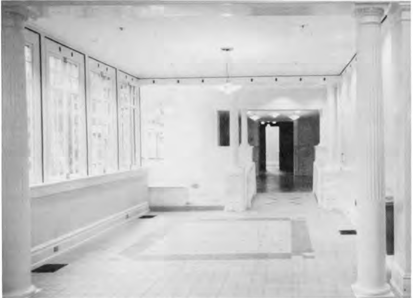
Figure 6: The Green Door (a non-profit service for the disadvantaged). Washington, D.C. Small ramps between areas with different floor levels were installed (as seen in rear of the photograph). As part of a recent rehabilitation, continuous access was provided from a side entry throughout the principal floor. Selectively removing doors from their hinges, a 32" clear-corridor path required by code was created. When a disabled client needs to use the services provided on upper floors, meetings can be held in the first floor conference room. The solution meets alternative program requirements in lieu of providing an elevator to the building's upper levels.

money damages may also be awarded. For owners of historic properties who claim that accessibility modifications would destroy the property's significance, administrative efforts must be explored to find alternative program solutions. If equal access or program alternatives cannot be provided, owners should consider limiting all public access to the historic property.