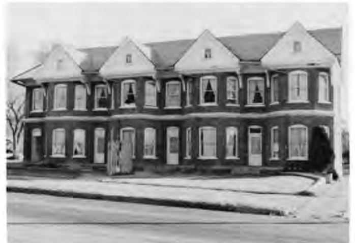
Ogden, Utah, has incorporated historic preservation into its comprehensive planning process, thereby helping to protect resources such as the buildings shown on this page.

While the comprehensive planning process varies in communities across the country, it provides an excellent means by which to integrate historic preservation into the future of our towns and cities. Whether the process is an on-going one, such as Ogden's, or a more traditional one resulting in a final plan and implementation strategy, the key to successfully integrating preservation into a comprehensive plan is to define its roles in all aspects of the plan. By articulating these roles in the central business district, neighborhoods, transportation, educational and recreational opportunities and the like, historic preservation can become part of a community's future.