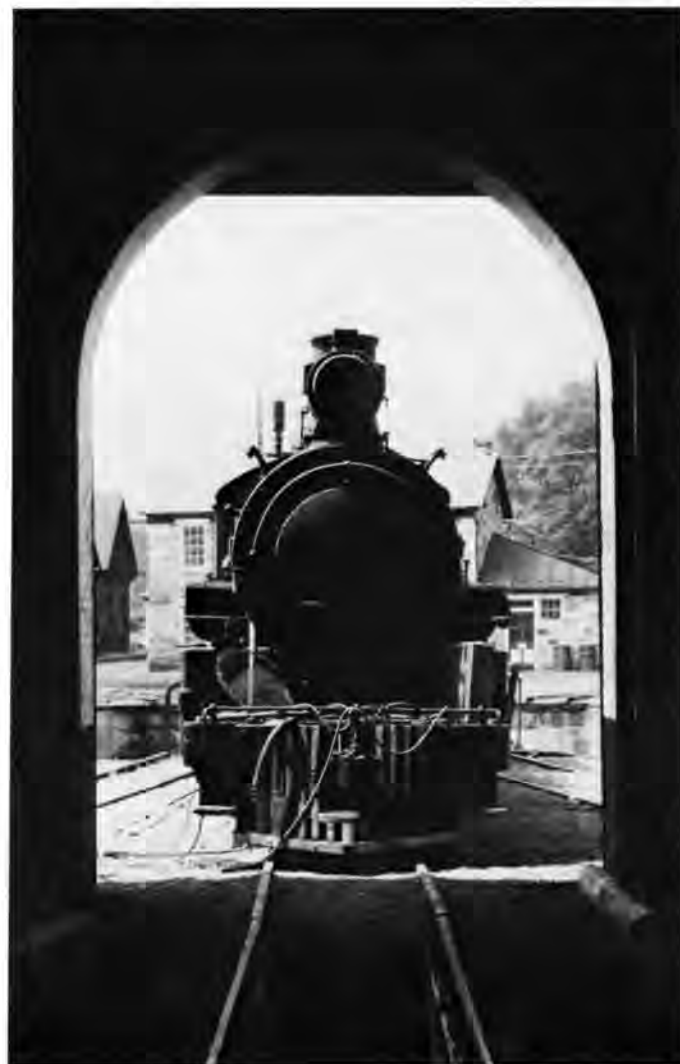
EBT locomotive.