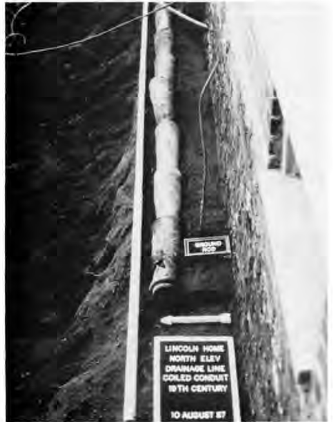
Historic drainage line and lightning ground rod discovered near the Lincoln Home foundation in 1987.

Investigations carried out during restoration of the Lincoln Home in Springfield, IL, for example, revealed several archeological features dating either earlier or later than the targeted 1860-1861 restoration period. In fact, most of the archeological finds about the Lincoln Home bore no relationship whatsoever to its famous resident. Nevertheless, such "non-historic" remains hold the prospect of telling us much about changing patterns of urban life. Therefore, those responsible for oversight of restoration projects must take care to ensure that the preservation of one cultural resource does not destroy another inadvertently. If such an undertaking is expected to cause substantial ground disturbance, investigators should exercise caution relative to any cultural resources that might be present. The burial of new utility connections to an existing structure, for example, could very well disturb the remains of a former outbuilding. There is also a distinct possibility