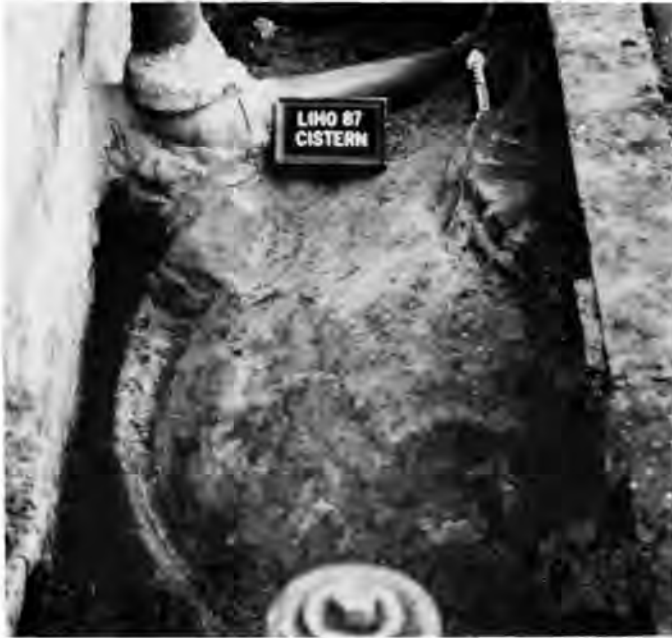
Historic cistern exposed during foundation work at the Lincoln Home.

substantial disruption of the area immediately around the structure. Therefore, the undertaking is no different from any other ground disturbing action that requires environmental and historic preservation review and compliance.