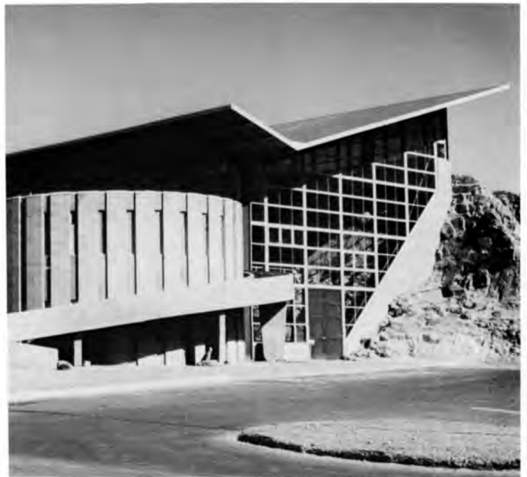
Quarry Visitor Center, Dinosaur National Monument.

N estled in the northeastern corner of Utah is one of the most famous and important windows onto the 150 million-year-old world of the dinosaurs—Dinosaur National Monument. Discovered in 1909 by Earl Douglass of the Carnegie Museum, the Carnegie Quarry at Dinosaur has produced the remains of several hundred dinosaurs belonging to 11 species, along with crocodiles, turtles, lizards, and amphibians. While most of these remains were not complete, nearly two dozen skeletons were complete enough to be mounted. Over the last 75 years, the material collected at the quarry has given us an outstanding sample of the large dinosaur vertebrate community dating from the Upper Jurassic in the western United States.