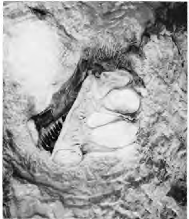
Camarasaurus skull fossil seen at the Quarry Visitor Center.

One of the most pressing needs of the park is for more information concerning the distribution and significance of fossils. This information is needed in order to develop a plan for systematically collecting, protecting, and preserving this resource. In 1990, a multi-year inventory project was started under contract. Some 170 sites have been located and documented to date. Some of these significant sites are so threatened that excavations have already begun. A geological study is running concurrently with this inventory and will focus on describing the environments represented in the rock record and provide radiometric dating for significant intervals. This will provide a geological framework for the fossil inventory and will allow for comparisons with similarly aged fossil deposits elsewhere in the U.S. A third study inventorying dinosaur footprints and trackways is also underway and has already made a number of significant finds.