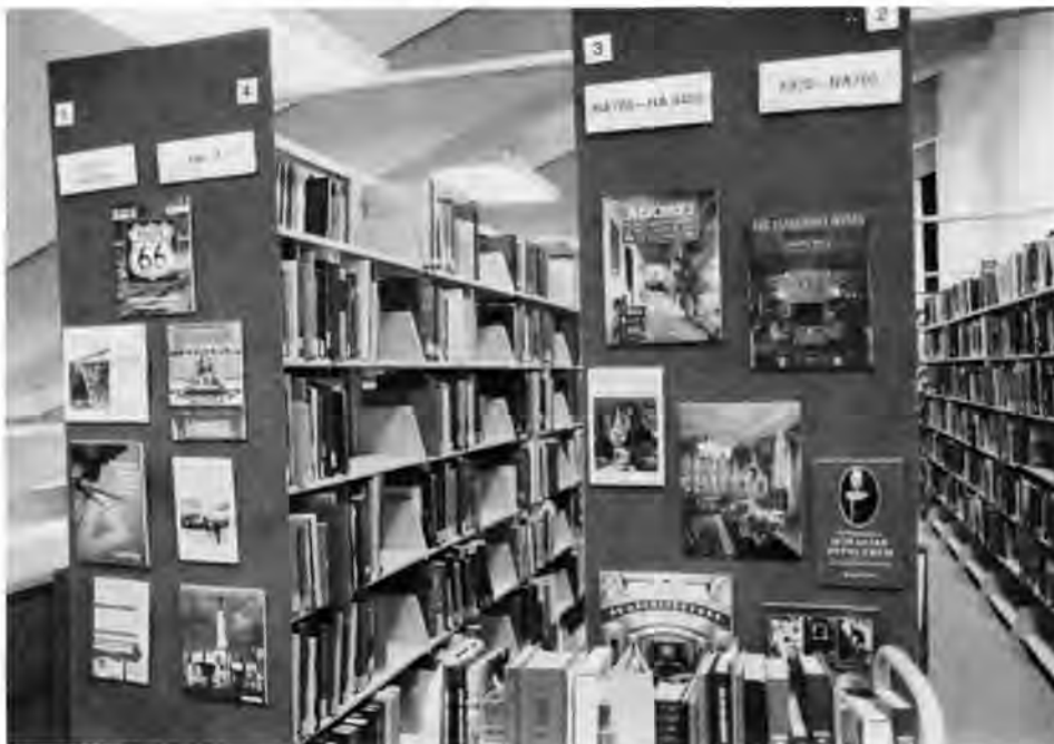
National Trust for Historic Preservation Library Collection of the University of Maryland.