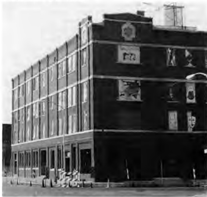
The Grace Hotel in Abilene, Texas, is being restored and adapted to house the city's new Museum Center.

Soon after its founding, the League conducted surveys to determine the extent of historic resources within Abilene. Over 200 properties were determined to be of value, with 63 recommended for designation. In 1983, the City Council passed the Abilene Landmark Preservation Ordinance, creating an 11-member Landmark Commission as an agency of city government. The following year, amendments to the Ordinance linked the city's zoning code to historic preservation activities by creating an historic overlay zone. Designated historic properties within the zone receive an automatic property tax reduction, thus showing property owners a concrete benefit for owning an historic property. In addition, if the property owner undertakes an appropriate rehabilitation, a further property tax reduction is available.