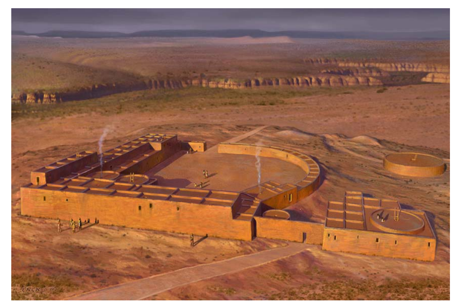
Illustration by Cory Ench of Pueblo Pintado it may have appeared in AD 1100, based upon a model by Ron Cox.

THE NAME – In 1849, the Washington Expedition, a military reconnaissance under the direction of Lt. James Simpson, surveyed Navajo lands. As the party traveled west from Santa Fe, Pueblo Pintado (Spanish for "painted village") was the first Chacoan site they encountered. Carravahal, a Mexican guide with the expedition named the site. Pueblo people on the expedition called it Pueblo de Montezuma . This Chacoan site was also known as Pueblo de los Ratones , or "village of the mice," Pueblo Colorado or "red village," and Pueblo Grande , or "large village." Its Navajo name is Kin teel , or "wide house."