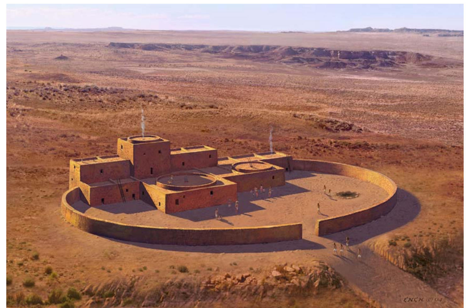
Illustration by Cory Ench of Kin Klizhin as it may have appeared in AD 1100, based upon a model by Ron Cox.

THE NAME – Tsin Lizhin or "black wood" in Navajo, possibly in reference to the charcoal or charred timbers found at the site. The name is a variant of the Navajo Tsin Nitl'iz or "hard wood," "black wood "or" charcoal place."