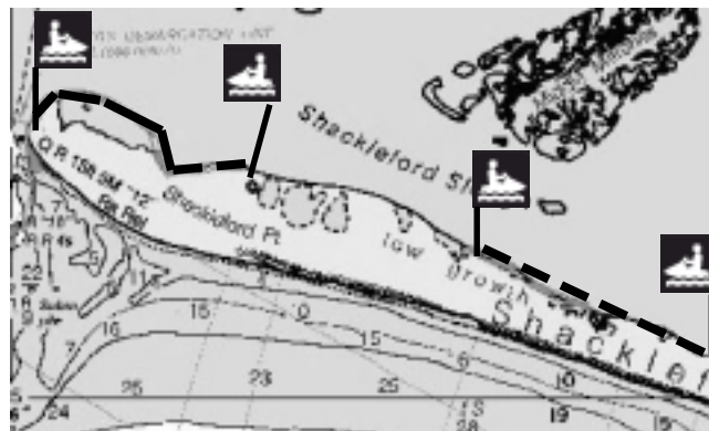
Shackleford Banks landing areas