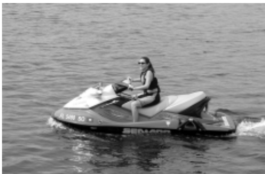
This PWC is operating at flat -wake speed