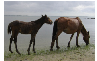
63's 2005 foal plays with her tongue while her dam grazes at the edge of Back Sound.