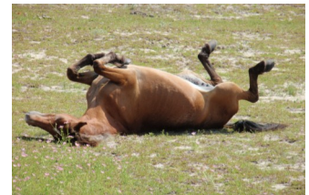
Even at 30 years of age, a good roll scratches the back and fluffs up the hair coat.