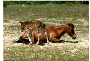
63's 2004 foal exploring around her dam.

For information on adoption of other horses, contact the Foundation.