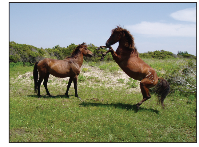
This dispute has escalated to a moderately high level; it's over mares but they're not in estrus. This harem has two stallions: the alpha, right, is putting the beta in his place.

Enjoy wild horse watching in your National Seashore. Bring binoculars. Choose a good vantage point where you can see all the horses at a glance (this keeps you from accidentally getting in the way or getting hurt). Relax and enjoy horse watching at its best.