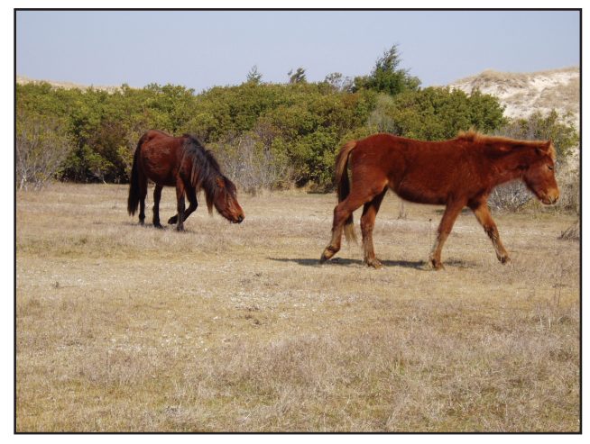
Stallion herding posture involves a straight head-neck line, lowered nose, and pinned ears. To the mare, this means "move!"

The more dominant the stallion (the higher on the hierarchy he is) the less he has to herd his mares to keep them safe from other stallions.