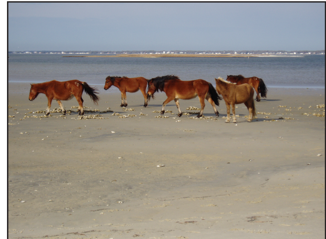
What appears to be a random order actually has its base in the harem hierarchy. The alpha mare is leading and the stallion is last, on the far side.

Instead of leading, stallions most often follow the mares as they move from place to place. As long as the mares are far enough