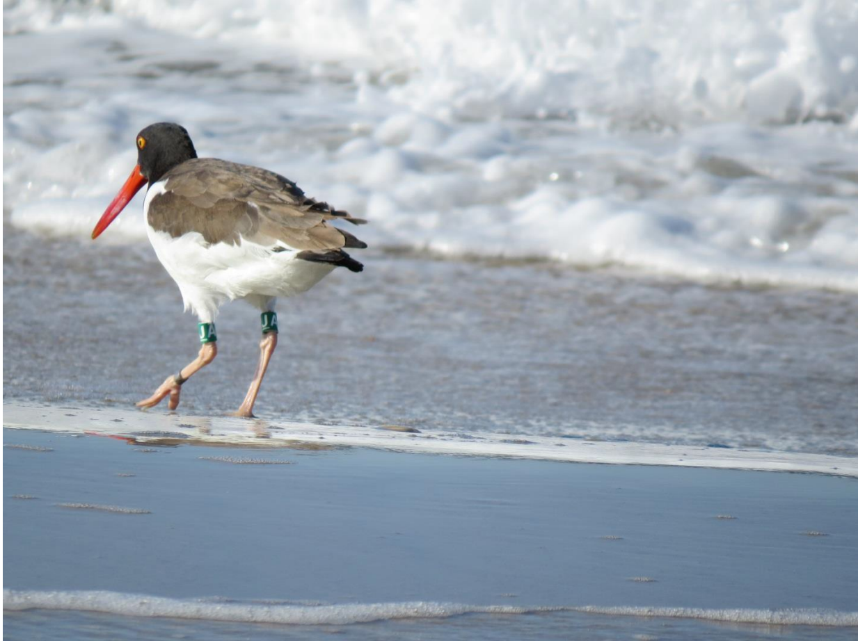
American Oystercatcher dark green (JA), banded as a chick in 2010, returned to nest at Cape Point in 2015.

NATIONAL PARK SERVICE CAPE LOOKOUT NATIONAL SEASHORE 131 CHARLES STREET HARKERS ISLAND, NC 28531